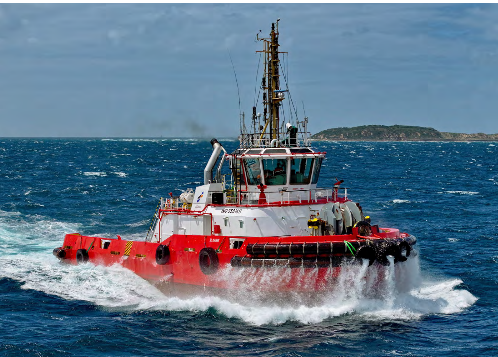
SL KAMAY Australia

The editors regrets that the e-magazine is unable to supply photographs published in Worldwide Tug & OSV News.