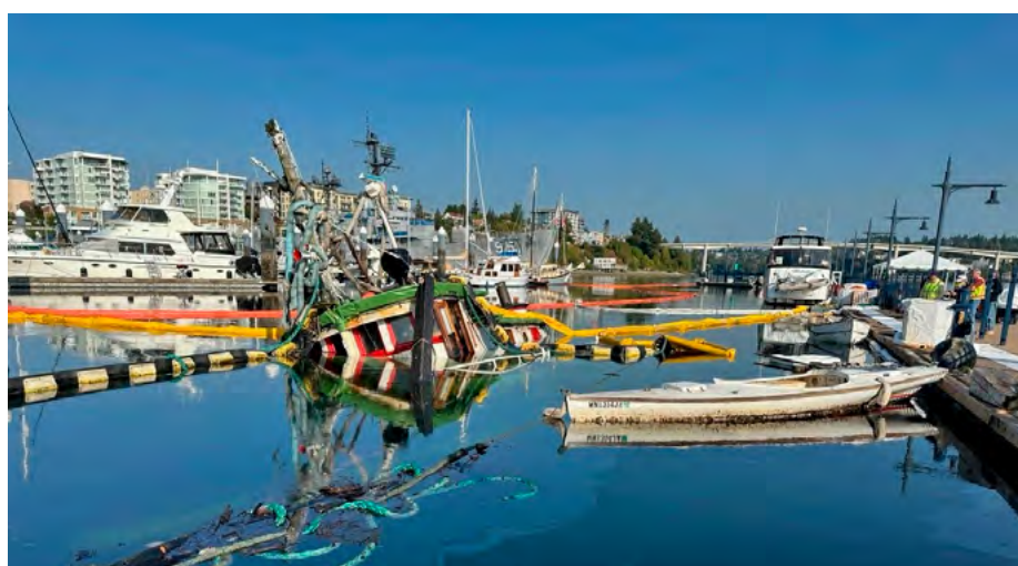
DOMINION United States