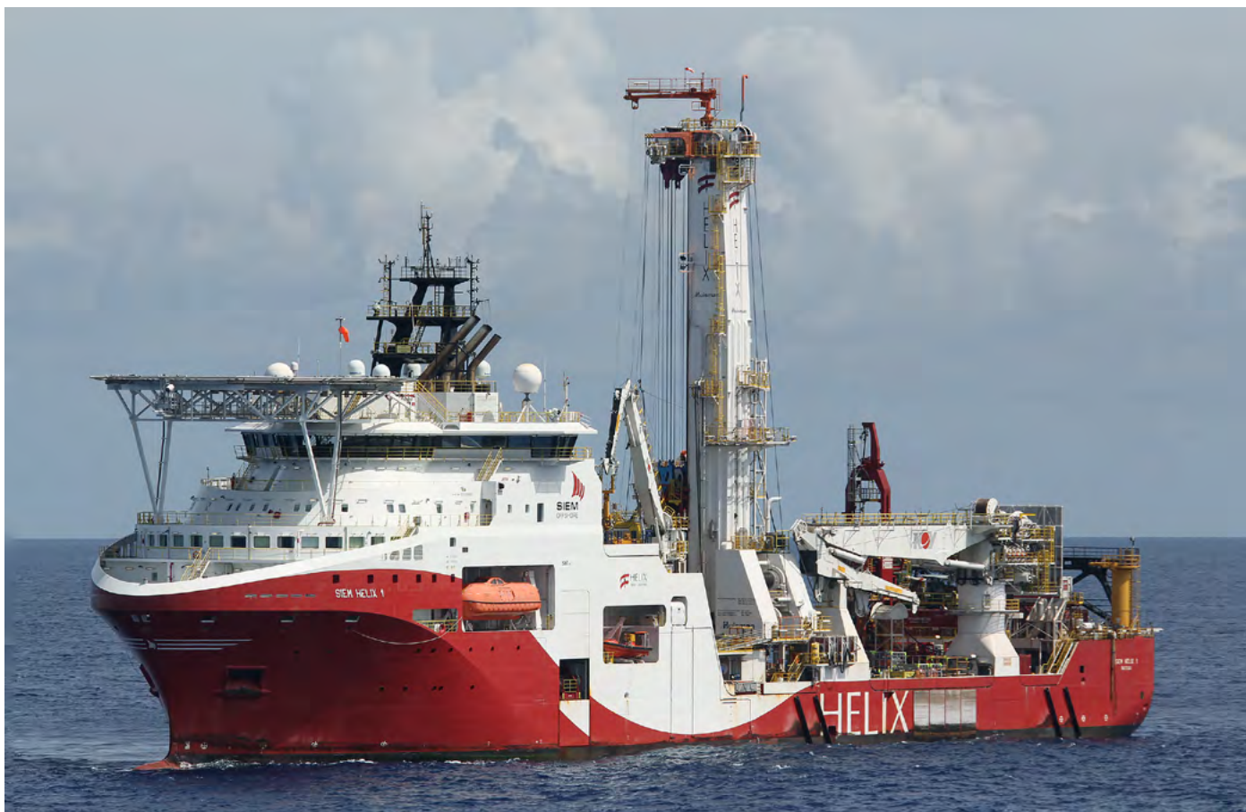
SIEM HELIX 1 Norway

AHTS Men Goe (2025 – 1060069). Yard: Holland Shipyards, ynr. H2025-0083. 938 GT. Dim. 52,05 x 15,00 x 4,50 mtr. Engines: 2x Caterpillar, 3512. Output: 4.800 bhp. Bollardpull: 72 tonnes, speed: 12,8 kn. Fi-Fi