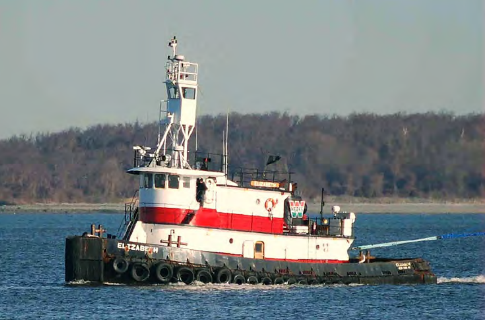
ELIZABETH United States