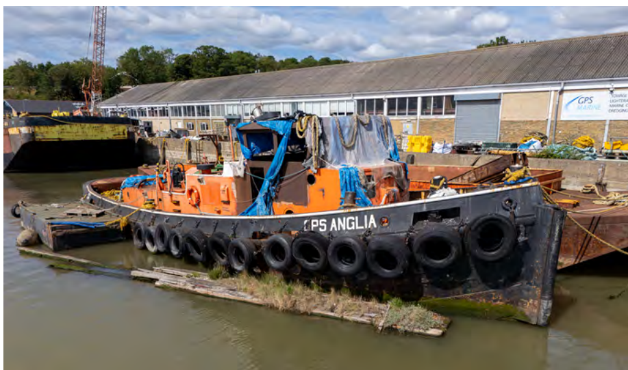
GPS ANGLIA United Kingdom

AHTS vessels Sharief Falcon , ex Cyk Falcon