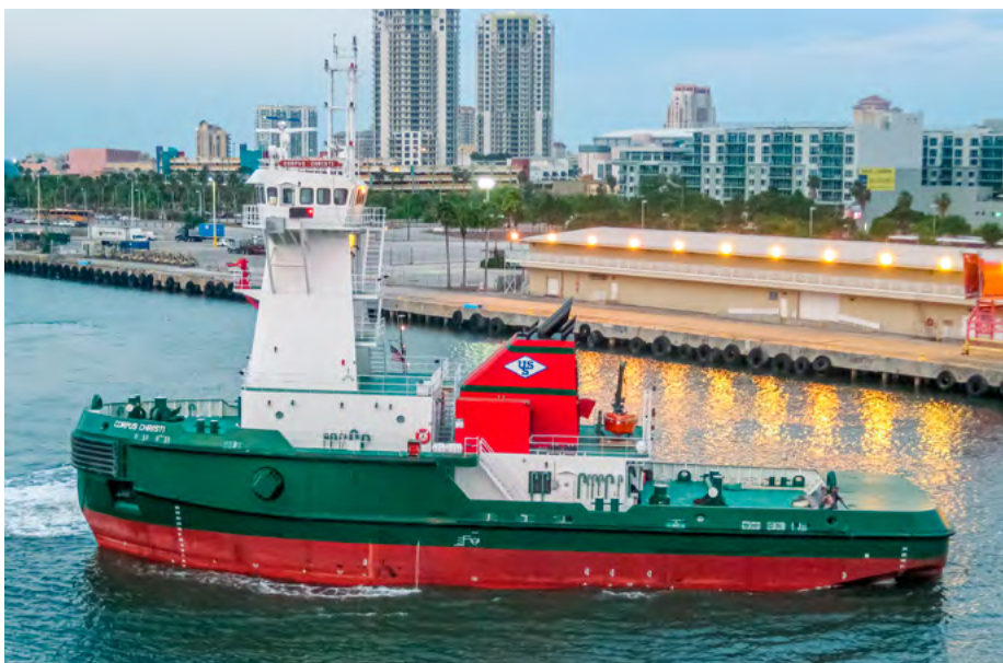
CORPUS CHRISTI United States