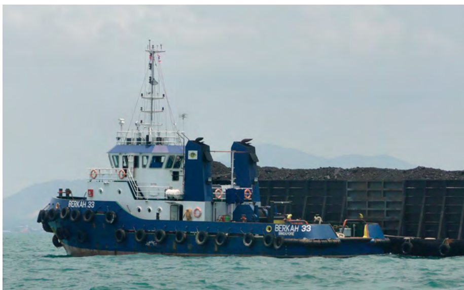
BERKAH 33 Singapore

Tugs P&O Ghaith (2025 – 1070985) and P&O Al Saba (2025 – 1070997). ASD 2312 design. Yard: Damen Shipyards, Song Cam, ynr. 513649 and 513650. 263 GT. Dim. 22,81 x 11,40 x 4,40 mtr. Engines: 2x Caterpillar, 3512-C TA HD/D. Output: 5.168 bhp. Bollardpull: 70 tonnes, speed: 13,1 kn.