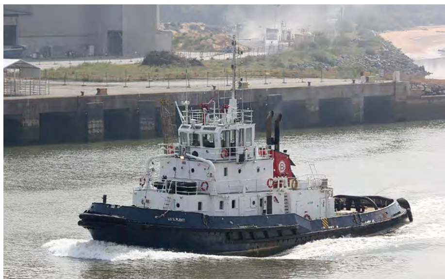
VB SUPLENTE Spain

Tugs ASD Iolite (2025 – 1060667) and ASD Zircon (2025 – 1060679). Yard: Bengbu Shenzhou Machinery Co. Ltd., ynr. 1661 and