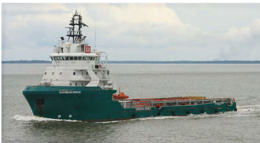
BOURBON HORUS France

Tug Tong Da Tuo 70 , ex Hua Yong Tuo 8 '14