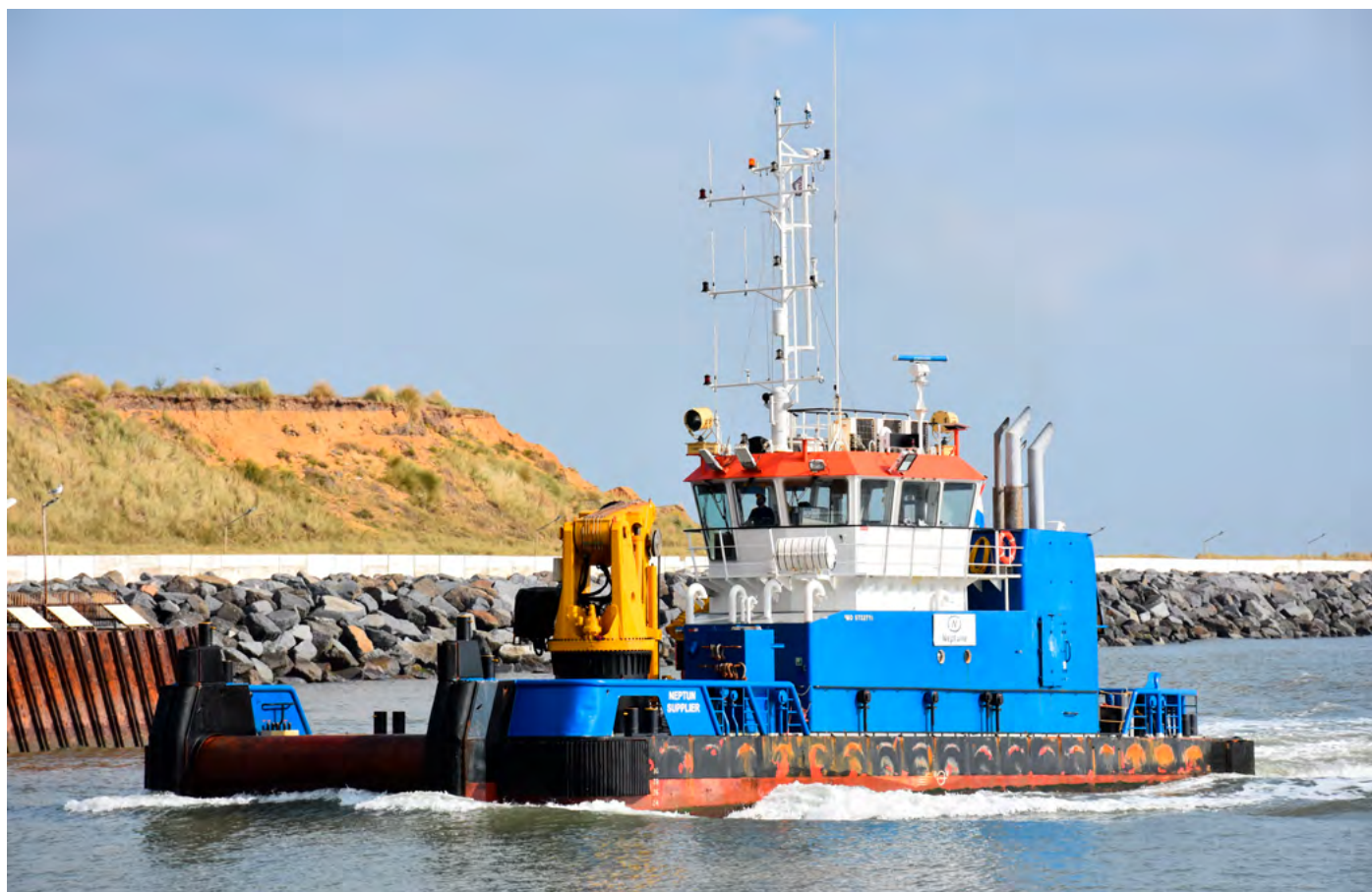
NEPTUN SUPPLIER The Netherlands

AHTS Liberty I , ex Bourbon Liberty 241 '23 (2011 – 9394715) owned and operated by