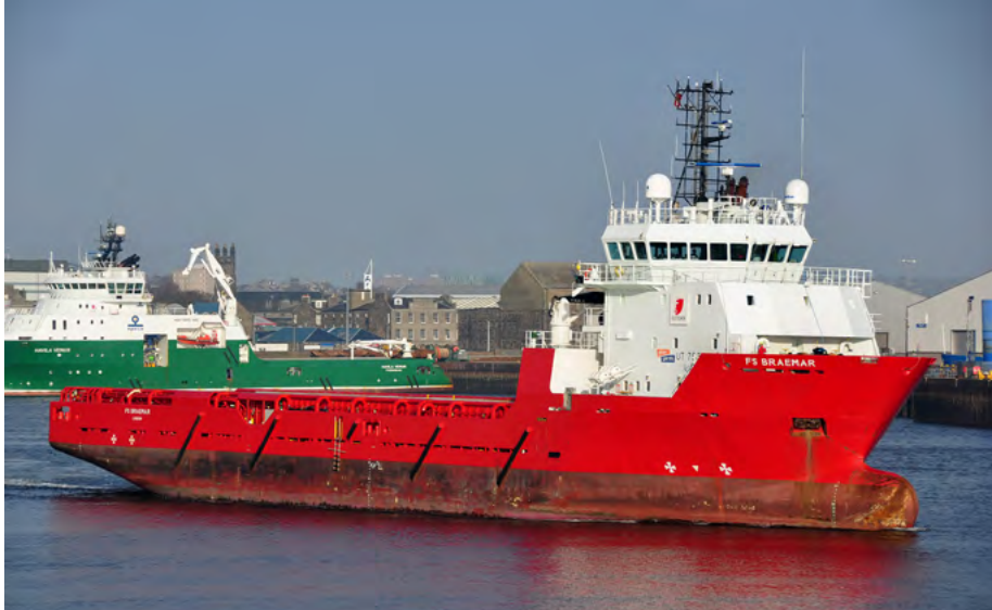
FS BRAEMAR United Kingdom