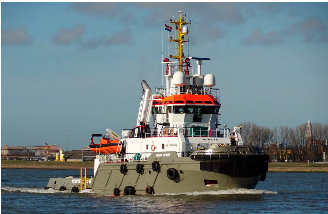
UNION BOXER Belgium