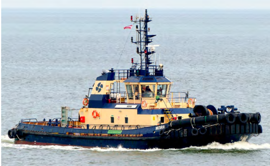
MOIRA United Kingdom