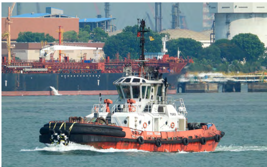
STAR TITAN Singapore