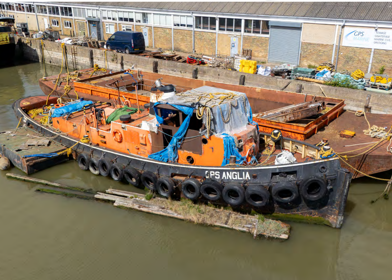
GPS ANGLIA United Kingdom

Worldwide Tug & OSV News can also be found on www.tugezine.com , www.towingline.com – Archive and www.sleepduwvaart.nl