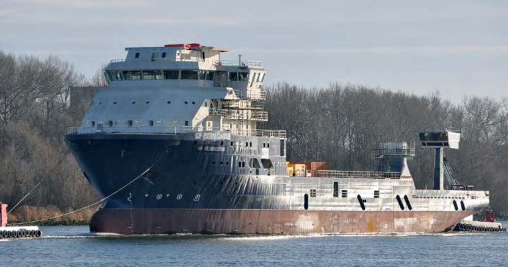
CF FORMIDABLE The Netherlands