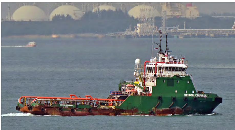
BRITIL COURAGE Singapore

Tug Eng Hup Herald (2016 – 9805166) owned and operated by Eng Hup Shipping Pte. Ltd. has been sold in 2023 to new owner