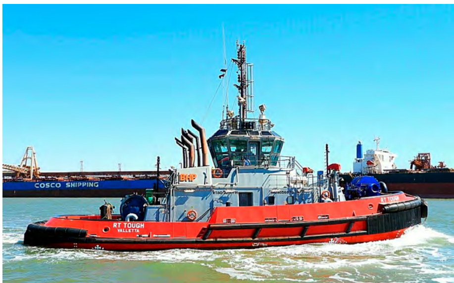
RT TOUGH Australia

AHTS Bossan (2011 – 9587908) owned by Neo Marine Services Int'l DMCC, operated by Royal Marine LLC has been transferred to new operator Novelty Service CJSC, Baku. Name and owner remains the same.