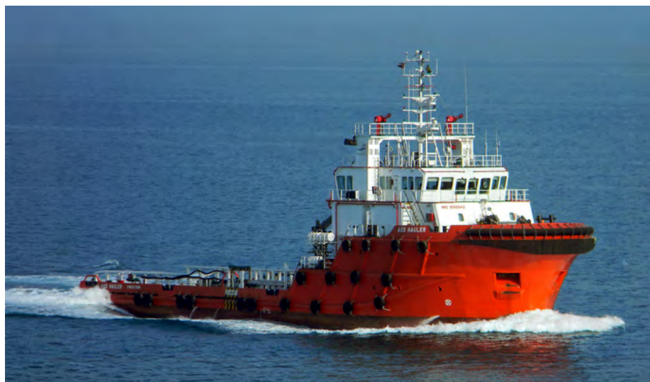
AOS HAULER United Arab Emirates

Tugs PSA Pegasus (2025 – 1060368) and PSA Vela (2025 – 1060370). Z-Tech 6000 design. Yard: Cheoy Lee Shipyards, ynr. 5295 and 5296. 397 GT. Dim. 27,50 x 12,00 x 5,06 mtr. Engines: 2x IHI Power Systems, 6L28HX. Output: 4.498 bhp. Owner and operator: PSA Marine Ltd., Singapore. Tug SA Unity (2025 – 1014826). Ramparts 2500-CL design. Yard: Cheoy Lee Shipyards, ynr. 5276. 348 GT. Dim. 25,40 x 11,80 x 4,60 mtr. Engines: 2x Caterpillar. Output: 5.068 bhp. Bollardpull: 63,9 tonnes, speed: 13,9 kn. Owner: JS Tugs Services Sdn. Bhd., operator: Beyond Shipmanagement Pte. Ltd., Singapore. Tug Winning Tug 3 (2025 – 1092763). Yard: Vitawani Shipbuilding Sdn. Bhd., ynr. VT20. 391 GT. Dim. 28,17 x 11,50 x 5,05 mtr.