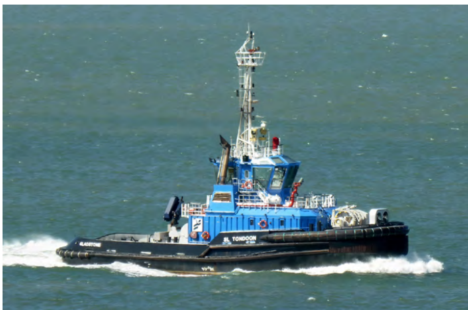
SL TONDOON Australia