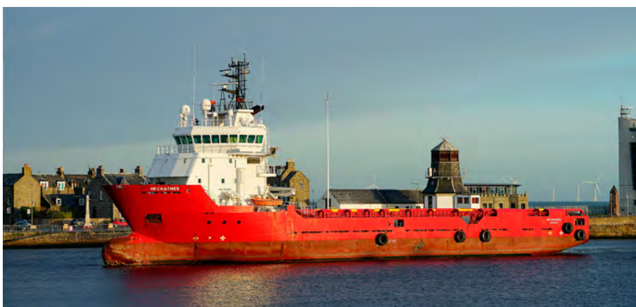
ACE CRATHES United Kingdom