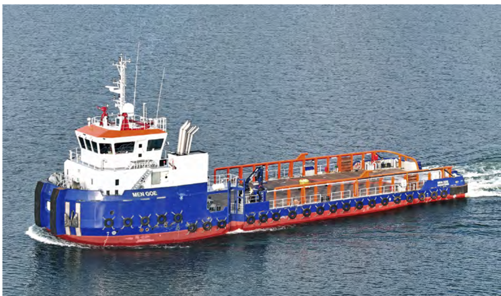
MEN GOE The Netherlands

AHTS vessels Bourbon Liberty 227 (2010 – 9394648) and Bourbon Liberty 247 (2011 – 9573555) owned by resp. Bourbon Liberty 227 SNC and Bourbon Liberty 247 SNC, both operated by Bourbon Offshore Greenmar Ltd. have been sold to new owner and operator resp. Luxe Sapphire LLC and Luxe Pearl LLC, Nevis (KNA) and have been renamed resp. Luxe Sapphire and Luxe Pearl .