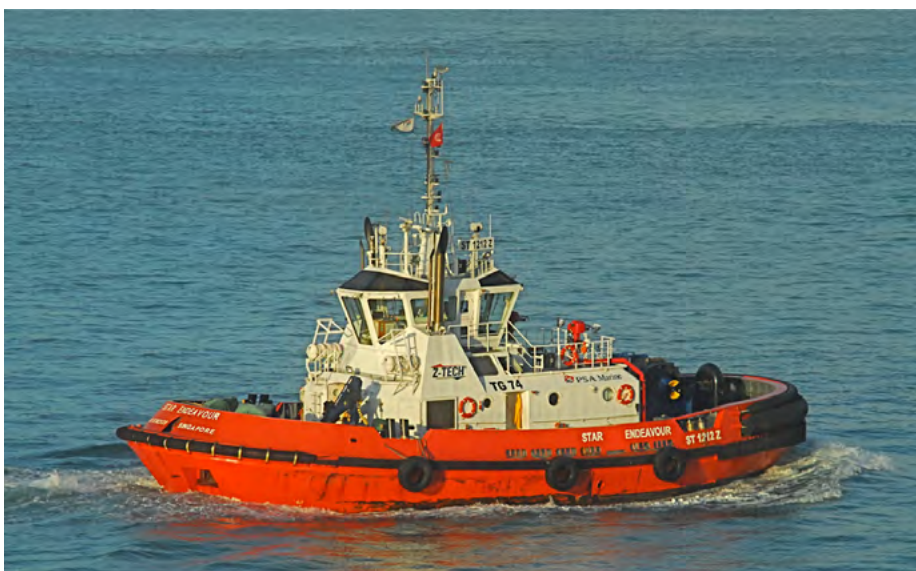
STAR ENDEAVOUR Singapore

Tug Alyasat 1 (2025 – 9988607). Yard: Eregli Gemi Insa Sanayi ve Ticaret, ynr. 145. 497 GT. Dim. 29,64 x 13,20 x 5,57 mtr. Output: 4.700 bhp. Nu further details available. Owner and operator: Aegir Marine Ltd., Majuro.