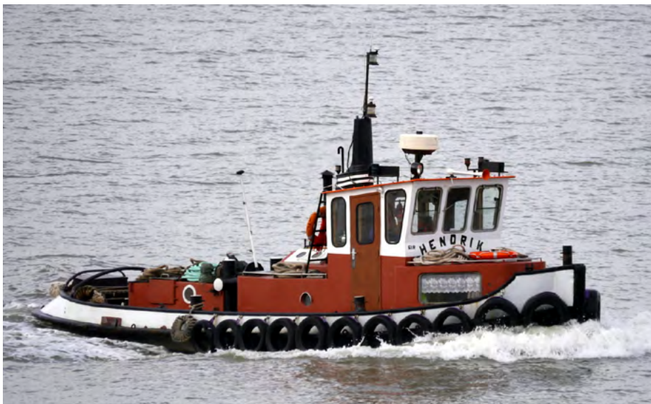
SIR HENDRIK United Kingdom

1070959). ASD 2813 design. Yard: Damen Shipyards, Song Cam, ynr. 513358, 513356 and 513329. 389 GT. Dim. 27,59 x 12,30 x 5,15 mtr. Engines: 2x Caterpillar. Output: 6.862 bhp. Speed: 12,7 kn. Owner and operator: Western Coast Port Services Ltd., Jeddah. OSV Zaki Symphony (2025 – 1073925). Yard: Guangzhou Shunhai Shipyards Ltd., ynr. SH185. 970 GT. Dim. 48,00 x 14,00 x 4,20 mtr. Engines: 2x Yanmar Engine (Shanghai) Ltd. Output: 3.098 bhp. Speed: 10 kn. Owner and operator: Zaki Al Zayer Marine Services, Al Amamrah Dammam. OSV Zamil 66 (2025 – 1095155). Yard: Jiangsu Soho Marine Heavy Industry, ynr. 1.669. 2.559 GT. No further details available. Owner Pac-Union Marine Services, operator: Zamil Offshore Services Co. Ltd., Al-Khobar.