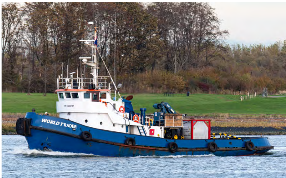
WORLD TRADER The Netherlands