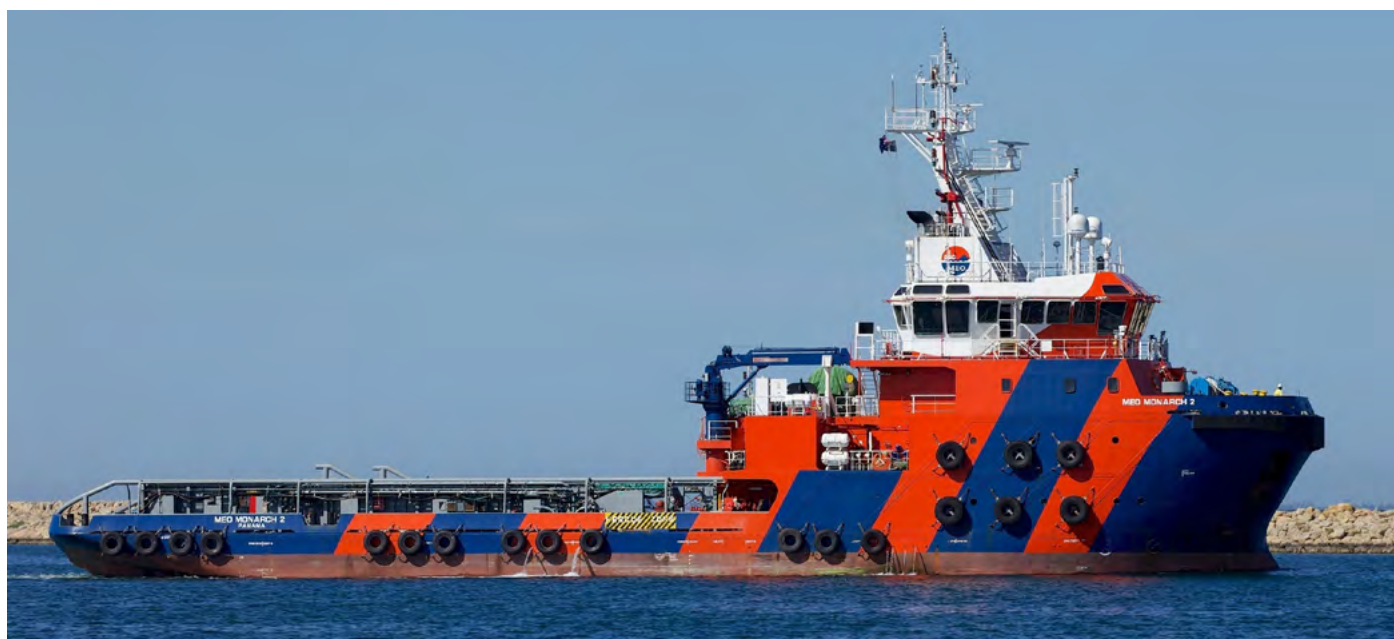
MEO MONARCH 2 Indonesia

OSV Bourbon Rainbow (2013 – 9530137) owned by Mars Offshore Pte. Ltd., operated by Bourbon Offshore Surf SAS has been sold in 2025 to new owner Southern Towing Ltd., operated by Inland & Offshore Contractors,