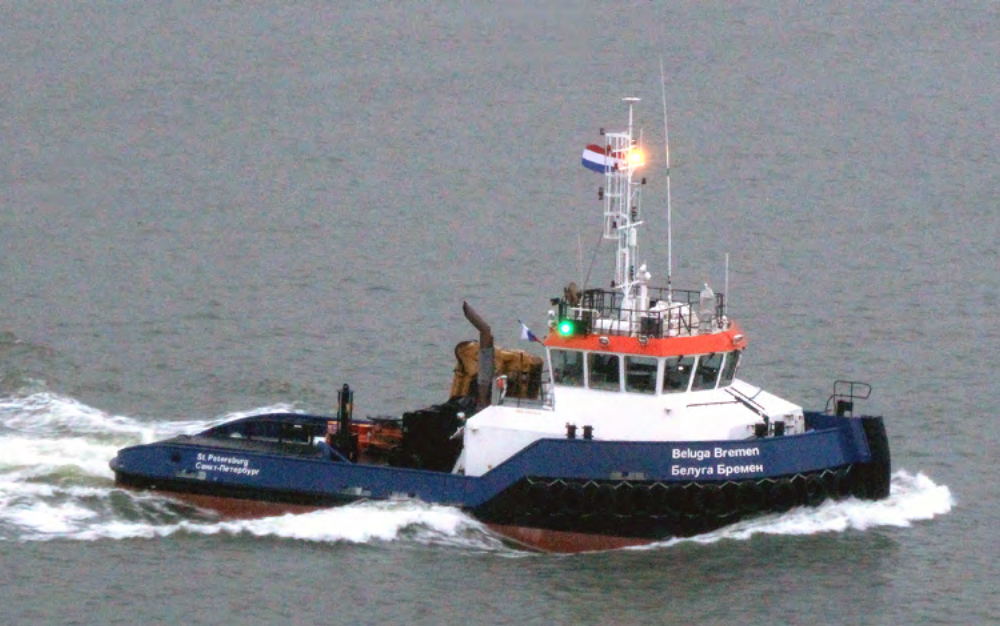
BELUGA BREMEN United Arab Emirates