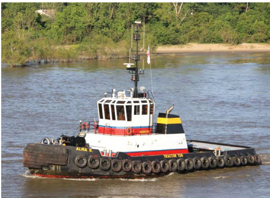
ALMA S United States

AHTS Posh Endurance (2014 – 9722194) owned by Swallow Pte. Ltd., operated by Posh Fleet Services Pte. Ltd. has been sold in 2025 to new owner and operator Astro