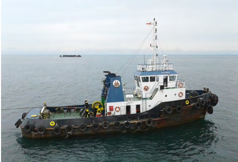
ENTEBE STAR 21 Indonesia

Tug Zuiyo Maru (1995 – 9136711) owned and operated by Lingsheng HK Marine Co. Ltd.