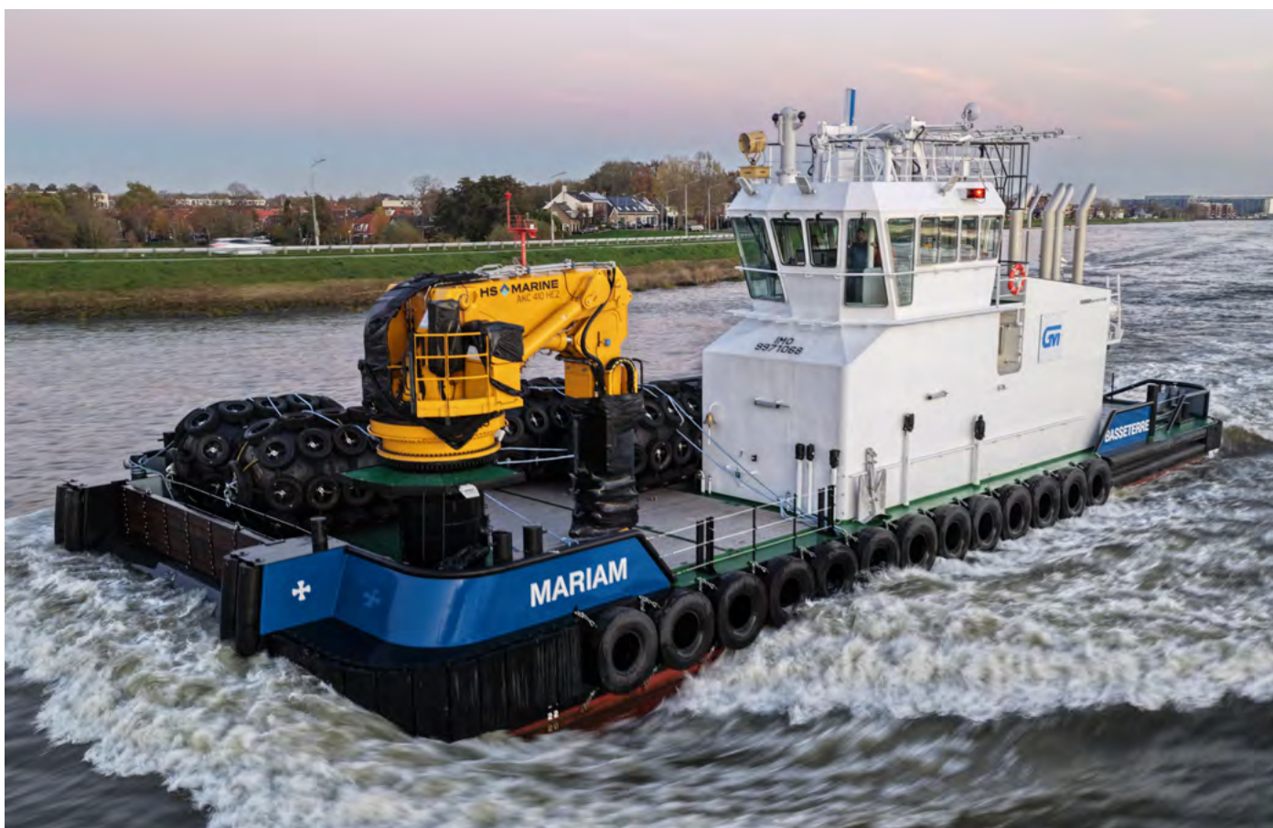
MARIAM United Arab Emirates

AHTS Men Cren (2025 – 1060057). Yard: Holland Shipyard, ynr. H2023-0225. 997 GT. Dim. 52,05 x 15,00 x 4,50 mtr. Engines: