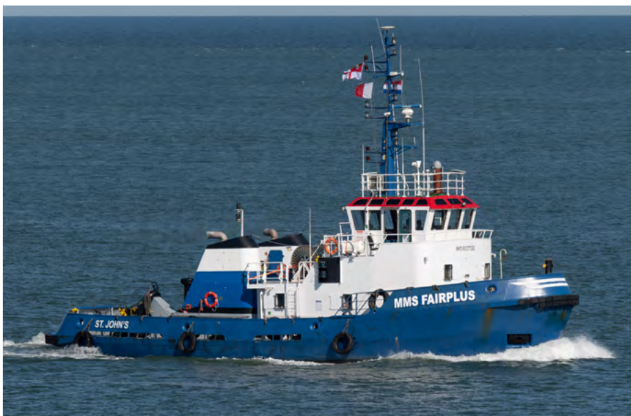
MMS FAIRPLUS Poland