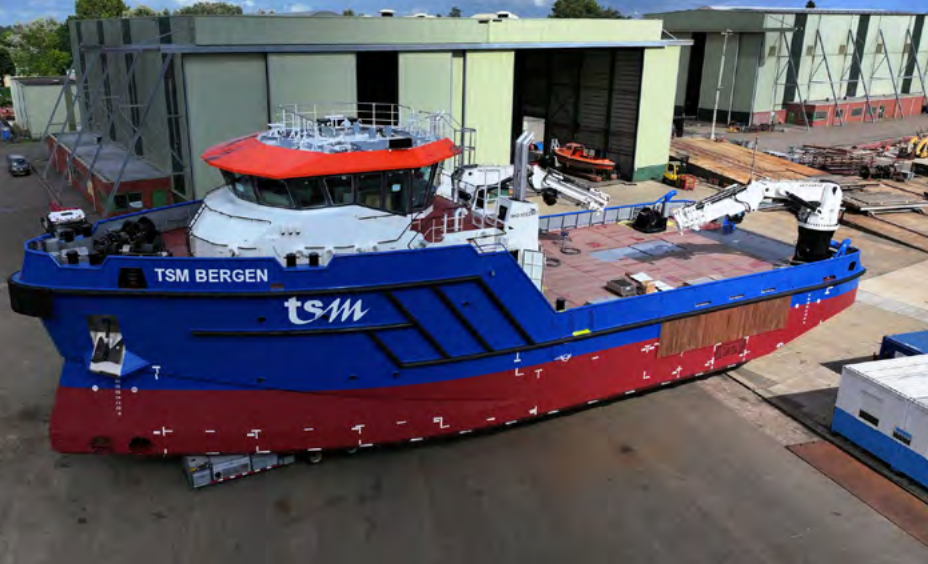
TSM BERGEN France