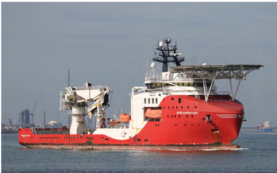
SIEM BARRACUDA Norway