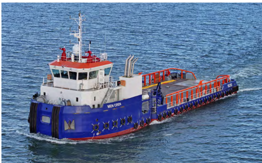
MEN CREN The Netherlands

Tug Kollbein Gron , ex Lamnalco Pelican '16 , Afrik Pelican '19 (1998 – 9171979) owned and operated by Togship HF has been sold in 2025 to new owner Ice Tugs SP/F, operated by JV Easytug Marine Contractors, Slidrecht (NLD) and has been renamed Herkules .