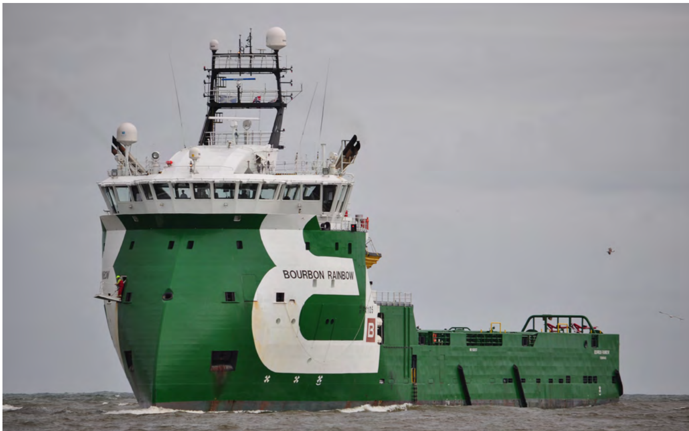
BOURBON RAINBOW France