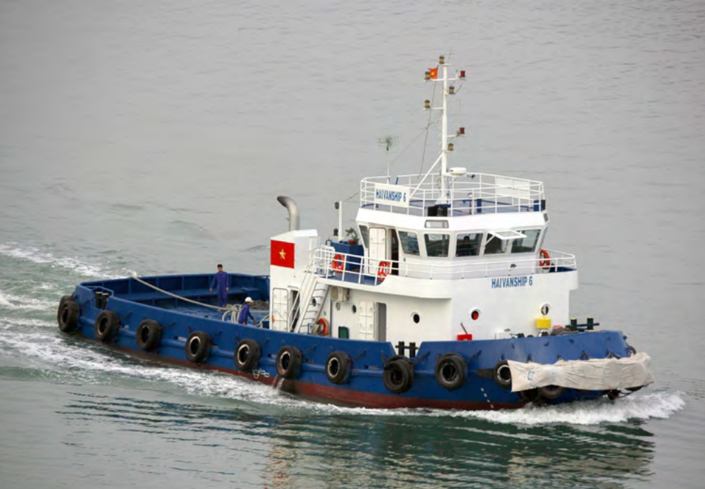
HAIVANSHIP 6 Vietnam