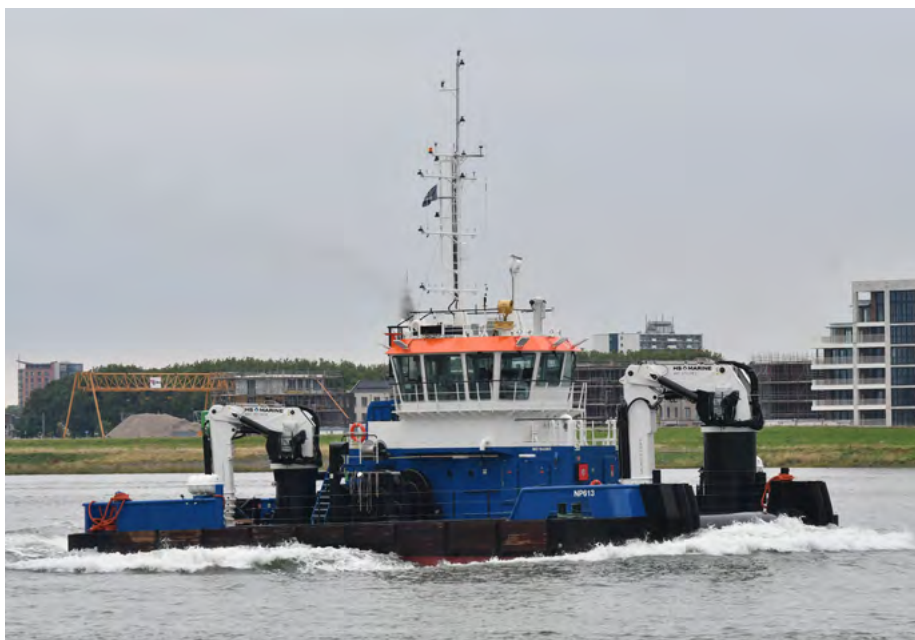
NP 613 The Netherlands