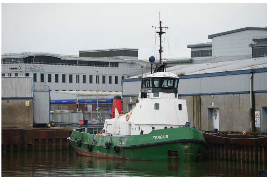
FERGUS United Kingdom