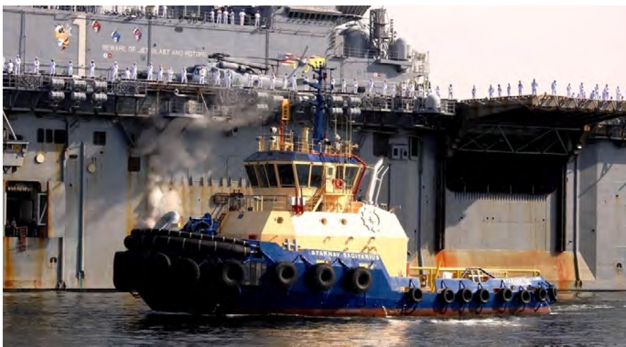
STARNAV SAGITARIUS Brasil

Boluda Towage continues to advance its global expansion strategy with the