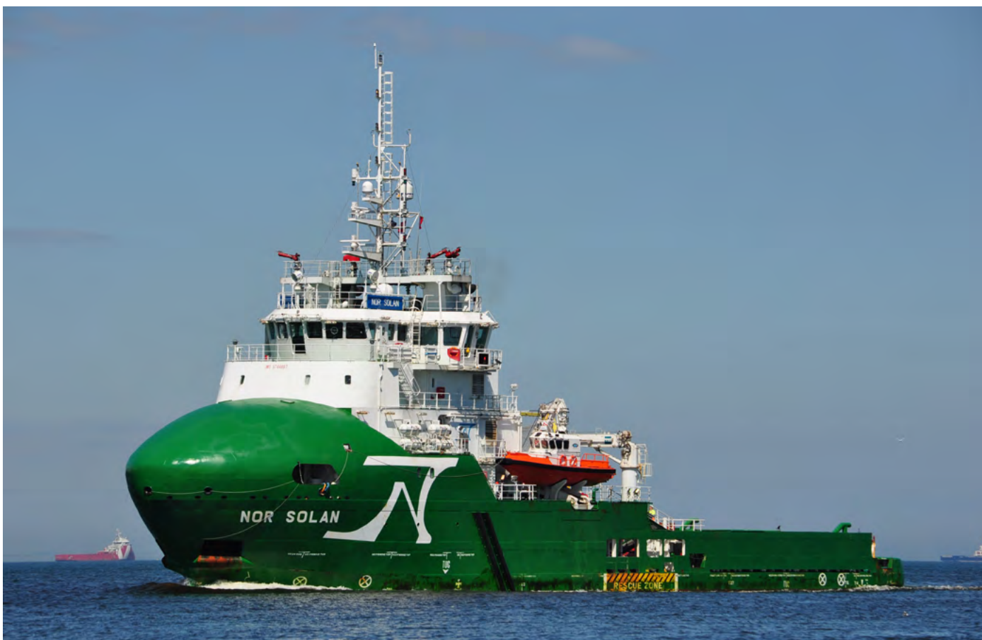
NOR SOLAN Norway