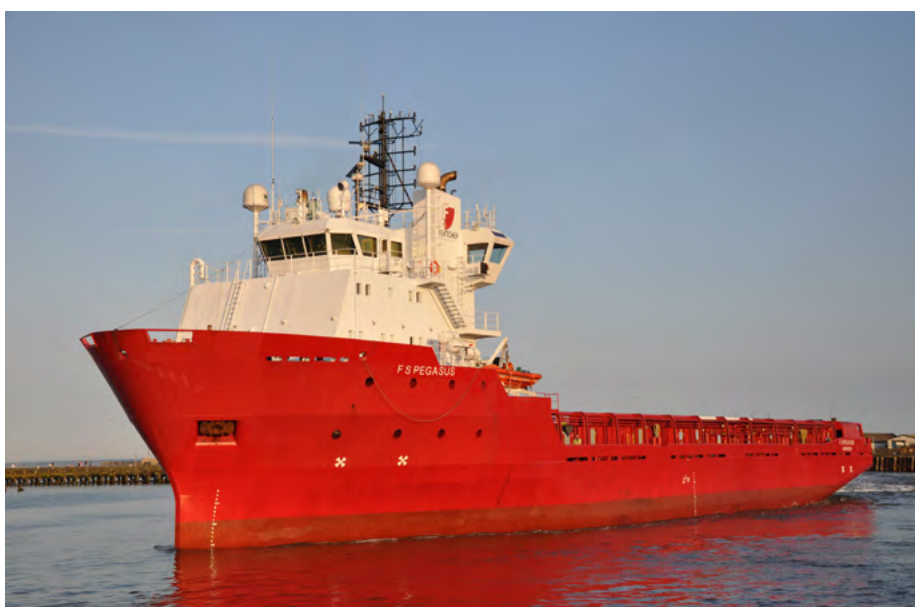
FS PEGASUS United Kingdom

Tugs Sahel 283 (2025 – 1070923), Sahel 284 (2025 – 1070947) and Sahel 285 (2025-