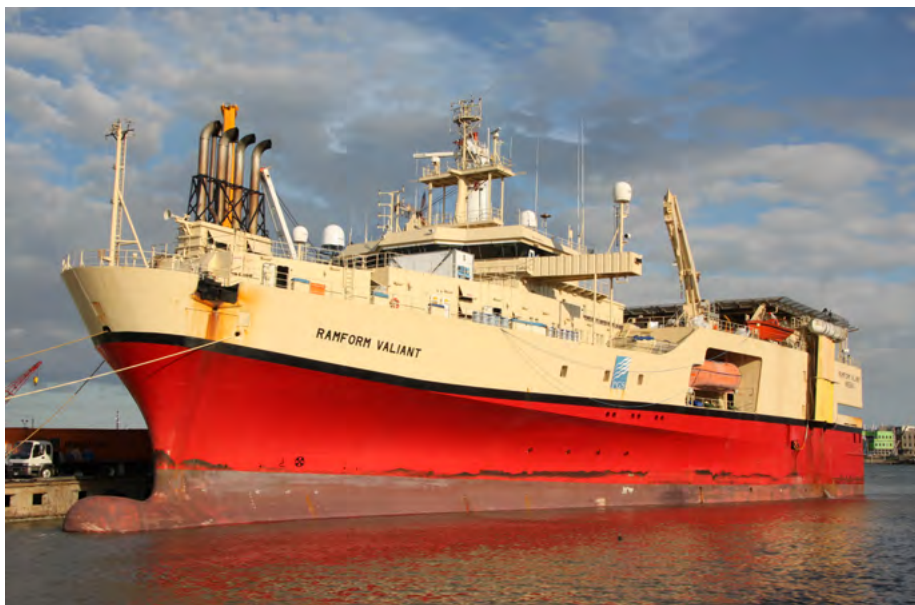
RAMFORM VALIANT Norway