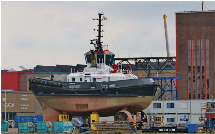
DMS 50 Belgium

Tug Teja (2025 – 1040227). Ramparts 2500-CL design. Yard: Cheoy Lee Shipyards, ynr. 5290. 348 GT. Dim. 23,90 x 11,80 x 4,60 mtr. Engines: 2x Caterpillar. Output: 5.068 bhp. Bollardpull: 63,9 tonnes, speed: 12,9 kn.