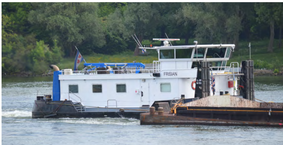
FRISIAN The Netherlands