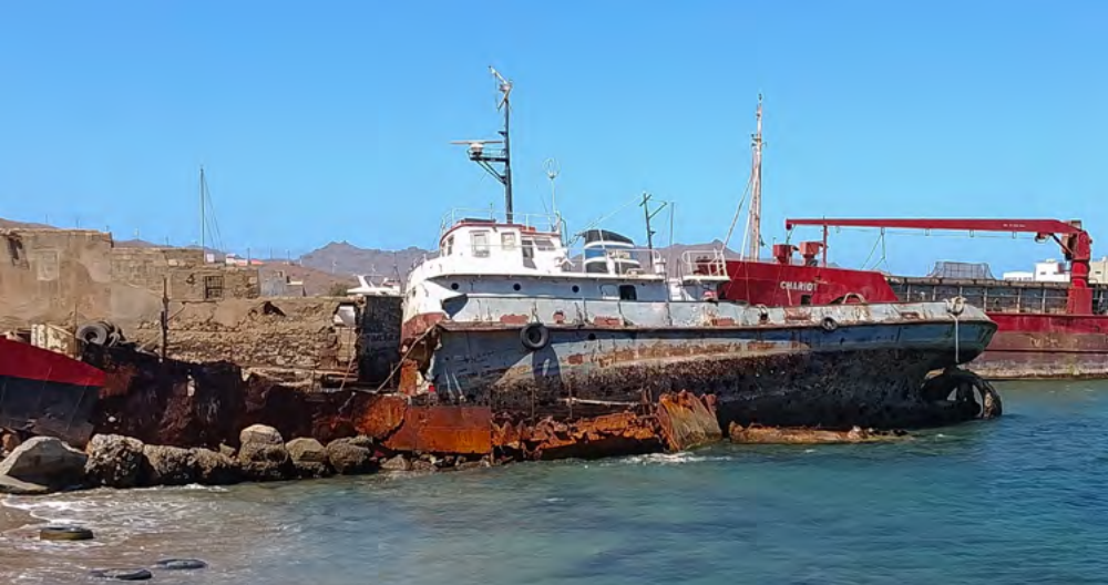
DAMAO Cape Verde