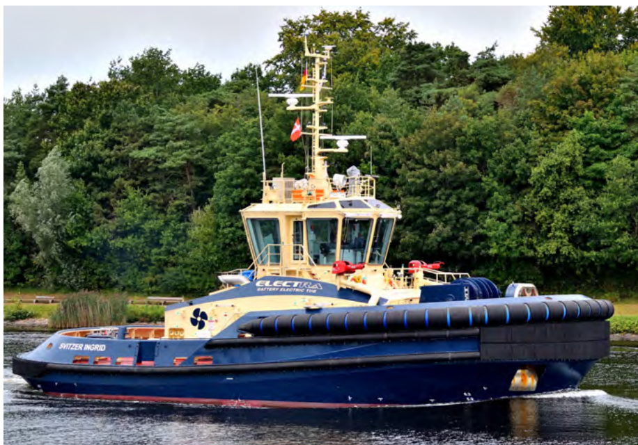
SVITZER INGRID Sweden