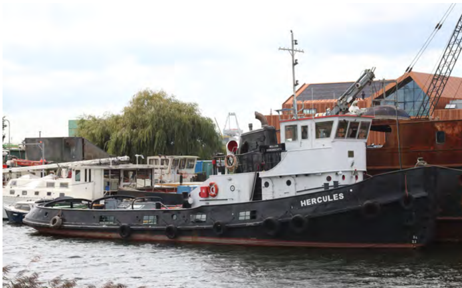
HERCULES The Netherlands

OSV Perdana Liberty , ex SK Line 402 '10, Petra Liberty '11 (2009 – 9556650) owned by Perdana Earth Ltd., operated by Intra Oil Services Bhd. has been sold in 2025 to new owner CNN Capital L Bhd., operated by