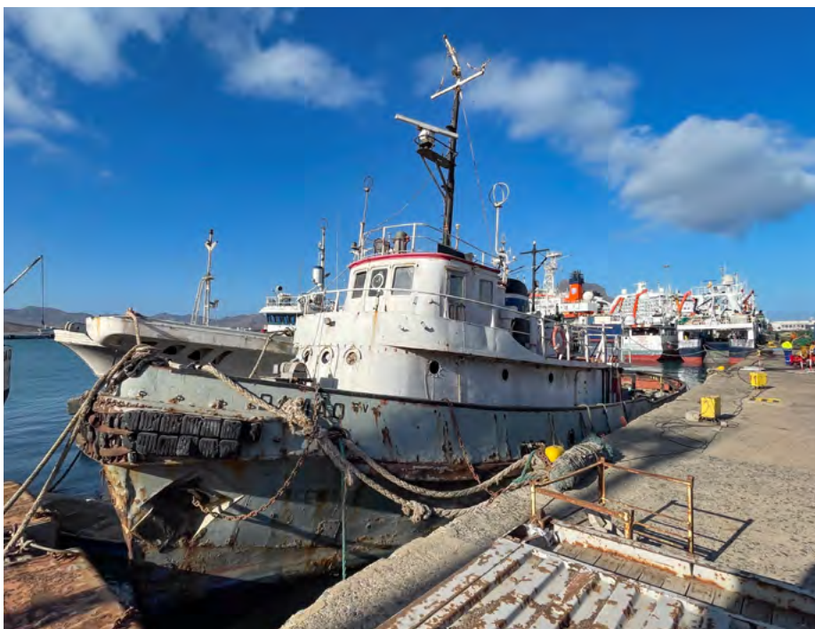
DAMAO Cape Verde

Shanghai Oceaner Marine has been sold in 2023 to new owner and operator Shanghai Oceaner Marine and has been renamed Han Ze . 15 Months later she has been sold to new owner and operator Halul Offshore Services Co. WLL, Doha (QAT) and has been renamed Halul 72 .