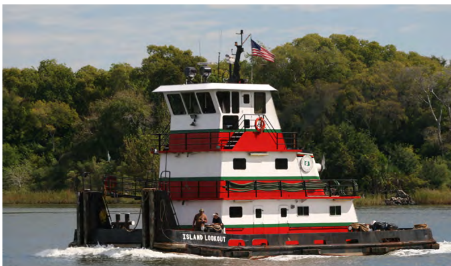
ISLAND LOOKOUT United States