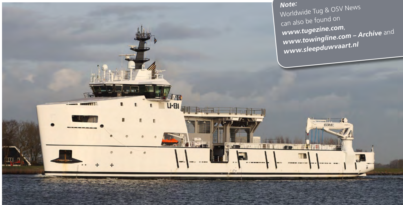
U-81 United States

Worldwide Tug & OSV News can also be found on www.tugezine.com , www.towingline.com – Archive and www.sleepduwvaart.nl