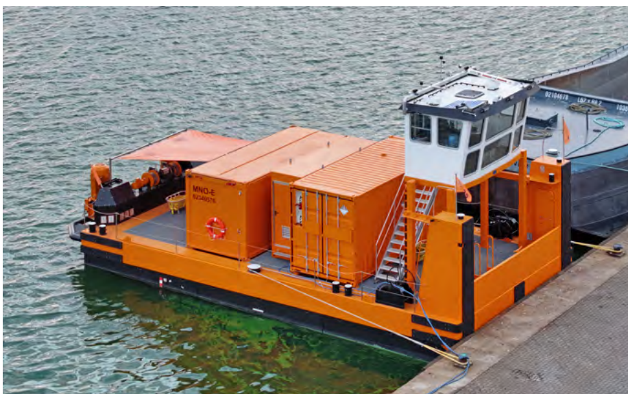
MNO-E The Netherlands

J. N Foncha and E.M.L. Endeley . The productname of the tugs has been changed from 'ASD 3010 ICE' into 'ASD 3010 HD' (HD = Heavy Duty).