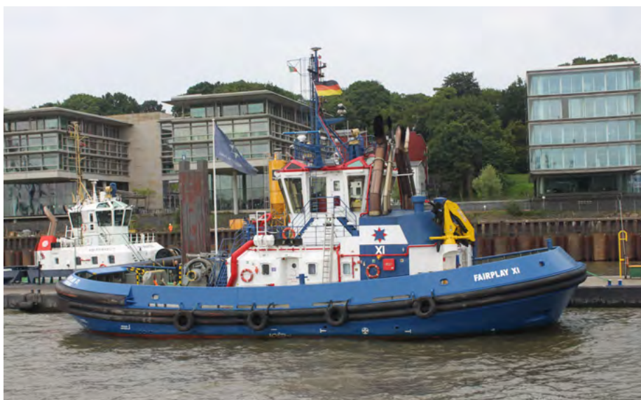
FAIRPLAY XI Germany

Tugs Tanjung Bahari 106 (2025 – 1052333),