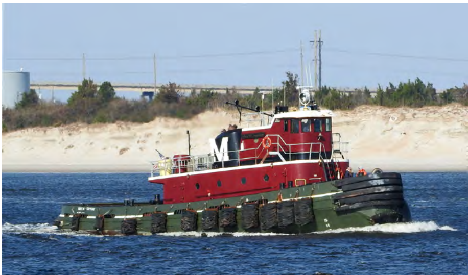
MARY M. COPPEDGE United States

Tug Duke of Normandy has not been sold yet to Lead Marine Contractors, but has been