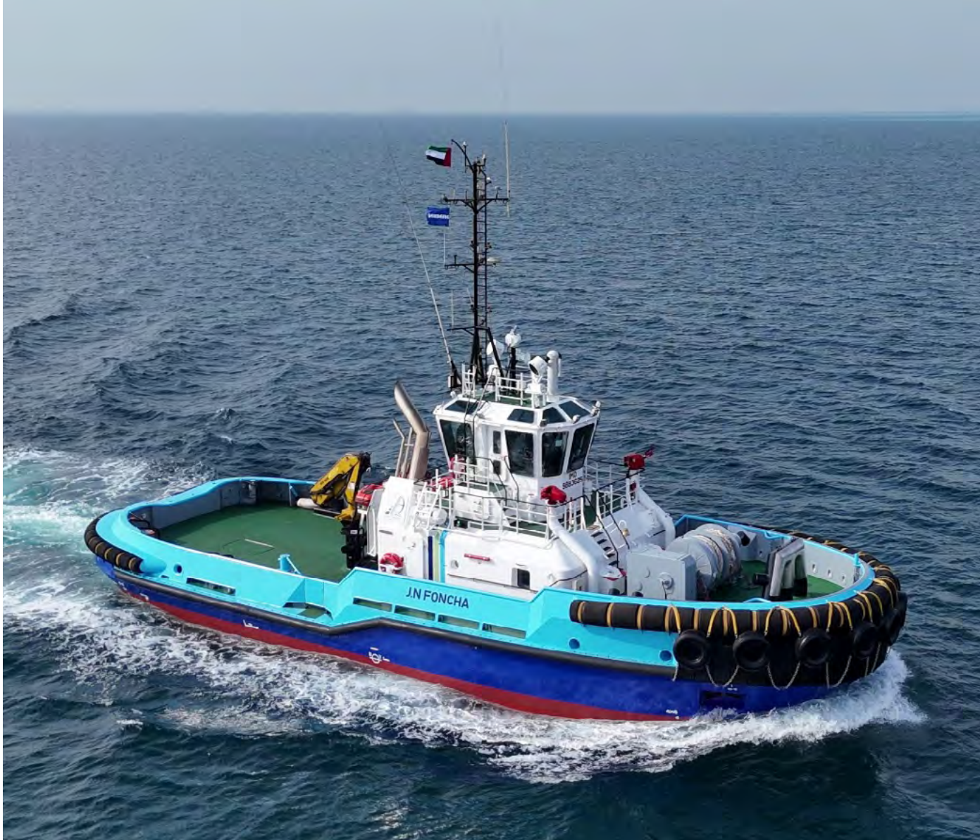
J. N FONCHE The Netherlands