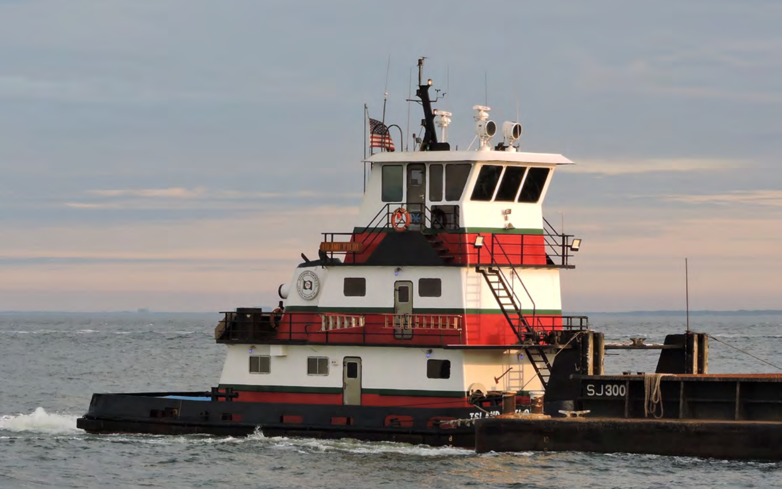
ISLAND PILOT United States