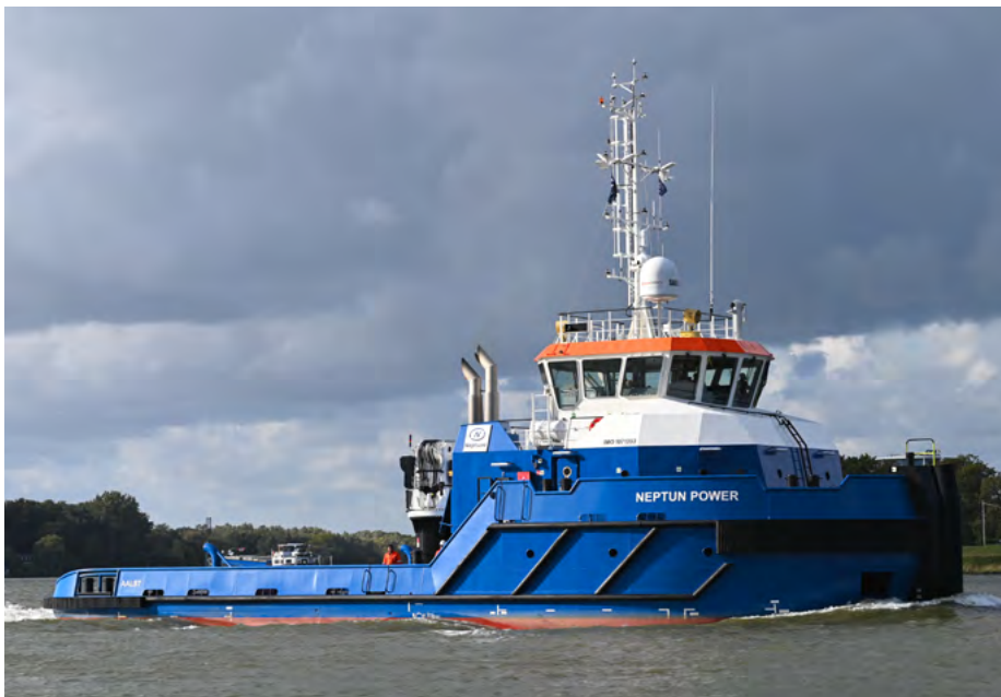
NEPTUN POWER The Netherlands

Tug Neptun Power (2025 – 1071393). Eurotug 3413 design. Yard: Neptun Shipyard, ynr. 573. 499 GT. Dim. 34,20 x 13,40 x 3,20 mtr. Engines: 3x Caterpillar, C-32 SCAC. Output: 5.180 bhp. Bollardpull: 65 tonnes, speed: 10 kn. Emission Standard: Tier III. Owner and operator: Neptune Equipment B.V., Hardinxveld. Tug Saad Warsama Dirieh (2025-1050210). ASD 2312 design. Yard: Damen Shipyards, Sharjah, ynr. 513643. 263 GT. Dim. 22,81