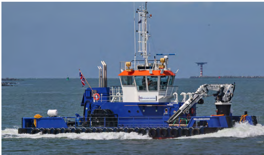
WILDISCOVER United Kingdom

Tug Melana 68 (2004 – 9330886) owned by Shin Yang Shipping Sdn Bhd, operated by Deena Shipping LLC has been sold in 2024 to new owner Ashtarian AF, operated by Sea Knots International, Dubai and has been renamed Yam 14 .