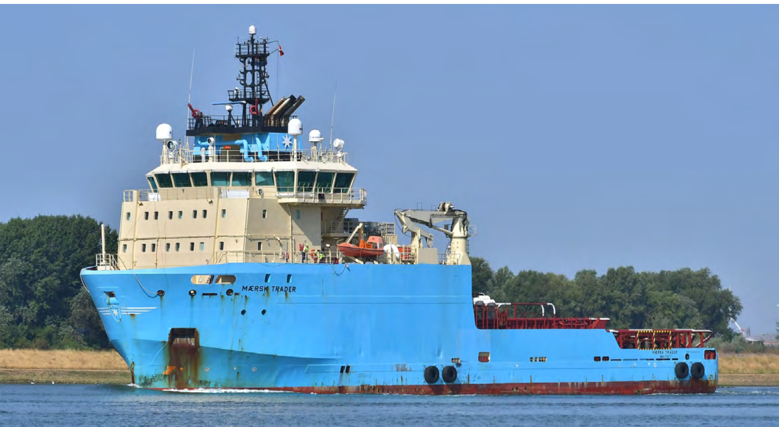
MAERSK TRADER Denmark

Tug Shun Da Tou Yi (2025 – 9649160). Yard: Fujian Baozhong Ocean Engineering, ynr. WD1006. 344 GT. Dim. 30,80 x 9,40 x 4,95