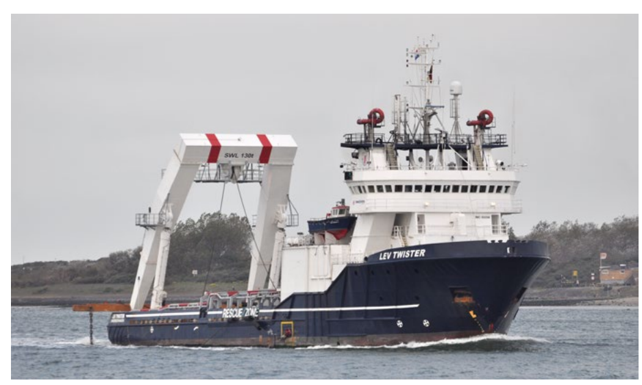
LEV TWISTER Germany

Tug Bo (2023 – 9981946). TraktorZ 2600-SX design. Yard: Sanmar Denizcilik Makina ve Ticaret. 335 GT. Dim. 25,30 x 12,00 x 6,25 m. Engines: 2x Caterpillar, 3516-C HD/D. Bollardpull: 75 tonnes, speed: 12 kn. Owner and operator: H. Schramm Towage, Brunsbüttel. Launched as Delicay XIV . Tug Fairplay-92 (2024 – 9948417). ASD 2813 design. Yard: Damen Shipyards, Song Cam, ynr. 513330. 381 GT. Dim. 27,59 x 12,93 x 5,20 m. Engines: 2x Caterpillar, 3516-C HD/D, total: 6.772 bhp. Bollardpull: 82 tonnes, speed: 13 kn. Owner and operator: Fairplay Borchard, Hamburg.