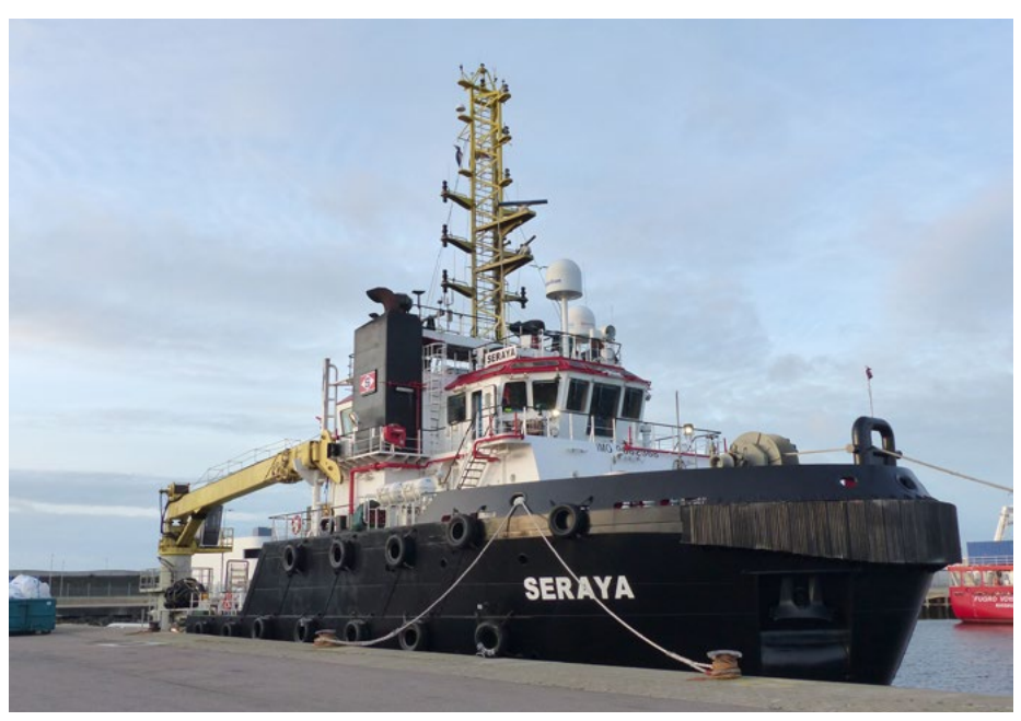
SERAYA The Netherlands

Tug Demi-K , ex Sund (2012 – ENI 027.25346) owned by Koribron B.V., operated by Rodie Watertransport B.V. has been sold in 2023 to new owner and operator Le Nickel-SLN, Nouema (NCL). Name remains the same. Tug Multratug 25 , ex Shoalbuster '04, Multrasalvor 2 '06, Shoalbuster '07, C.M. Kurik '17, King David '20 (1995 – 9133886) owned and operated by Multratug Towage & Salvage B.V. has been sold in 2023 to new owner and operator Trasomar, Monaco (MCO) and has been renamed The Bull . Tug Rotterdam (2017 – 9816658) owned