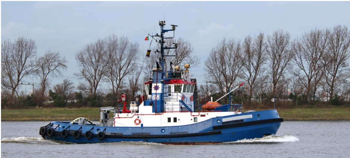
FAIRPLAY-68 Germany