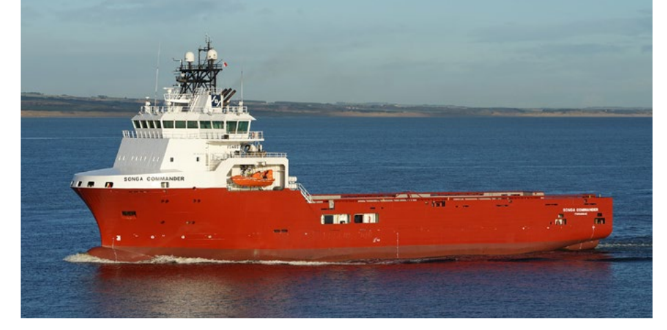
SONGA COMMANDER Norway