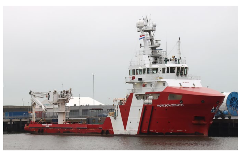
HORIZON ZENITH The Netherlands

Acta Marine Workboats, an operator of workboat vessels, has been purchased by French Jifmar Offshore Services. With the purchase, Jifmar has taken ownership of a 26-strong fleet alongside the crews and ope-