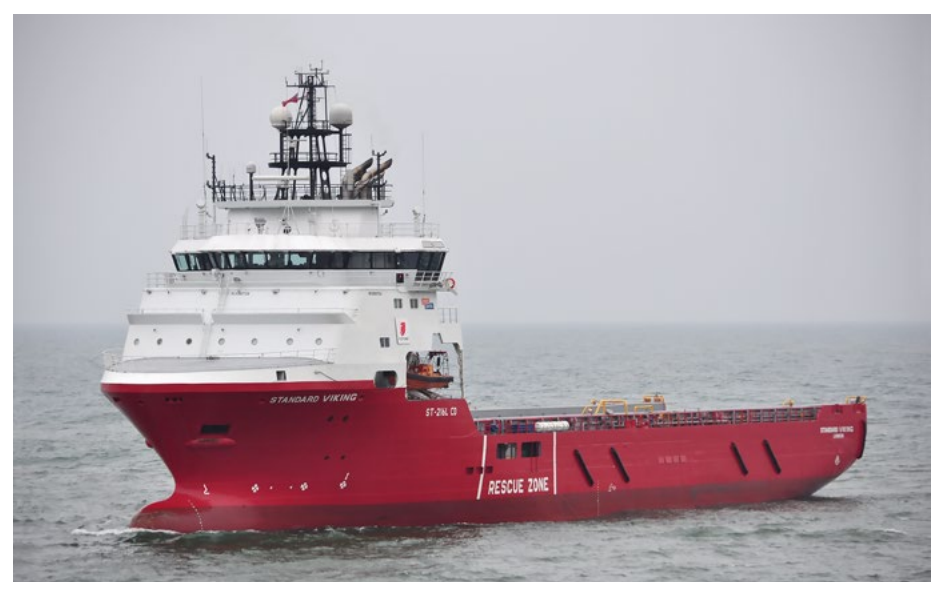
STANDARD VIKING Greece