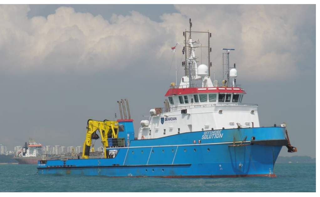
OFFSHORE SOLUTION Australia

Listed below are new constructions, renamings, sales, demolitions of tugs, anchorhandlers and offshore supply vessels that recently have taken place.