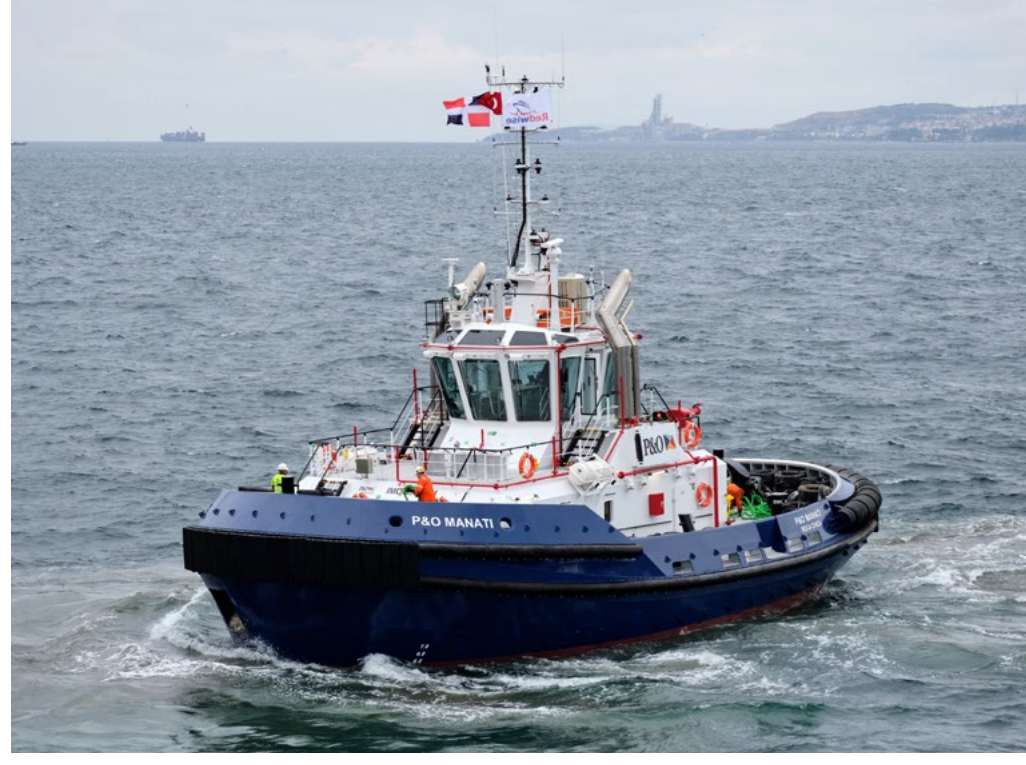
P&O MANATI Dominican Republic

Tugs Chief Dan George (2023 – 9960394) and Saam Volta (2023 - 9960382). ElectRA 2300-SX design. Yard: Sanmar Denicilik Makina ve Ticaret, Tuzla, ynr. resp. Electra 2303 and Electra 2302. 295 GT. Dim. 23,00 x 12,00 x 5,00 m. Engines: Orca battery bank by Corvus Energy. Total: 4.916 bhp, bollardpull: 70 tonnes, speed: 12 kn. Emission Standard: Tier III. Owner and operator: Saam Towage, Vancouver. Launched resp. as Dynamo II and Dynamo I. Tug HaiSea Brave (2023 - 9942988). ElectRa 2800 design. Yard: Sanmar Denizcilik Makina ve Ticaret, Tuzla, 485 GT. Dim. 28,40 x 13,00 x 5,90 m. Engines: 100% electric, battery bank by Corvus Orca Energy,