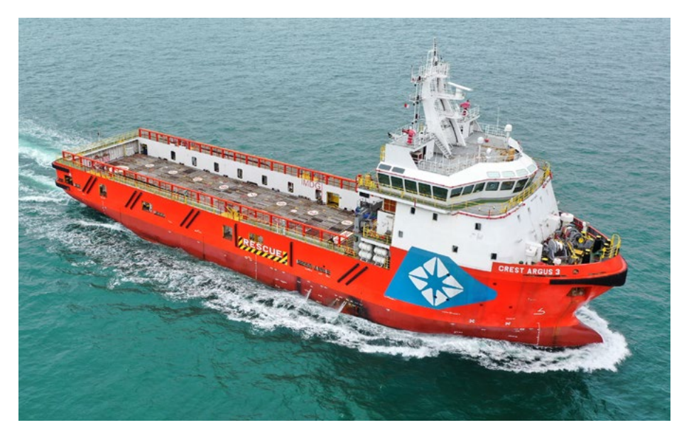
CREST ARGUS 3 Singapore

Tug Sea Challenge II, ex Argus 5 '78, Jumbo '83, Eduard '00 (1967 - 8433320) owned and operated by Bennetts Barges, Rochester has been sold in 2023 as houseboat after engine failure and is now at Hoo Marina, Rochester. Tug Strathdon, ex Azuma Maru '07, Keverne '14 (2006 - 9381794) owned by Caledonian Towage Ltd., operated by Boluda Towage Caledonian Towage Ltd., Invergordon has been renamed VB Strathdon in 2023. Tug Svitzer Surrey, ex Sun Surrey '05, Adsteam Surrey '07 (1992 – 9019468) owned by Svitzer Eastlands Ltd., operated by Svitzer Marine Ltd. has been sold in 2023 to new owner and operator A&P Falmouth, Falmouth and has been renamed Morva. Tug Willpower, ex Sidi Moussa '14, Sidi '14 (2000 – 9220691) owned and operated by Williams Shipping Marine has been sold in 2023 to new owner and operator Foyle