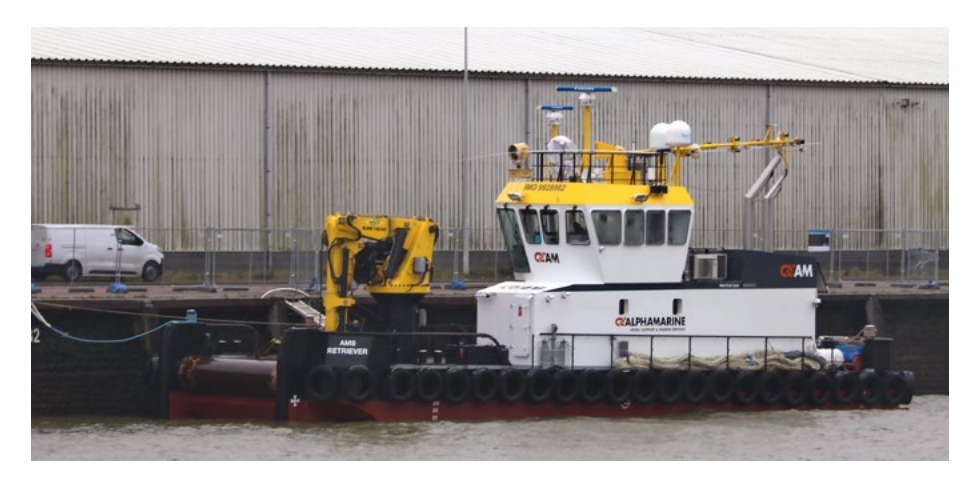
AMS RETRIEVER United Kingdom

OSV Go Crusader, ex St. Joseph the Worker '13, Harvey Cougar '22 (2011 – 9622655) owned and operated by Go Crusader LLC has been sold in 2023 to new owner and operator Guice Offshore LLC, Lafayette, LA and has been renamed Go Beyond. OSV Harvey Lion, ex Infant Jesus of Prague '14 (2010 – 9578737) owned by Harvey Lion LLC, operated by Harvey Gulf Int'l Marine LLC