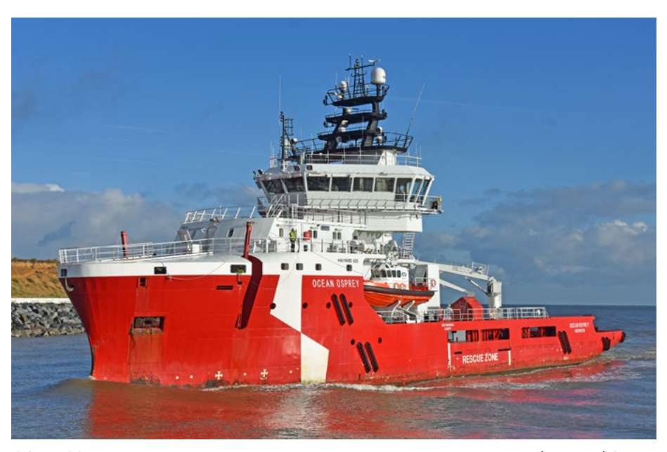
OCEAN OSPREY Norway