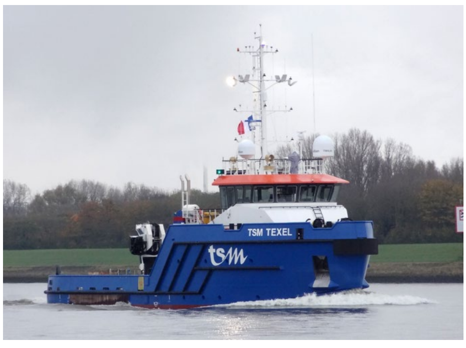
TSM TEXEL France