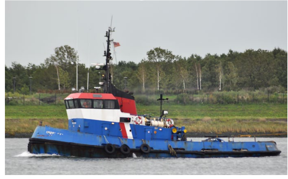
BOSS TUG United Kingdom