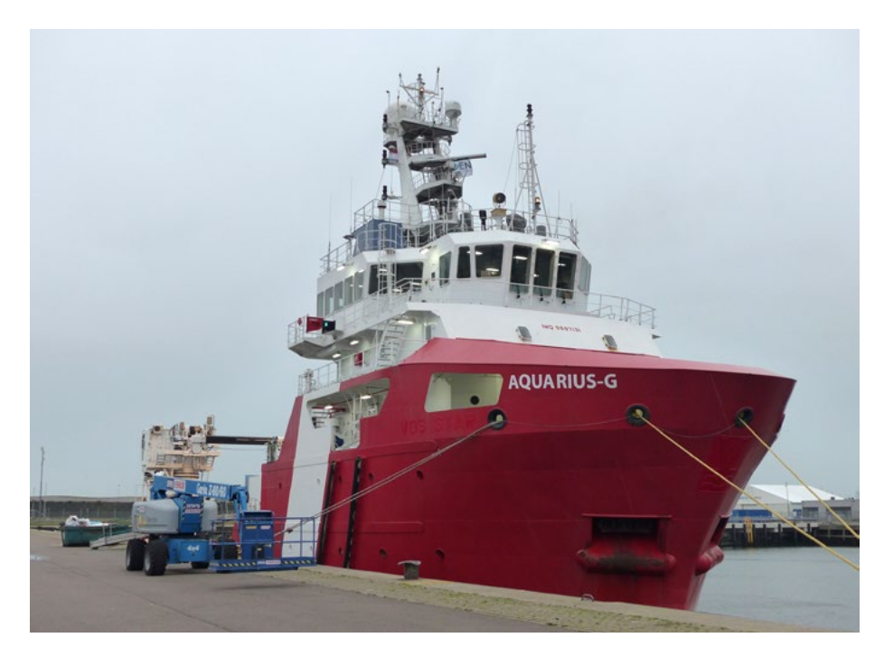
AQUARIUS-G The Netherlands