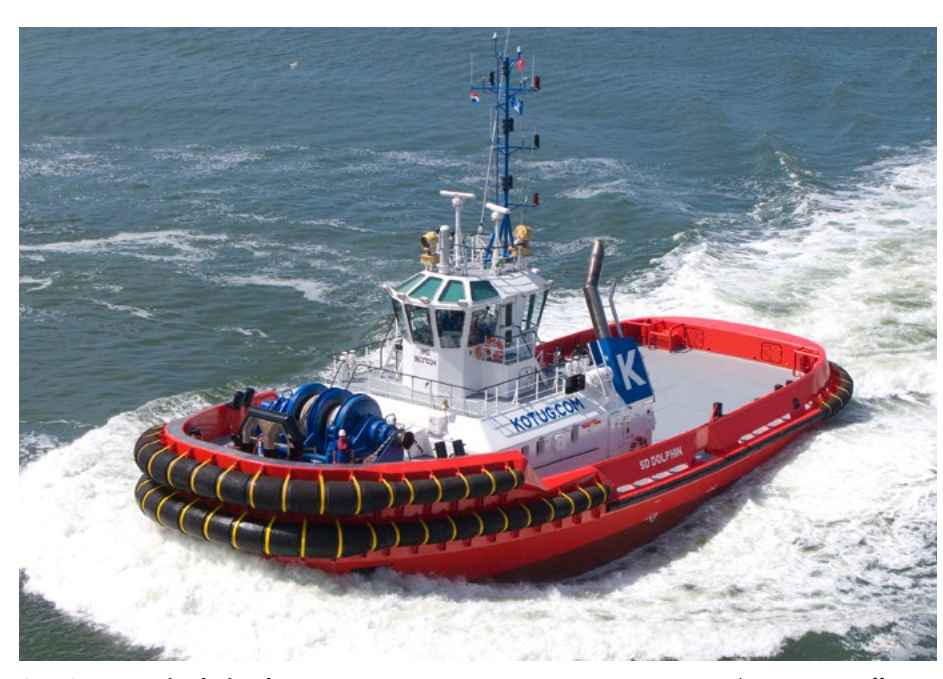
SD DOLPHIN United Kingdom