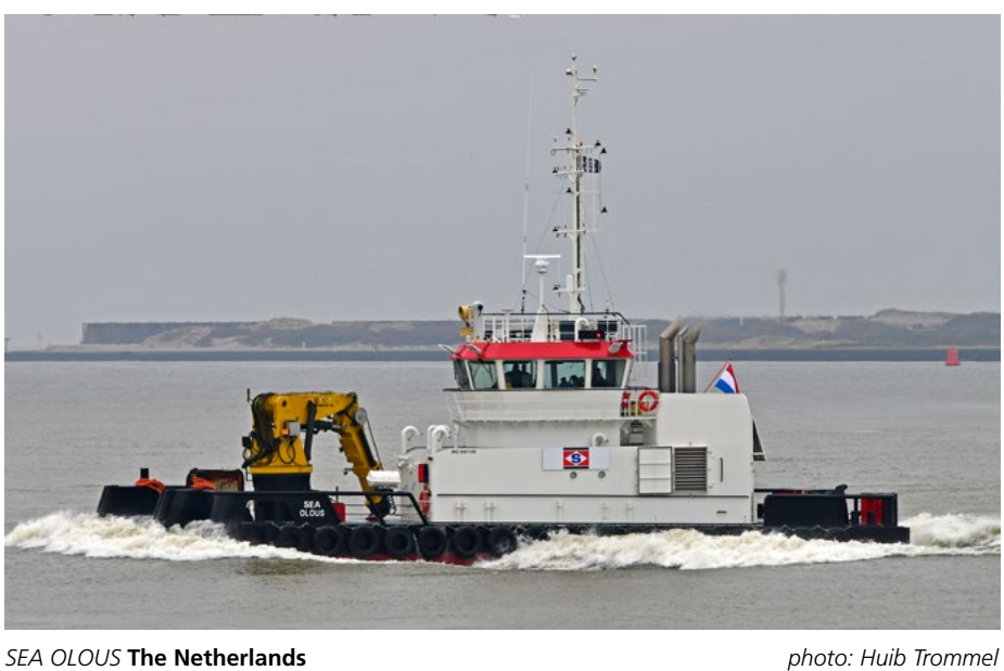
SEA OLOUS The Netherlands

OSV's Normand Scotsman, ex Far Scotsman '22 (2012 - 9616187), Normand Searcher, ex Far Searcher '21 (2008 – 9388950), Normand Spark, ex Sea Spark '21 (2013 –