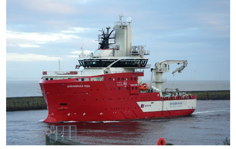
GRAMPIAN TEES United Kingdom

OSVs Topaz Endurance , ex Britoil Power '18 (2015 – 9678769) reported as being sold to