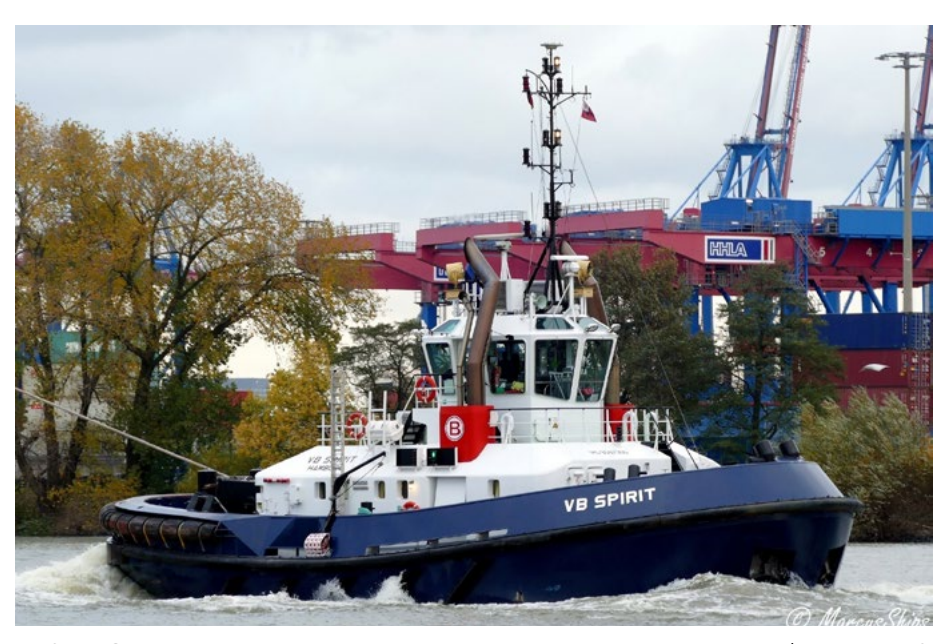
VB SPIRIT Germany