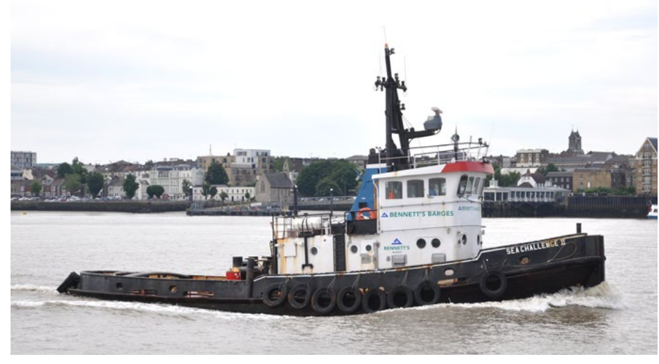
SEA CHALLENGE // United Kingdom

OSV Speciality Operator, ex Gulf Quest '02, Ocean Quest '19 (2001 - 8968741) owned