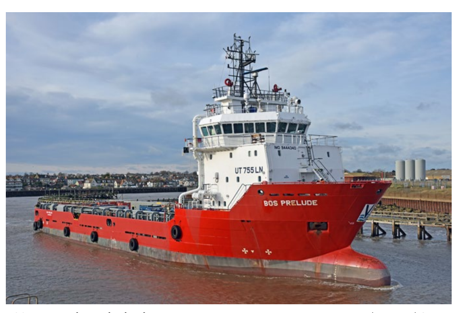
BOS PRELUDE The Netherlands