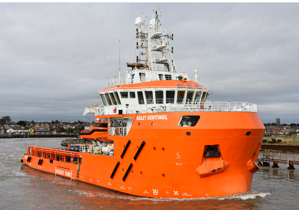
BAILEY SENTINEL Singapore

Tug National Energy Resilience (2023 – 9949388). ASD 2811 design. Yard: Damen Shipyards, Song Cam, ynr. 513216. 299 GT. Dim. 28,57 x 11,43 x 4,65 m. Engines: 2x Caterpillar, 3512 TA HD/D, total: 5.102 bhp. Bollardpull: 60 tonnes, speed: 13,6