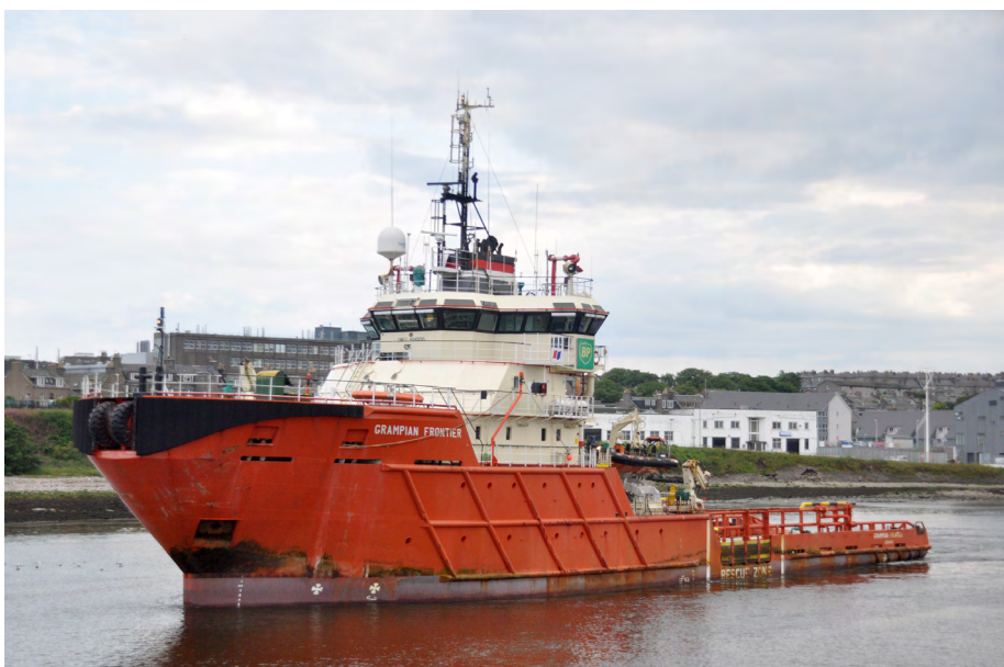
GRAMPIAN FRONTIER United Kingdom

Tug Svitzer Jubilee (2022 – 9963920). ASD 2312 design. Yard: Damen Shipyards, Song Cam, ynr. 513617. 263 GT. Dim. 22,80 x 11,40 x 4,40 m. Engines: 2x Caterpillar, total: 5.168 bhp. Speed: 12,5 kn. Owner and operator: Svitzer Marine Ltd., Middlesbrough.