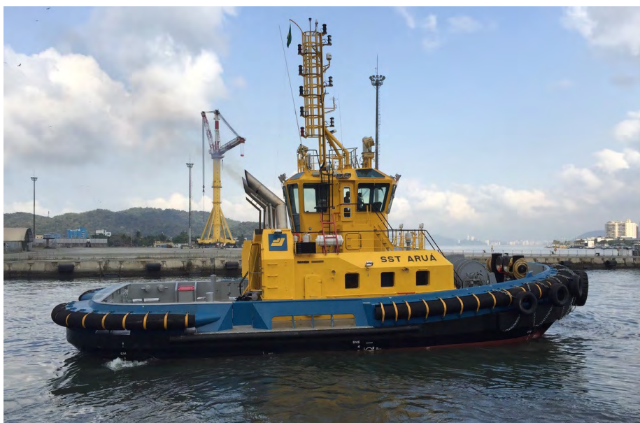
SST ARUA Brasil