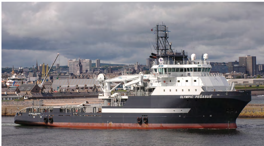
OLYMPIC PEGASUS China