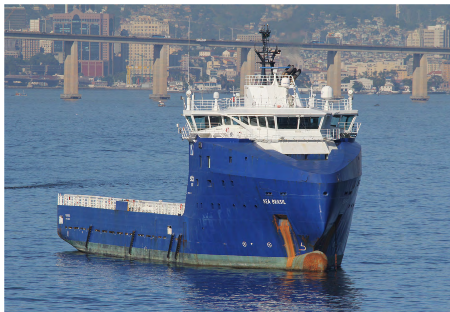
SEA BRASIL Brasil

Tug Lotus (2022 – 9769099). Stan Tug 3011