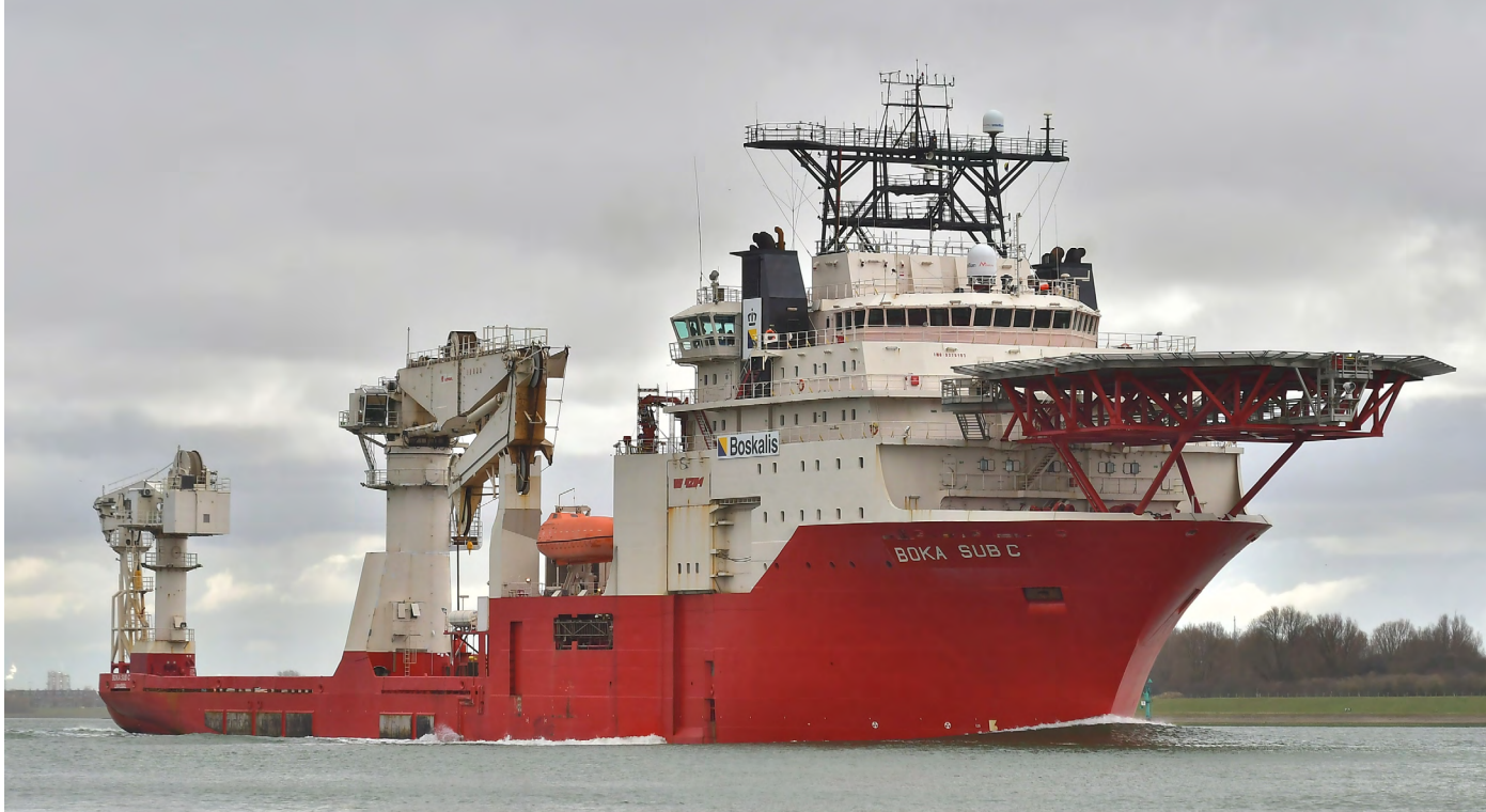
BOKA SUB C Norway