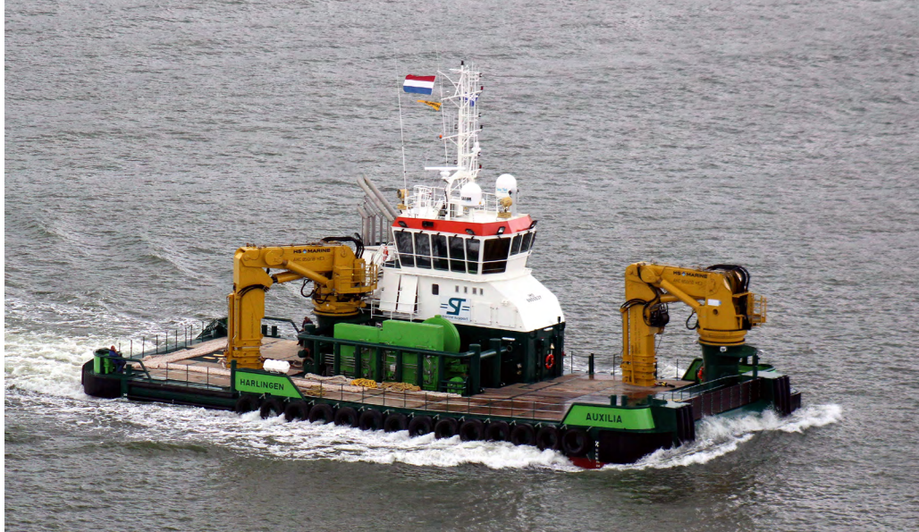
AUXILIA The Netherlands

Solstad Offshore has agreed to sell its platform supply vessel fleet to U.S. offshore vessel operator Tidewater for a total cash consideration of approximately $577 million, marking an exit from the PSV segment. The deal will see Tidewater, with a fleet of 228 vessels, add 37 PSVs and become the