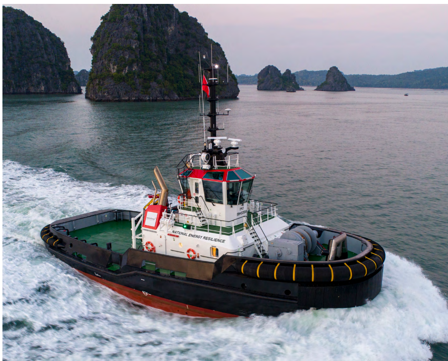
NATIONAL ENERGY RESILIENCE Trinidad and Tobago