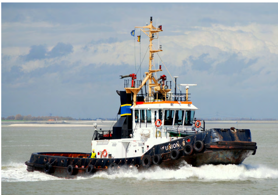
UNION 6 Belgium

Tug Union 6 (1993 – 9034987) owned by URS Belgium N.V., operated by Boluda Towage Belgium N.V. has been renamed VB Cavalier in 2023.