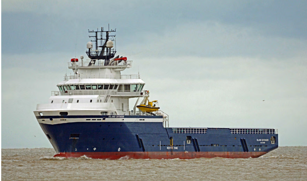
ISLAND DEFENDER Norway

Tug Esva (2022 – 9918664). ASD 2312 design. Yard: Damen Shipyards, Song Cam, ynr. 513613. 263 GT. Dim. 22,80 x 11,40 x 5,50 m. Engines: 2x Caterpillar, 3512-C TA HD/D, total: