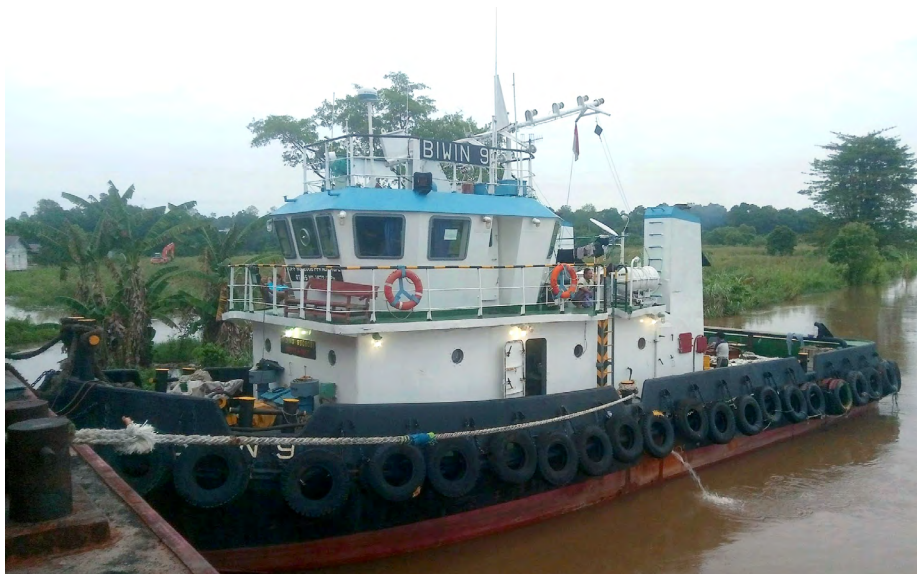
BIWIN 9 Indonesia