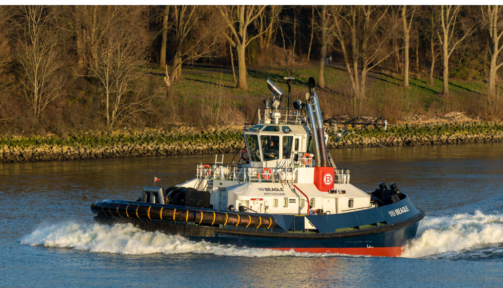
VB BEAGLE The Netherlands