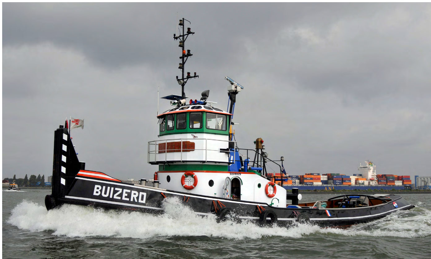
BUIZERD The Netherlands

Tug Svitzer Bolbok (2022 – 9950155). RASAR 2800-CL design. Yard: Hin Lee Shipyard, ynr. 5234. 433 GT. Dim. 28,40 x 12,99 x 6,58 m. Engines: 2x Caterpillar, 3516-C, total: 6.390 bhp. Owner: Svitzer Bahrain Spc., operator: Batangas Bay Towage Inc., Manila.