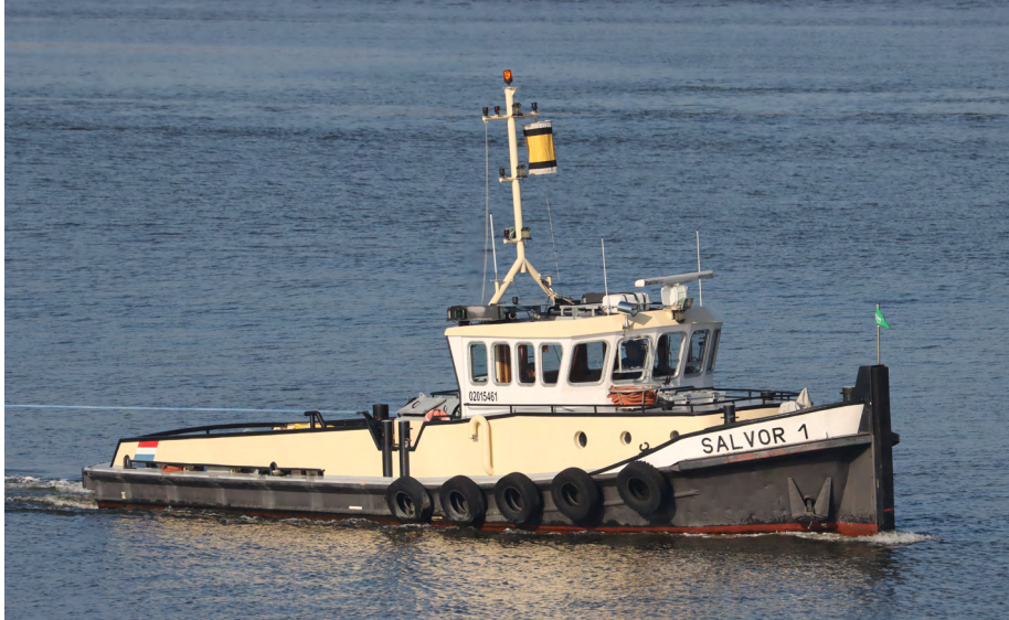
SALVOR 1 The Netherlands