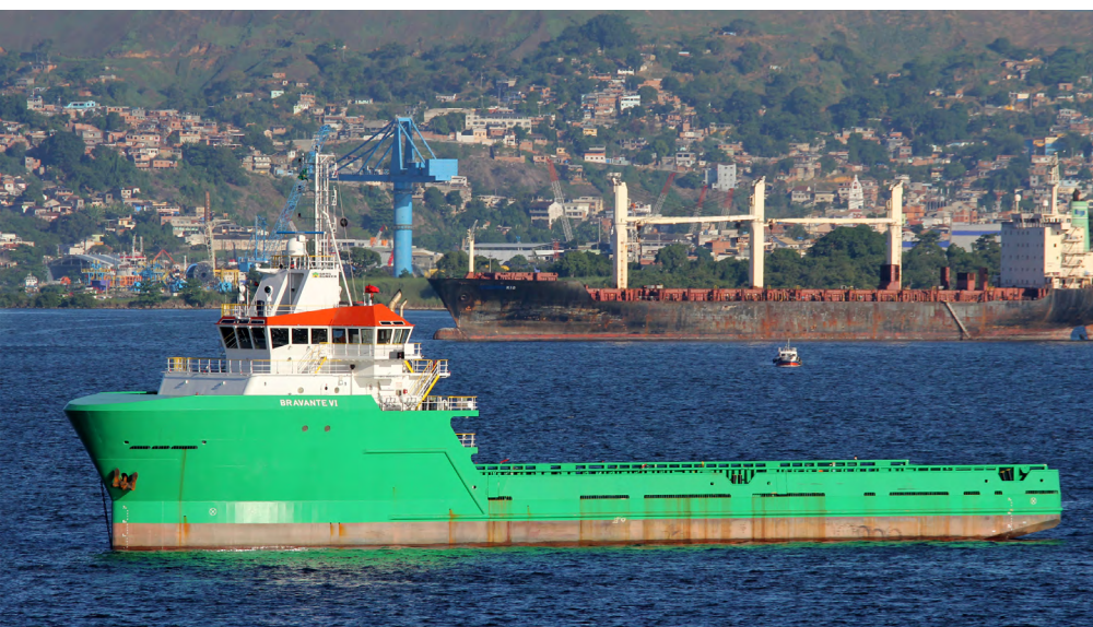
BRAVANTE VIII Brasil