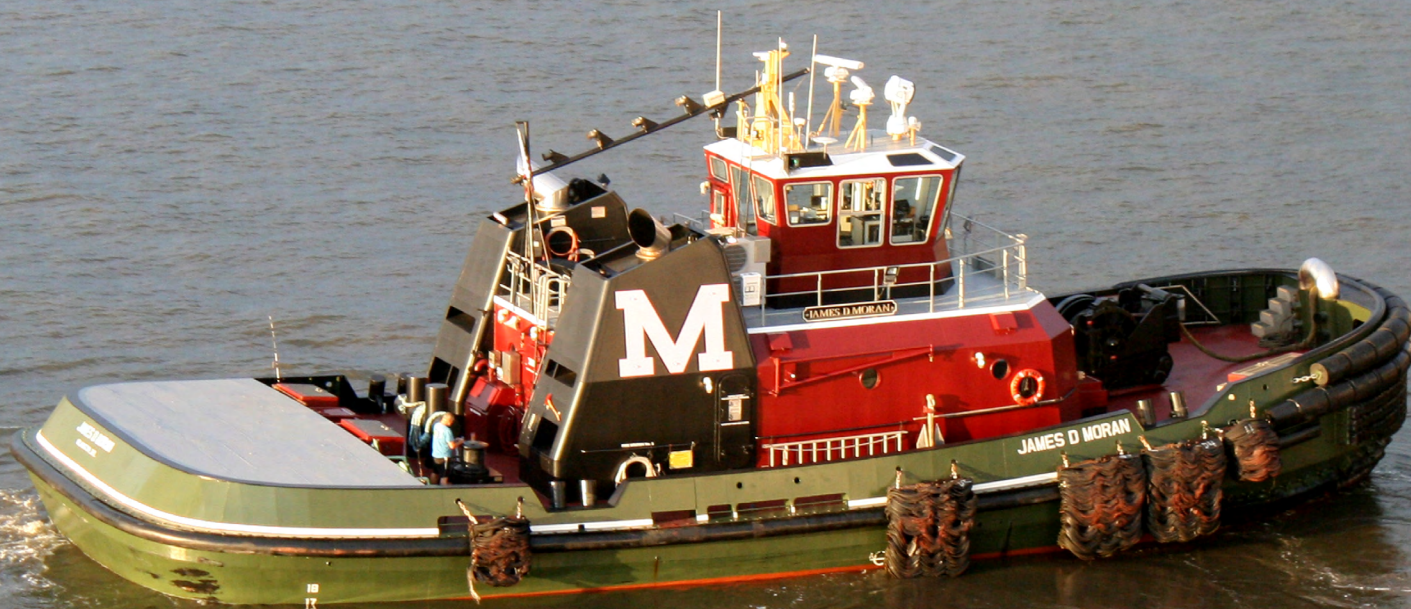
Just a tug... JAMES D MORAN (2015) owned by Moran Towage Corp., New Canaan, seen on 26 October 2022 in New York, Manhattan, Jetty 90

The editors regrets that the e-magazine is unable to supply photographs published in Worldwide Tug & OSV News.