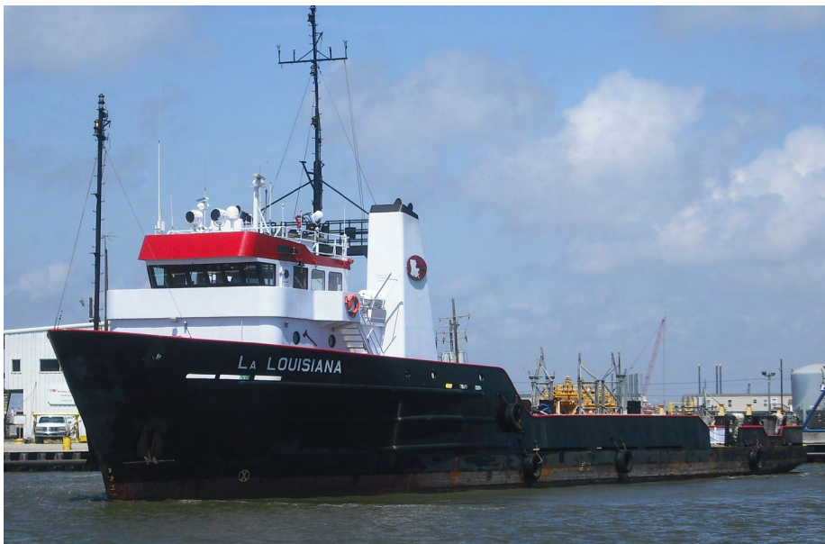
LA LOUISIANA United States

Tug SL Rima , ex Smit Rima '14 (1999 – 9179012) owned and operated by Smit Lamnalco Netherlands B.V. has been sold in 2022 to new owner Seagate Maritime S.A., operated by Seagate Tugs & Barges