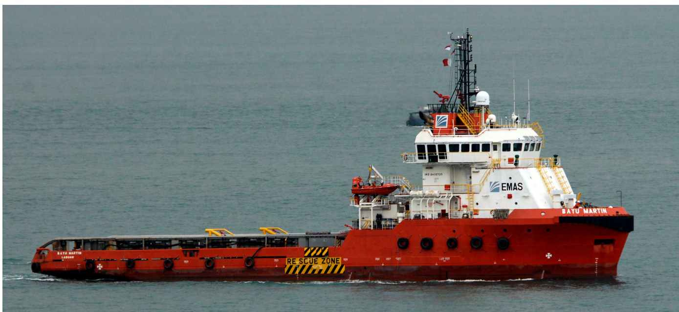
BAYU MARTIN Malaysia

OSV Island Defender , ex Defender '20 (2019 – 9741279) owned by Island Defender AS,