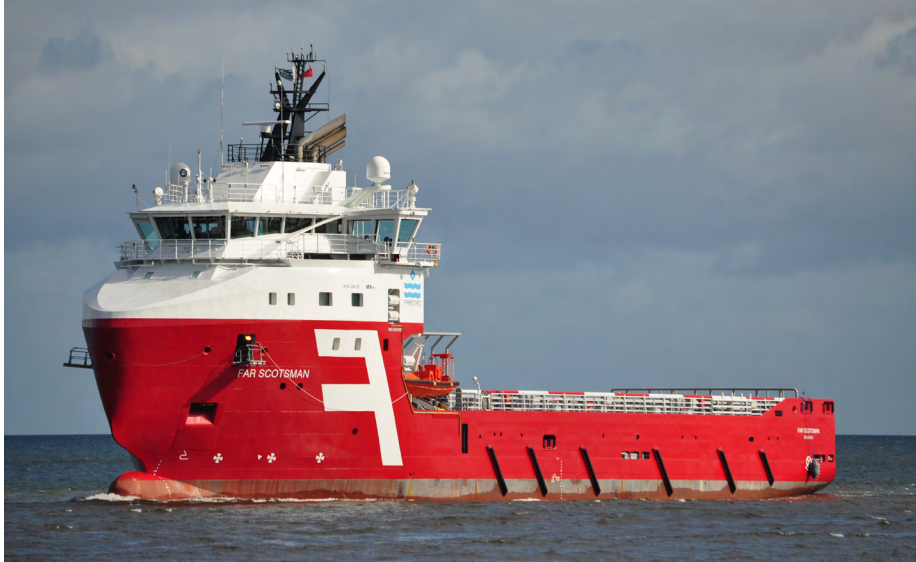
FAR SCOTSMAN Brasil

Tug York Syme (1961 – 5396090) owned and operated by Coastal D&C Ltd., Rarotonga has been scrapped in November 2022 at Henderson Creek (NZL).