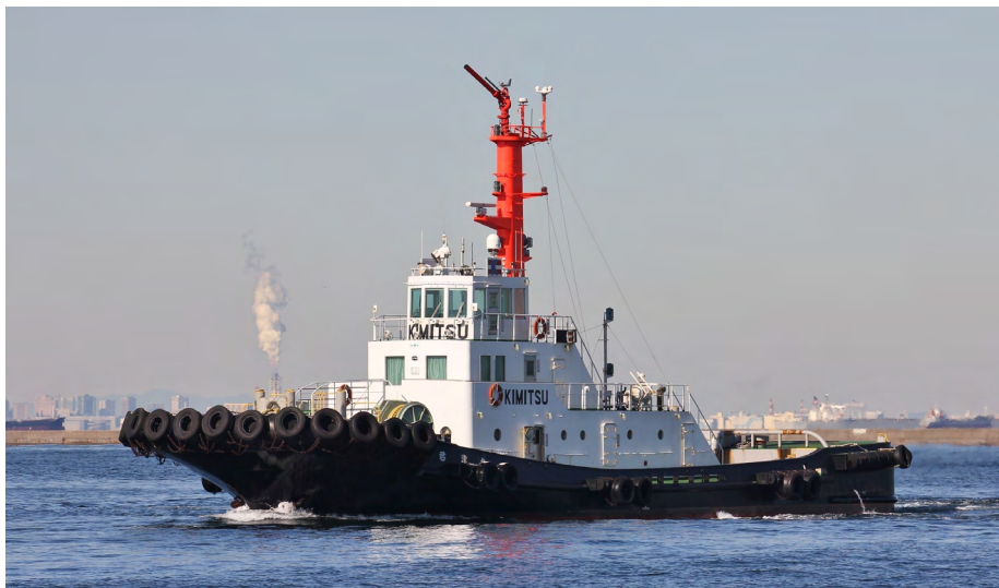
KIMITSU MARU Japan