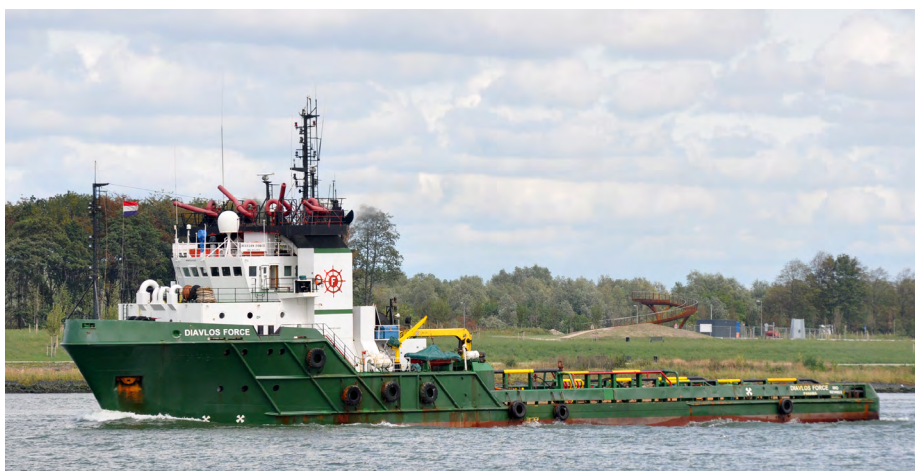
DIAVLOS FORCE Greece

OSV Bourbon Liberty 155 (2014 – 9630121) owned by Bourbon Liberty 305 SASU, operated by Bourbon Tamaulipas SA de CV has been sold in 2022 to new owner and operator Southern Towing Ltd., South