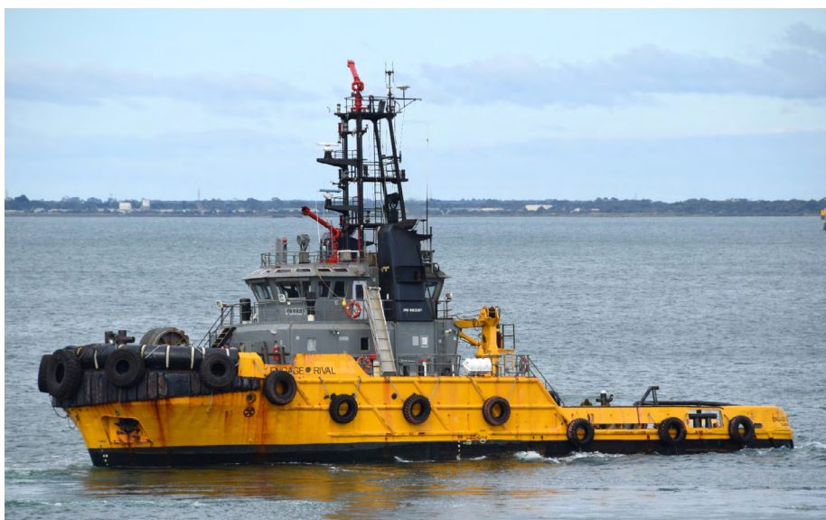
ENGAGE RIVAL Colombia

Tug Classic 1 (2010 – 9564839) owned and