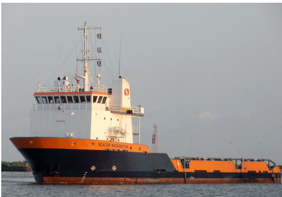
SEACOR WASHINGTON United States