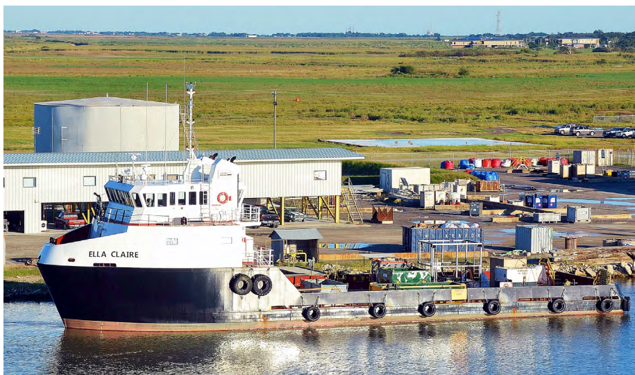
ELLA CLAIRE United States