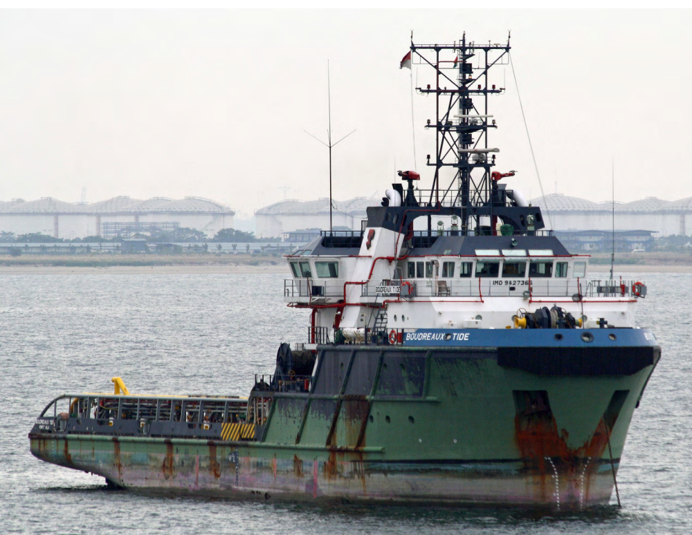
BOUDREAUX TIDE Cameroun