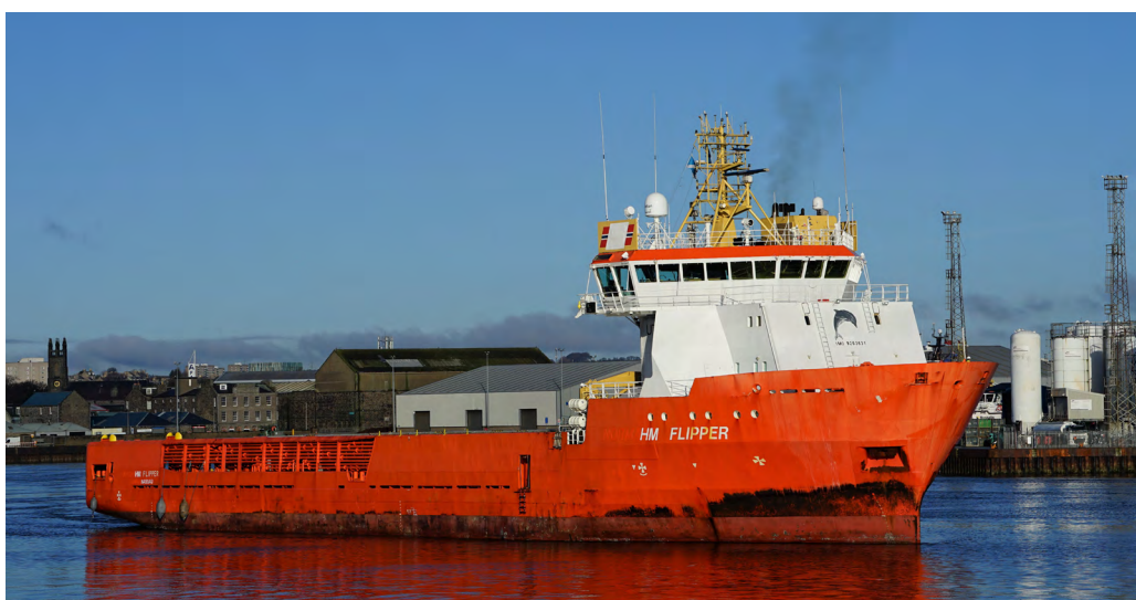
HM FLIPPER Norway

Tug PSA Shuri (2023 – 9951604). Ramparts 2500-CL design. Shipyard: Cheoy Lee Shipyards. 348 GT. Dim. 25,40 x 11,80 x 5,30 m. Engines: 2x Caterpillar, 3516-C HD, total: