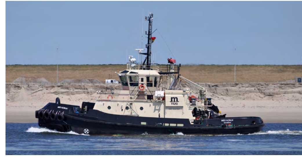
MED ACRUX Belgium

Tug Saam Quibian (2022 – 9943047). Yard: Sanmar Denizcilik Makina, ynr. 221-A. 312