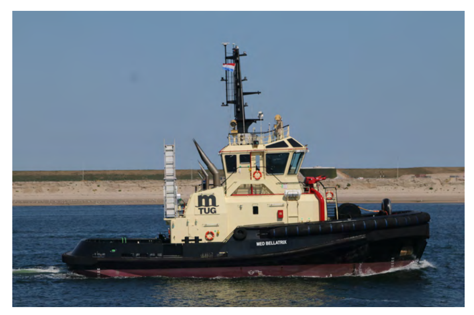
MED BELLATRIX Turkye