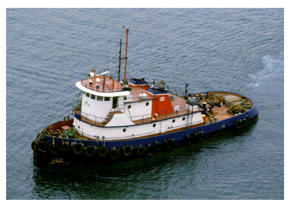
CETTA Italy