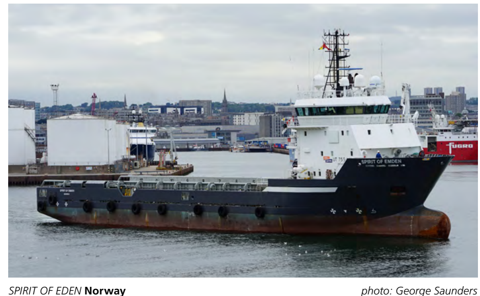
SPIRIT OF EDEN Norway