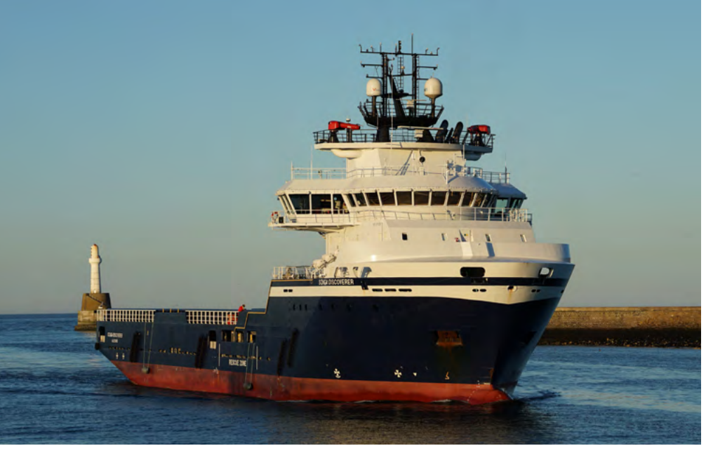
SONGA DISCOVERER Norway