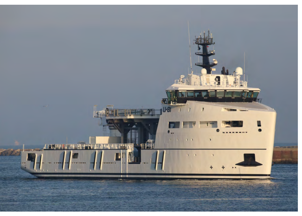
U-81 United Kingdom