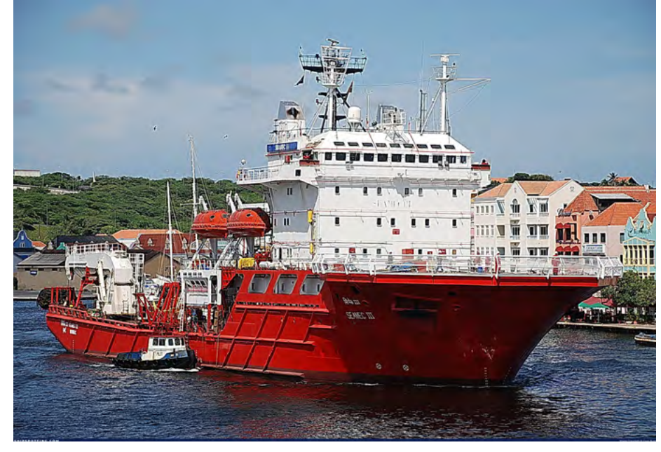
SEAMEC III India

Tug Citra 82 (2022 – 9960617). Yard: Cahaya Samudra, ynr. TB 082. 248 GT. Dim. 27,22 x 9,00 x 4,17 m. Total: 2.060 bhp. Owner and operator: Citra Maritime PT, Batam.