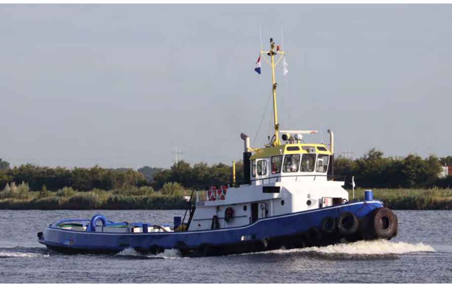
HENDRIK SR. The Netherlands