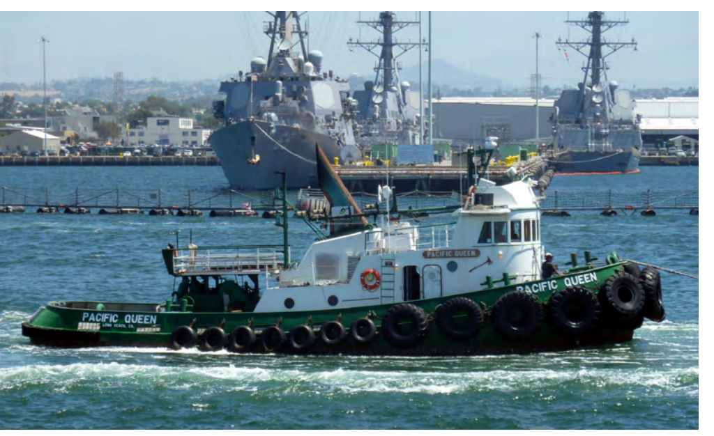
PACIFIC QUEEN United States