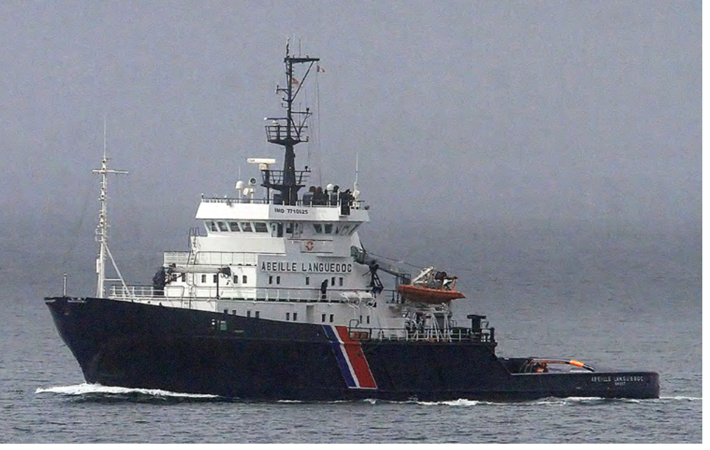
ABEILLE LANGUEDOC France

Tug TSM Houat (2017 – 9770866) owned by Compagnie Maritime Thomas, operated by Compagnie de Remorquage Maritime has been sold in 2022 to new owner and operator Multraship Towage & Salvage B.V., Terneuzen (NLD) and has been renamed Multratug 9.