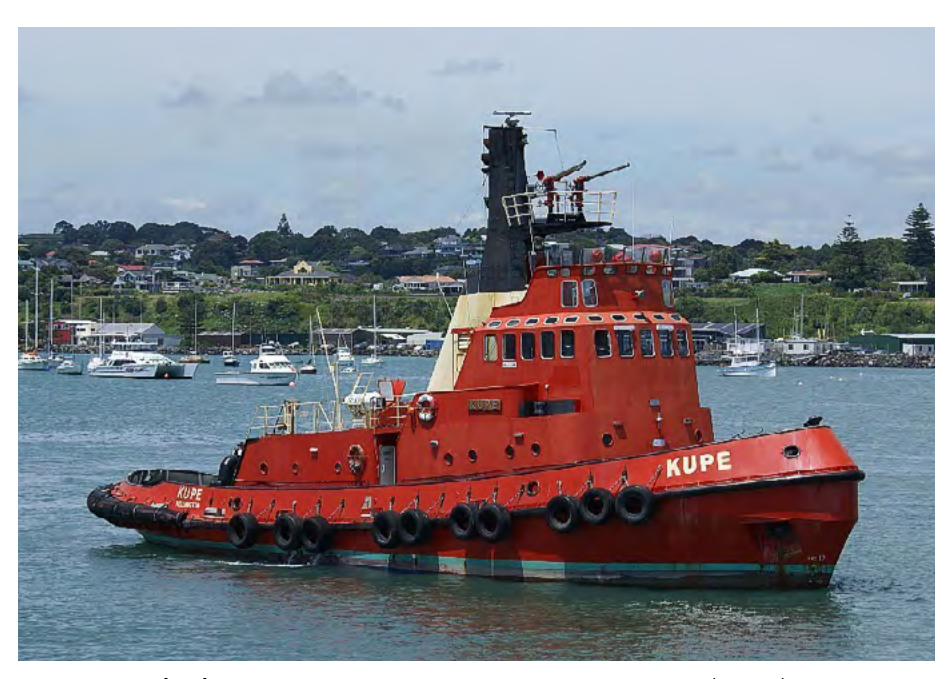
KUPE New Zealand