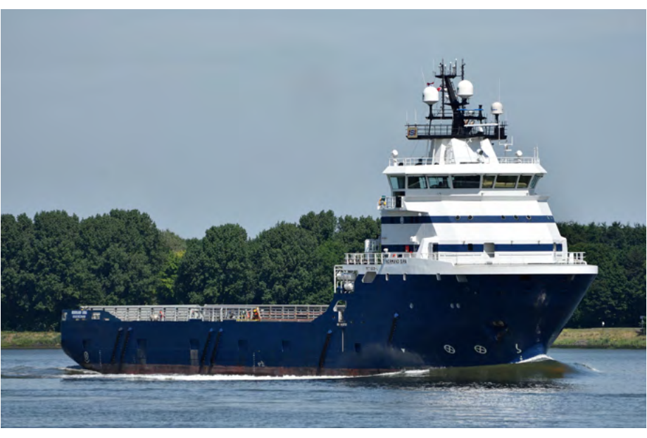
NORMAND SIRA Norway

Tug Y-120, ex Puntaroca '13 (1973 -7321697) owned and operated by Spain Government Fuerza Naval has been renamed Puntaroca in 2022.