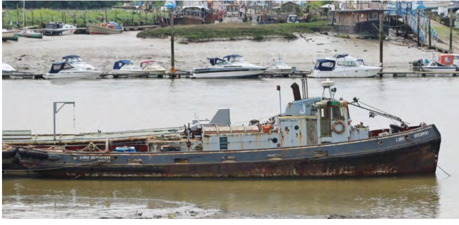
LORD DEVONPORT United Kingdom

OSV Harvey Jaguar, ex Sister Claire '13 (2009 – 9559157) owned by Harvey Jaguar LLC, operated by Harvey Gulf Int'l Marine LLC has been renamed Gol Supporter in 2022. Tug Helen B. Moran, ex Marion Moran '68, Cape Henry '76 (1965 – 6520856) owned and