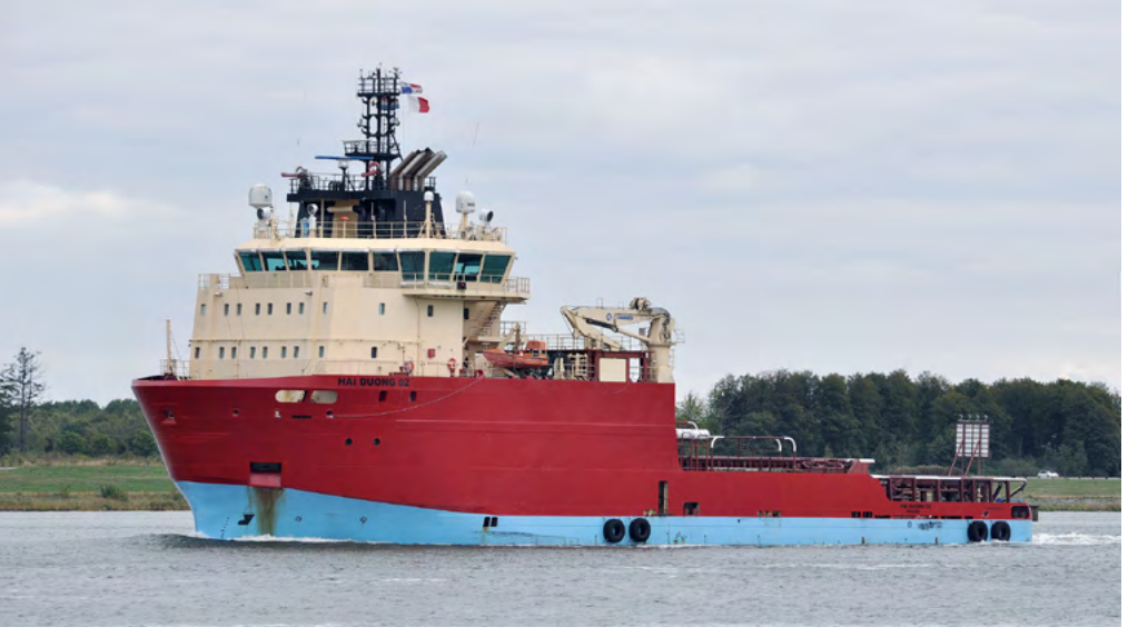
HAI DUONG 02 Additions