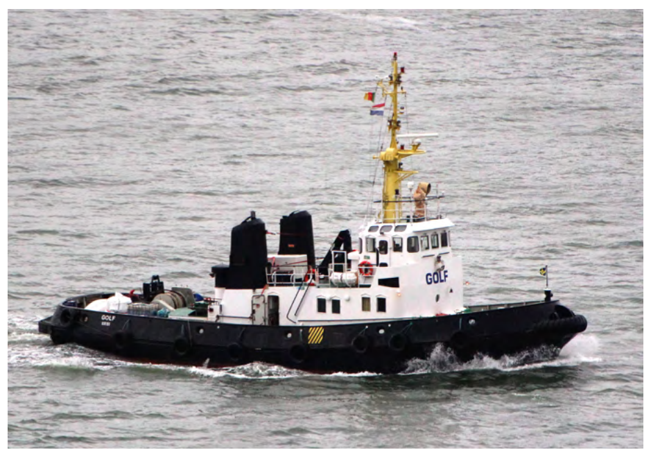
GOLF The Netherlands