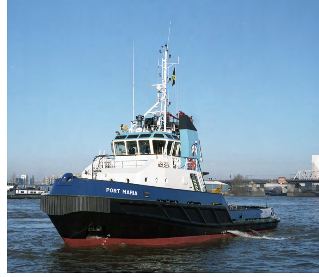
PORT MARIA Jamaica

AHTS vessels Bourbon Gulf Liberty 208 (2009 – 9394569) and Bourbon Gulf Liberty 211 (2009 – 9553452) owned by Bourbon Offshore Gulf WLL, operated by Bourbon Offshore Greenmar Ltd. have been sold in 2022 to new owner Middle East Marine DMCCO, operated by Mubarak Marine LLC, Dubai and have been renamed resp. Rodinia and Pannotia.