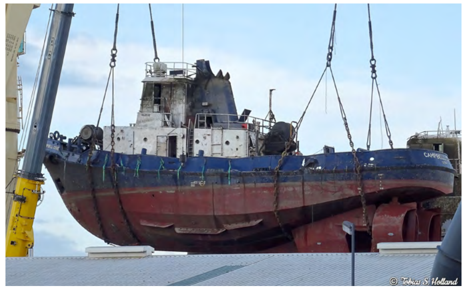
CAMPBELL COVE Australia

Listed below are new constructions, renamings, sales, demolitions of tugs, anchorhandlers and offshore supply vessels that recently have taken place.