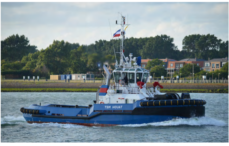
TSM HOUAT France

OSVs Hai Yang Shi You 541 (2022 – 9898321), Hai Yang Shi You 543 (2022 – 9898345), Hai Yang Shi You 546 (2022 – 9898369) and Hai