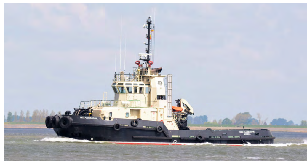
MED ALDABARAN Belgium