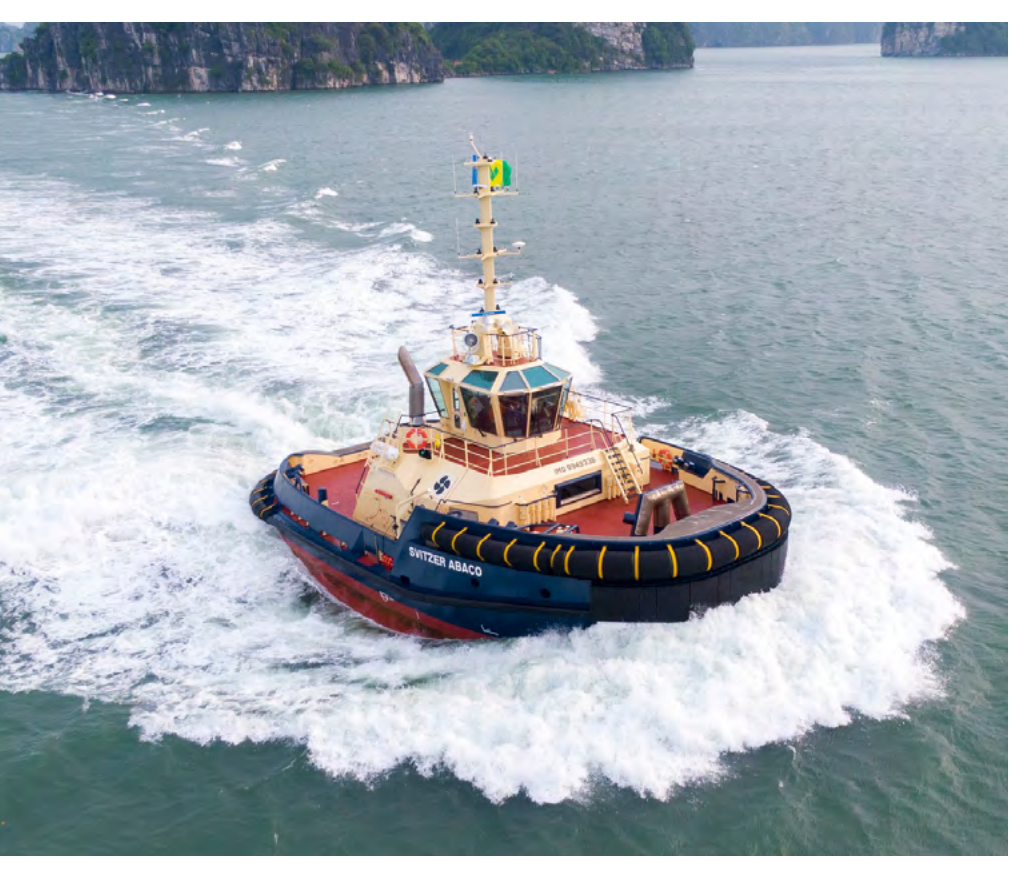
SVITZER ABACO Bahamas

Listed below are new constructions, renamings, sales, demolitions of tugs, anchorhandlers and offshore supply vessels that recently have taken place.