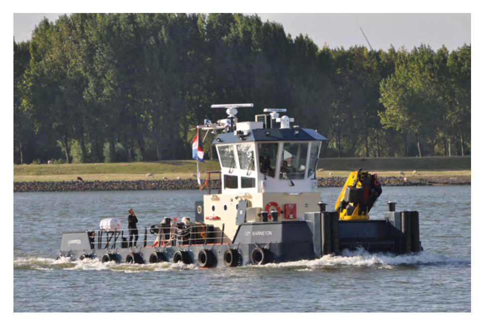
CT BARNSTON United Kingdom