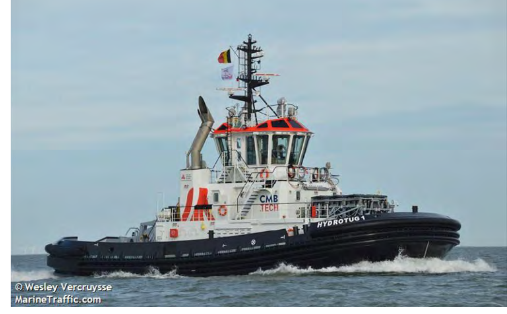
HYDROTUG I Belgium

Tug Grey (2022 – 9933327). Yard: Astilleros Servicios Avenas, Valdivia, ynr. 189. 315 GT. Dim. 25,80 x 11,00 x 3,90 m. Bollardpull: 70 tonnes. Owner and operator: Ultratug Remolcadores Ltda., Las Condes.