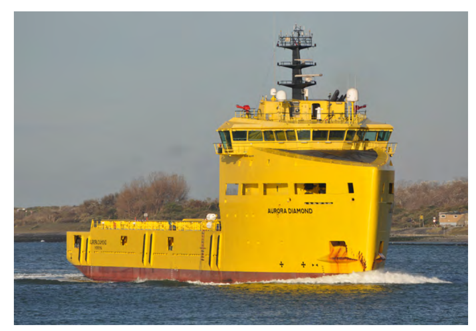
AURORA DIAMOND United Kingdom

Towboat Samantha Trueheart (2021 – USCG 1281050). Yard: Diversified Marine Services, Bourg, LA, ynr. 50. 191 GT. Dim. 23,77 x