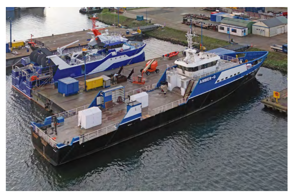
AMBER-G The Netherlands

Tug M.T. Adamawa (2000 – 9209790) owned by Nigerian Ports Authority, operated by Depasa Trading Inc. has been sold in 2022 to new owner and operator JTI Organisation