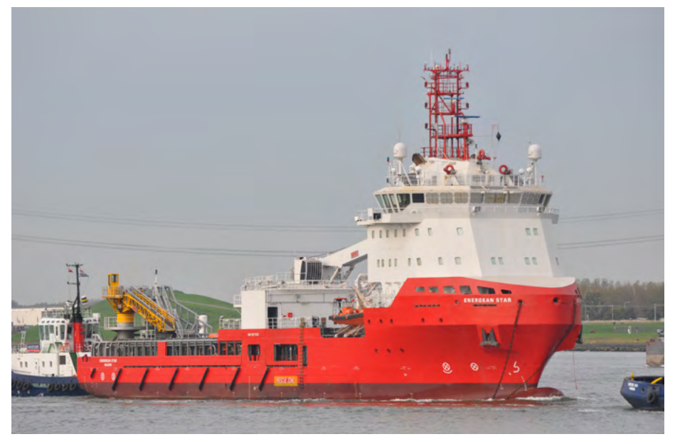
ENERGEAN STAR Marshal Islands

Consortium Inc., Athens (GRC) and has been renamed Ellada Z .