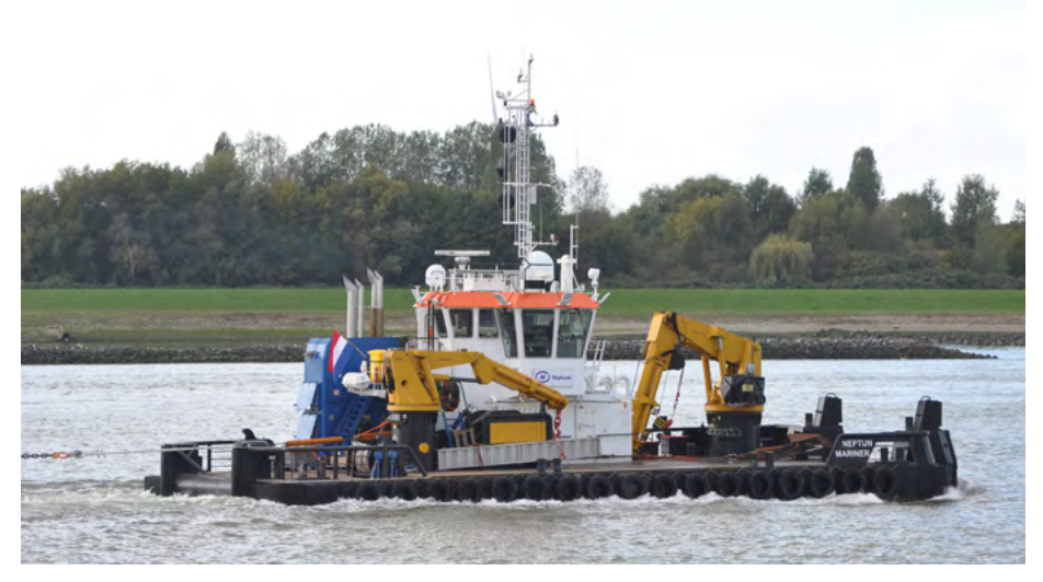
NEPTUN MARINER The Netherlands

Tug Fairplay-37 (2022 - 99529950). Shoalbuster 2711 ICE design. Yard: Damen