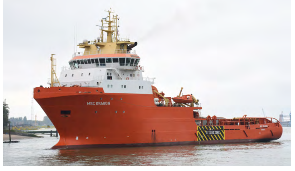
MSC DRAGON Norway

GT. Dim. 26,54 x 8,60 x 4,00 m. Engines: 2x Mitsubishi, total: 2.063 bhp. Owned and operated by HRS Infratech Pte. Ltd. AHTS Rawabi 48 (2022 – 9752876). Yard: Guangdong Yuexin Ocean Engineering, ynr. 3226. 2.294 GT. Dim. 65,00 x 16,00 x 6,20 m. Engines: 2x Niigata, 6MG28AHX, total: 5.998 bhp. Owner: Hamilton Offshore Services Pte., operator: Vallianz Offshore Marine Pte. OSV Rawabi 54 (2022 - 9775579). Yard: Fujian Southeast Shipyard, ynr. DN75M-23. 2.948 GT. Dim. 75,00 x 17,25 x 8,00 m. Engines: 2x Niigata, 8L28HC, total: 5.998 bhp. Owner: Hamilton Offshore Services, operator: Vallianz Offshore Marine Pte., Singapore. OSV Rawabi 55 (2022 - 9750139). Yard: