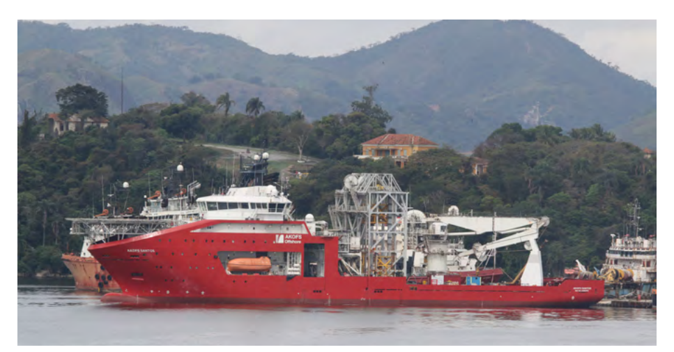
AKOFS SANTOS Brasil