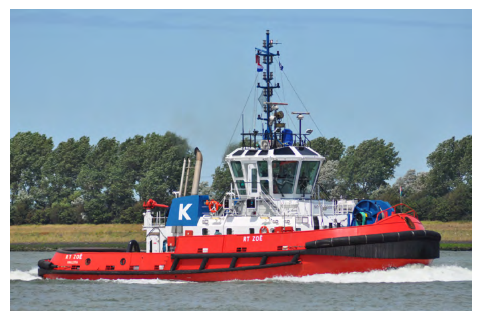
RT ZOË The Netherlands

AHTS vessels BGMS Splendor (2022 - 9944376) and BGMS Superb (2022 - 9944388. Yard: Guangzhou Shunhai Shipyards, ynr. resp. SH163 and SH164. 1.888 GT. Dim. 62,80 x 16,80 x 5,30 m. Total: 5.218 bhp. Speed: 11 kn. Owner and operator: BGMS, Al-Khobar.