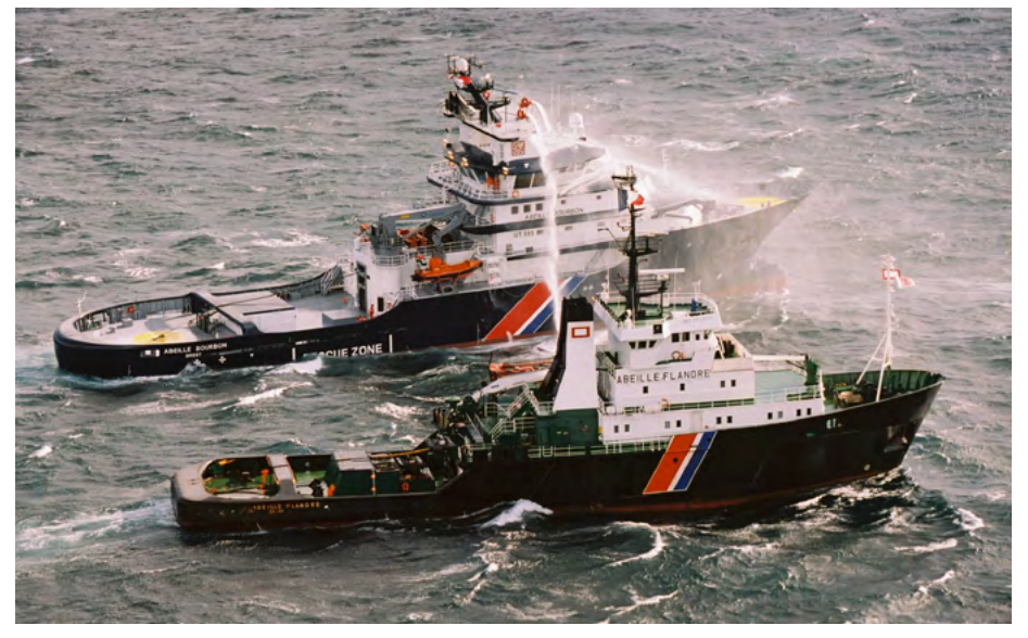
ABEILLE FLANDRE France

(1978 – 7710513) owned by Leasflow SAS, operated by Les Abeilles, Le Havre has been sold for scrap in September 2022 to scrapyard Navaleo, "Les Recycleurs Bretons" at Brest.