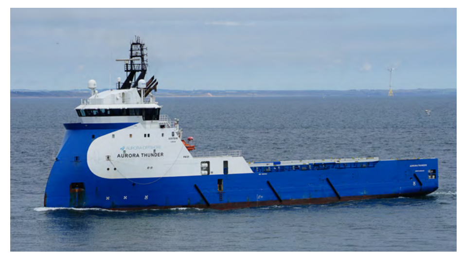
AURORA THUNDER Norway

OSV Rawabi 29 (2022 - 9671369). Yard: Fujian Southeast Shipyard, ynr. NC709. 2.638 GT. Dim. 78,70 x 16,01 x 5,90. Engines: 2x Caterpillar. Owner and operator: Rawabi Vallianz Offshore Services, Al-Khobar. Launched as Jaya Kenyalang. OSV Zamil 65 (2022 - 9812511). Yard: Dayang Offshore Equipment, Taixing. 2.555 GT. Dim. 65,00 x 16,20 x 6,00 m. Engines: 2x Niigata, 6L26HLX, total: 4.000 bhp. Speed: 12 kn. Owner and operator: Zamil Offshore Services Co. Ltd., Al-Khobar. Launched as OSV Latargo.