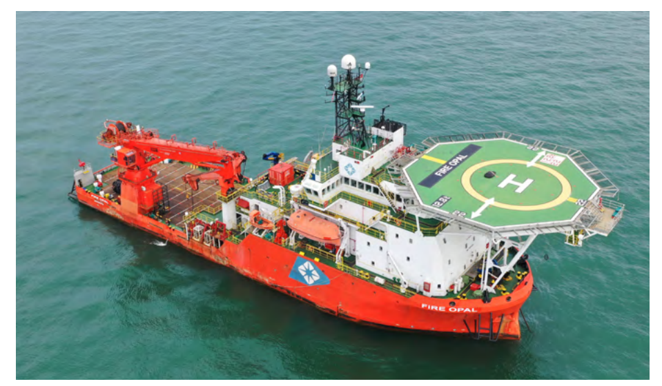
FIRE OPAL Singapore

AHT Stanford Mariner 2, ex Jaya Mariner 2 '11 (2002 - 9263473) owned and operated by Stanford Marine LLC has been sold