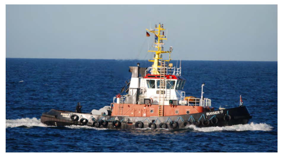
BUGSIER 17 Germany

Tugs MTS 52 (2022 – 9960411) and MTS 53 (2022 – 9960423). Yard: Forward Marine Enterprise Sdn. Bhd., Sibu. Ynr. resp. FM-183