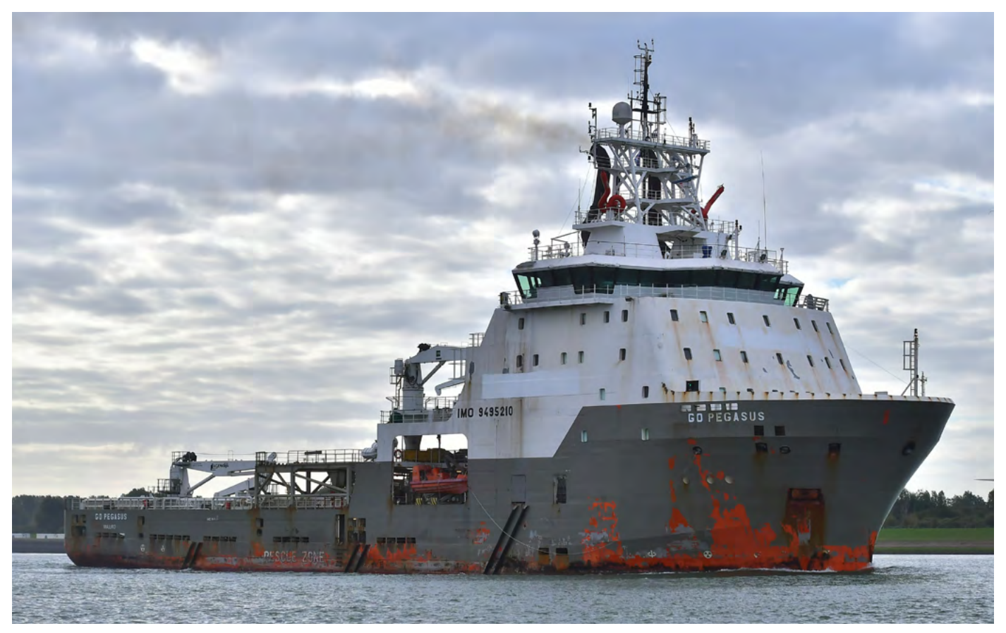
GO PEGASUS The Netherlands

OSV Rem Supplier , ex Hellespont Deity '10 (2010 – 9426647) owned by Solstad Rederi AS, operated by Solstad Maritime AS has been sold in 2022 to new owner Prometheus Tankers Ltd., operated by Atlantik Gemi Isletmeciligi AS, Istanbul (TUR) and has been renamed Muruvvet Ilhan .