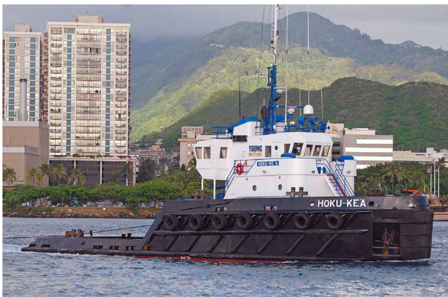
HOKU-KE'A United States

Tug Miss T (2009 – USCG 1285564) owned and operated by McLean Contracting Company has been sold in 2022 to new owner and operator Seaward Marine Services Inc., Chesapeake, VA and has been renamed Seaward 19 .