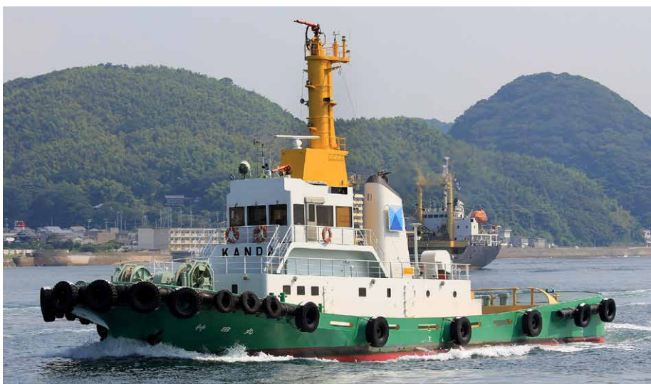
KANDA MARU Japan

Res. Survey Vessel Atlantic Enterprise , ex Karen Wood '88, Karen June '89, Preluda '91, American Champion '98, Geco Triton '15 (1970 – 7202554) owned and operated by Trident Marine Shipping Inc., Majuro has been beached at Gadani Beach (PAK) for scrap in March 2022.