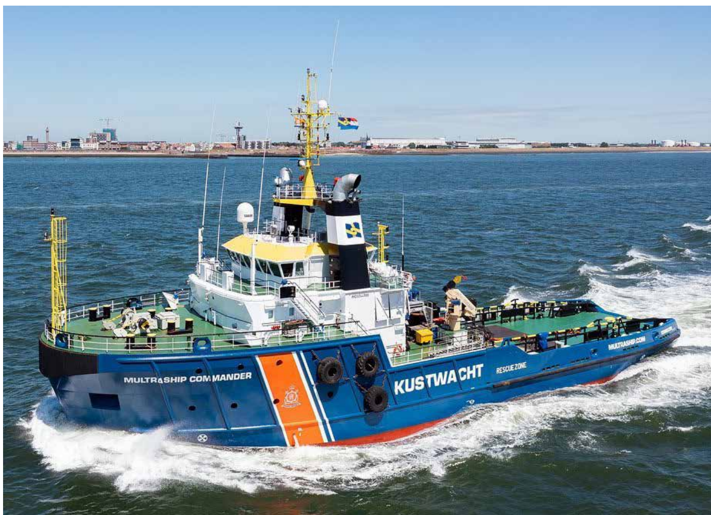
MULTRASHIP COMMANDER The Netherlands

Res. Survey Vessel Atlantic Explorer I , ex Milbrook '92, Milbrook Surveyor '95, Atlantic Explorer '19 (1982 – 8003694) owned and operated by Clement A has been sold in 2021 to new owner and operator Firgrove Holdings Pvt. Ltd., Durban (ZAF) and has been renamed BML Explorer .