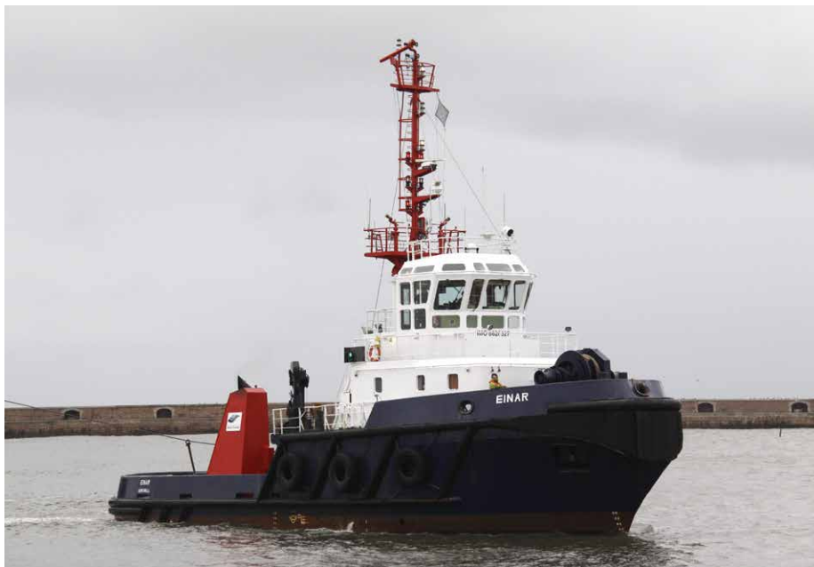
EINAR United Kingdom