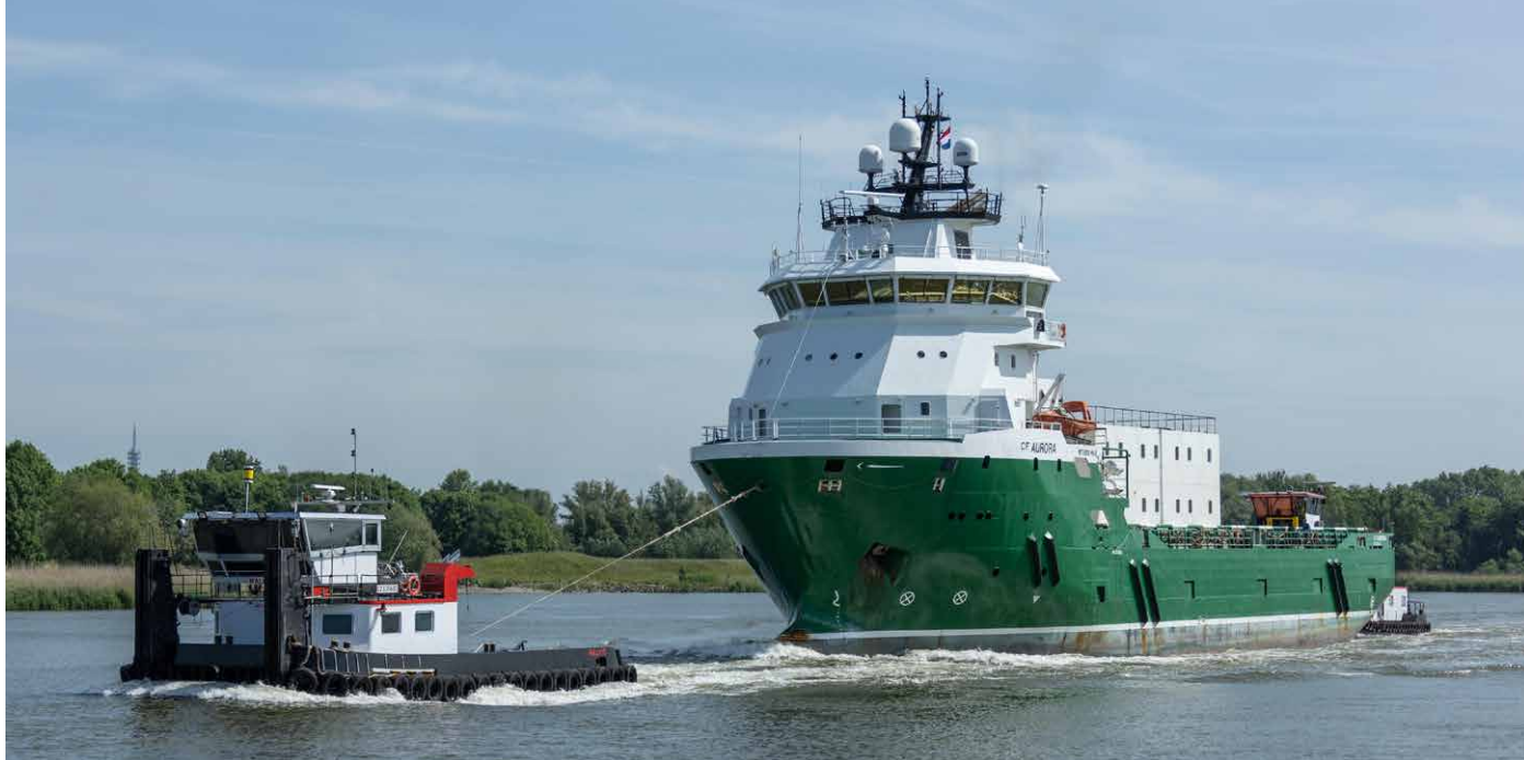
CF AURORA Norway