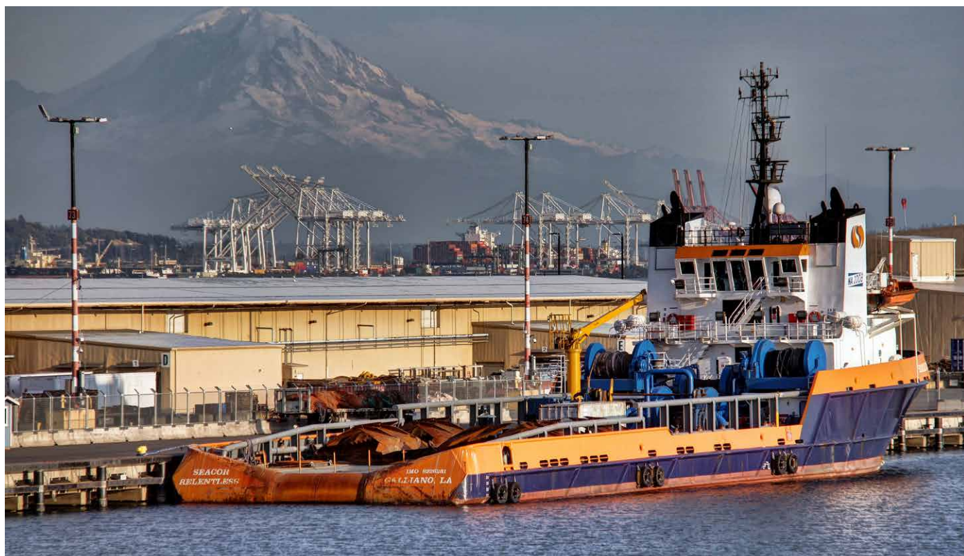
SEACOR RELENTLESS United States

www.towingline.com – Archive and www.sleepduwvaart.nl