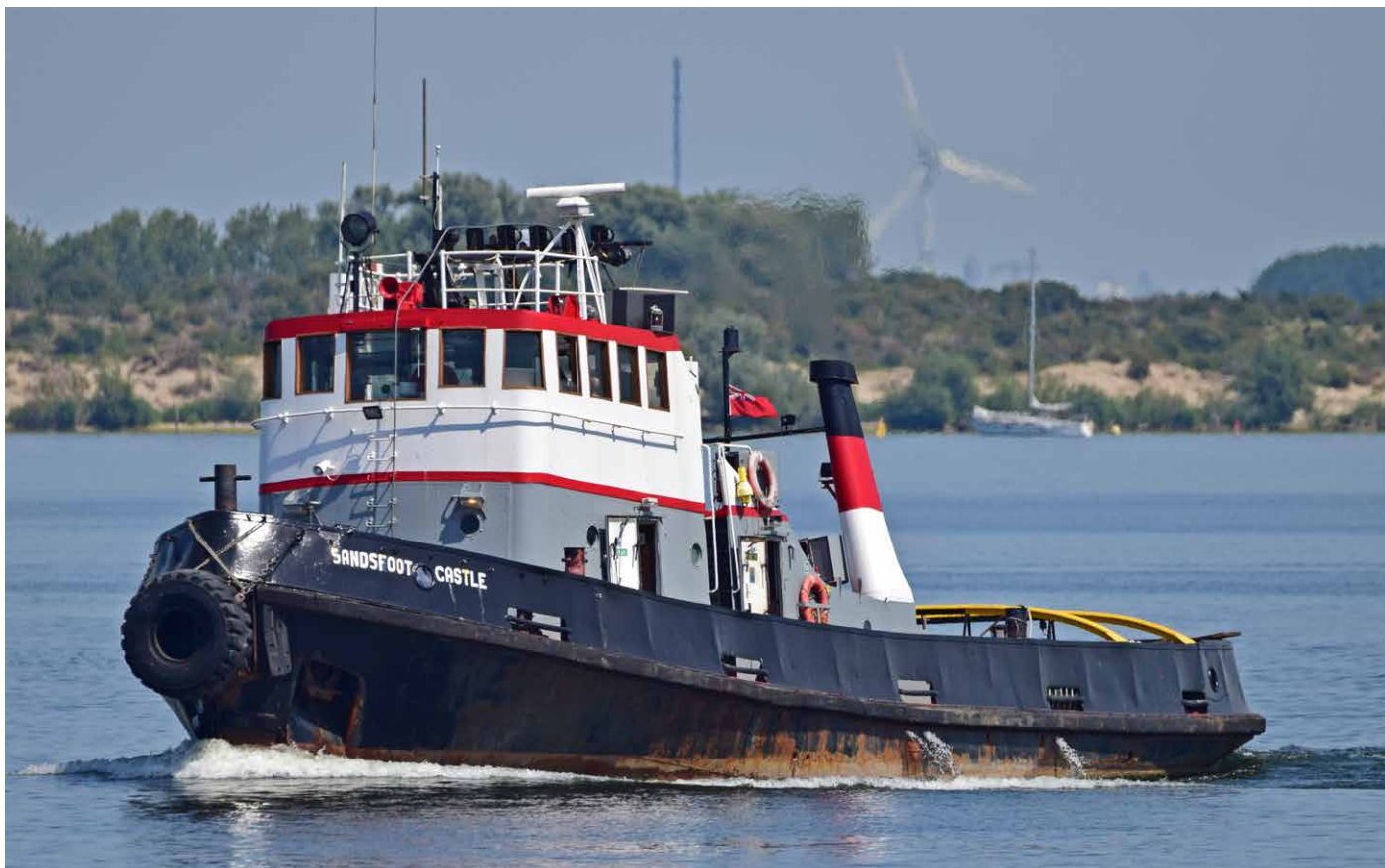
SANDSFOOT CASTLE United Kingdom