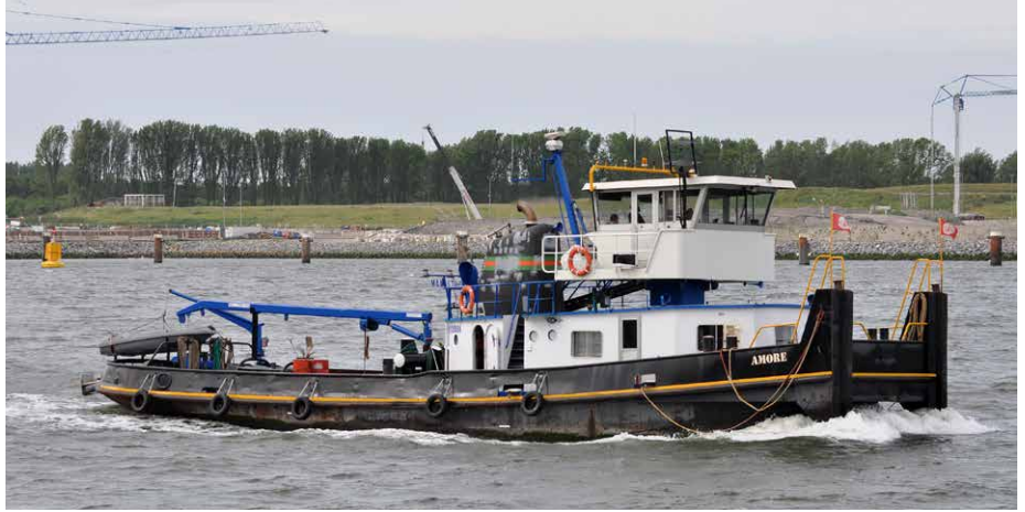
AMORE The Netherlands

Tug Doris (2022 – 9930595). RSD 2513 design. Yard: Damen Shipyards, Song Cam, ynr. 515025. 363 GT Dim. 24,73 x 12,53 x 4,97 m. Engines: 2x Caterpillar, total: 6.386 bhp. Owner and operator: Damen Shipyards, Gorinchem. Tug Fuzzy Wazzy (2022 – 9965564). Stan