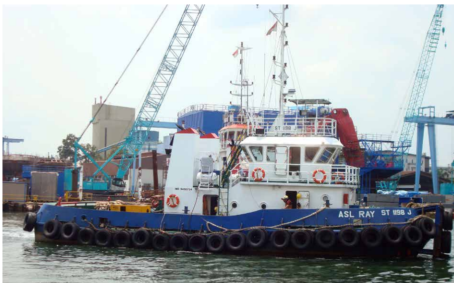
ASL RAY Singapore