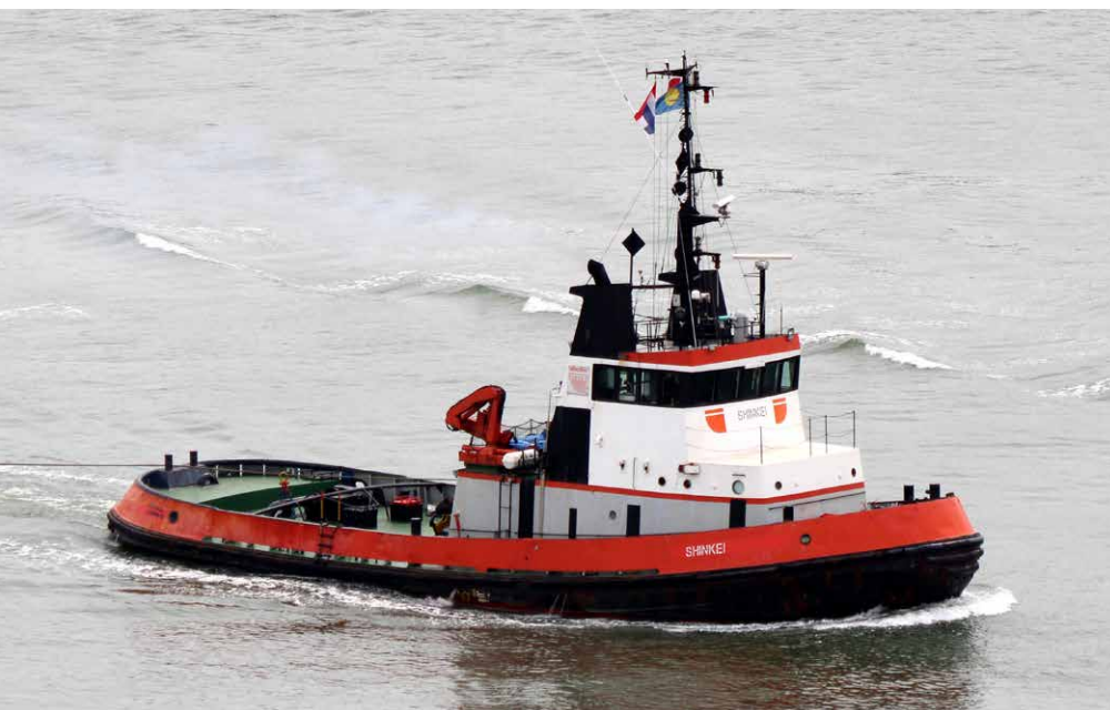
SHINKEI United Kingdom

ERRV Trafalgar Sentinel (2022 – 9720706). Yard: Fujian South East Shipyard, ynr. DN60M PSV 3. 2.030 GT. Dim. 60,00 x 15,80 x 5,20 m. Engines: 2x Niigata, 6L26HLX, total: 4.000 bhp. Speed: 14 kn. Owner: Sentinel