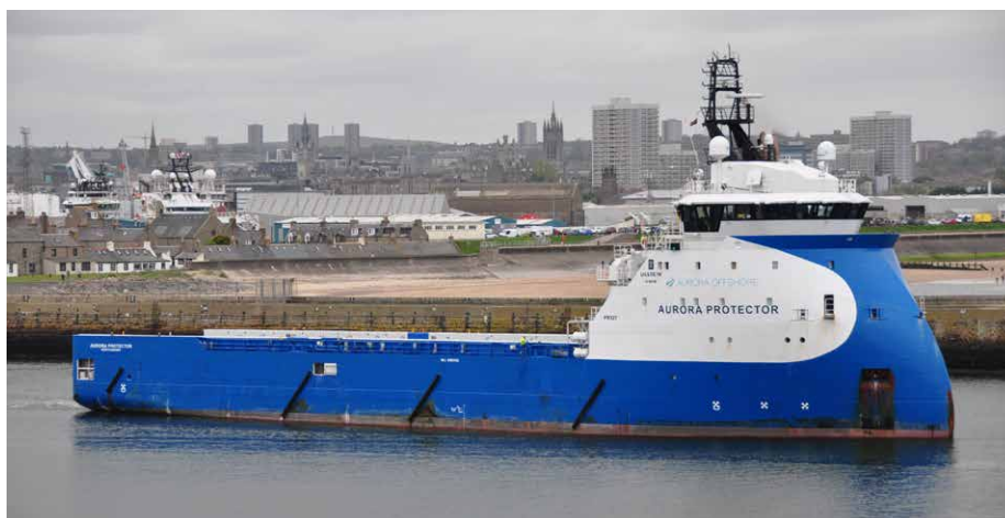
AURORA PROTECTOR Norway

OSVs Normand Aurora (2005 – 9329435) and Normand Corona , ex Rem Fortune '09 (2006 – 9343766) owned by Solstad Rederi AS, operated by Solstad Shipping AS have been sold in 2022 to new owner NFH FBM 211108 AS, operated by Atlantica Shipping AS, Oslo and have been renamed resp. Atlantica Supplier and Atlantica Provider . AHTS vessels Normand Mariner (2002 – 9249350) and Normand Master (2003 – 9266451) owned by Solstad Rederi AS, operated by Solstad Shipping AS have been sold in 2022 to new owner and operator Fujian Unites Ocean Engineer, Fujian (CHN) without change of name. AHTS Olympic Pegasus (2002 – 9257929) owned by Olympic AHTS AS, operated by Olympic Shipping AS has been sold in 2022 to new owner and operator Oceanrich No. 1 Wind Power Eng., Xinyingwan Qu (CHN) and has been renamed Oceanrich No. 1 . OSV Rem Mistral (2012 – 9620982) owned by Rem PSV AS, operated by Ocean Europe AS has been sold in 2022 to new owner Groupe CBO, operated by Thome Offshore Management, without change of name. OSV Skandi Sotra (2003 – 9276391) owned by DOF Rederi AS, operated by DOF Management AS has been sold in 2022 to new owner and operator Ketrosden Triasmitra PT, Jakarta and has been renamed Sotra . Tug Waterchief , ex Bogazici 7 '10, Waterchief '11, BB Hunter '13, Multratug 20 '20 (2010 – 9572006) owned and operated by Kristiansund Taubaatservice AS has been transferred in 2022 to new operator Multtraship Towage & Salvage B.V., Terneuzen (NLD) and has been renamed Multratug 20 .