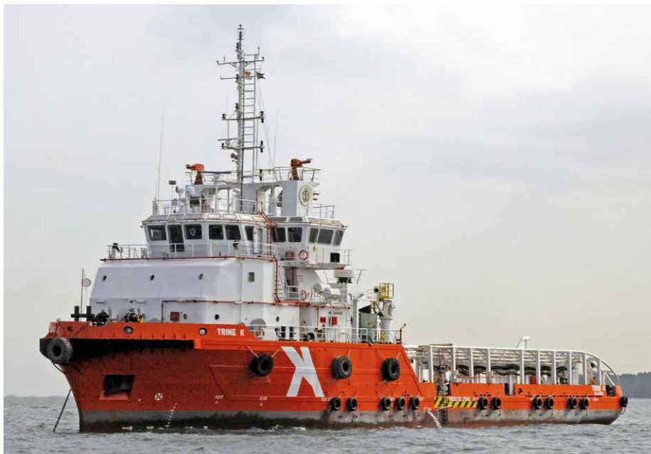
TRINE K Singapore