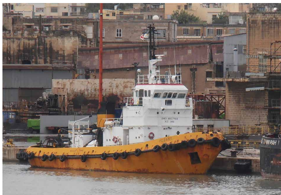
PILEAS / Cyprus