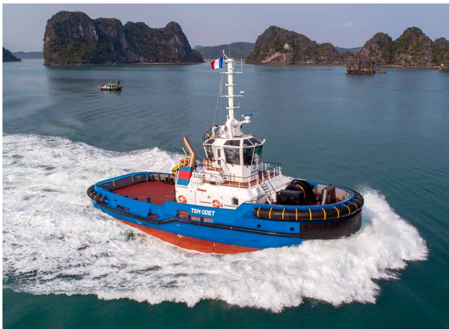
TSM ODET France

AHTS Christos LIX , ex Smit Lingga '16 , Afrik Orimilli '16 , SL Lingga '20 (2007 – 9371464) owned by IMS Christos LIX SA, operated by Spanopoulos Group SA has been sold in 2022 to new owner and operator Christos LV