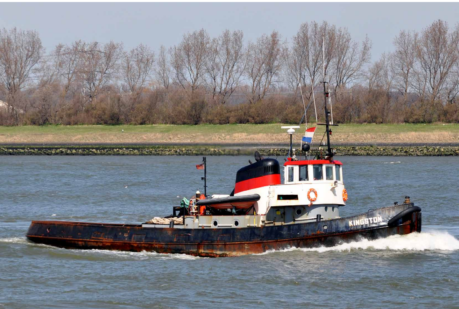
KINGSTON United Kingdom

The editors regrets that the e-magazine is unable to supply photographs published in Worldwide Tug & OSV News.