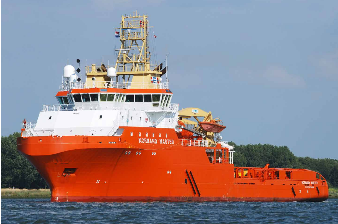
NORMAND MASTER Norway