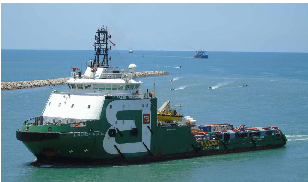
BOURBON MUKDA Singapore

Pushertugs AT-1602 , ex Barito Dunia '08 (1997 – 9169433) and AT-1603 , ex Marina Synergy '08, Maria 1 '09 (1999 – 9217383) owned and