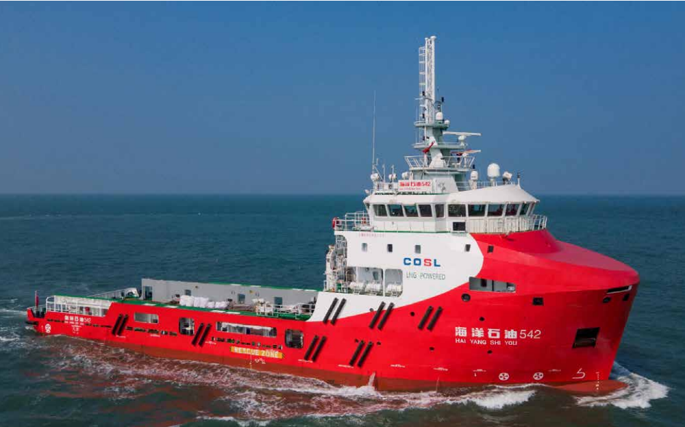
HAI YANG SHI YOU 542 China