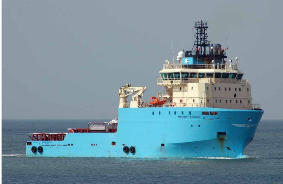
MAERSK TACKLER Denmark