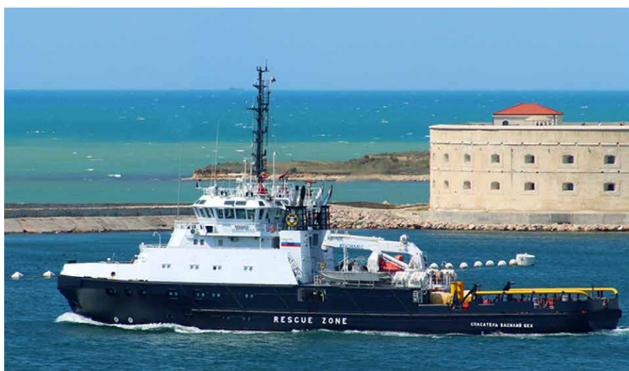
VASILY BEKH Russia

Tug Vasily Bekh , ex SB-739 '21 (2017 – MMSI 273542830) owned and operated by Ministry of Defence (Black Sea Fleet), while carrying personnel, weapons, and ammunition to resupply Russian-occupied Snake Island in the Black Sea has sunk on 17 June 2022 after an attack on the ship taken by a Bayraktar TB2 combat drone. Vasily Bekh was struck by two anti-