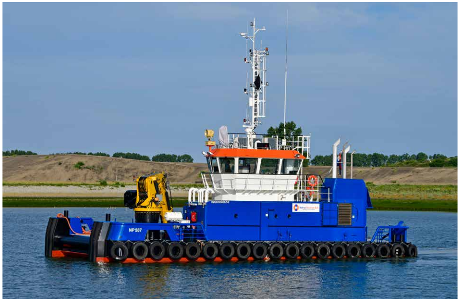
NP 587 The Netherlands