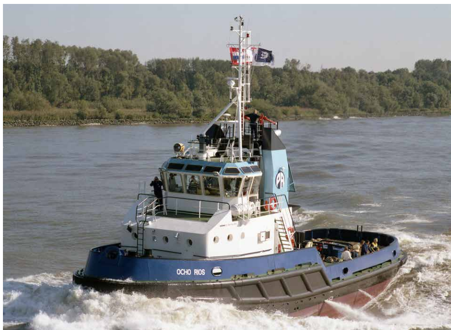
OCHO RIOS Jamaica

Tug Kaisei Maru (2010 – 9580170) owned by