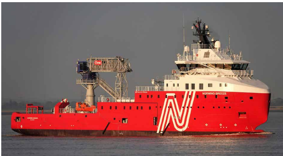
NORWIND BREEZE Australia

Tug WS Centaurus (2022 – 9927861). RSD 2513 design. Yard. Wilson Sons Shipyard,