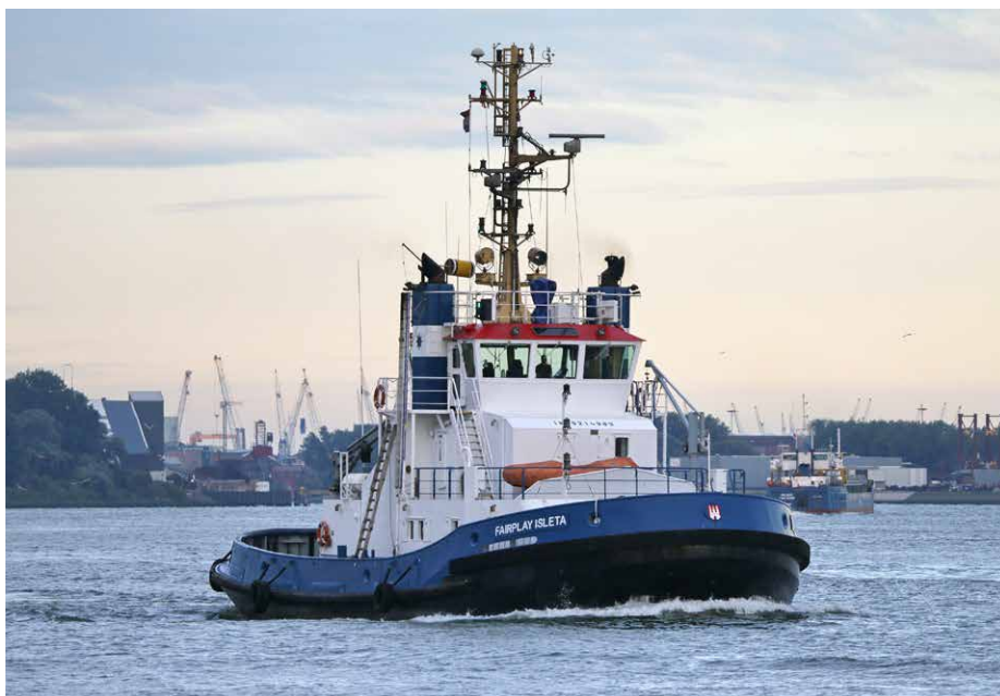
FAIRPLAY ISLETA Germany

OSV Energy Miner , ex Regal Service '95, Namibian Gem '03, Sakawe Miner '07 (1976