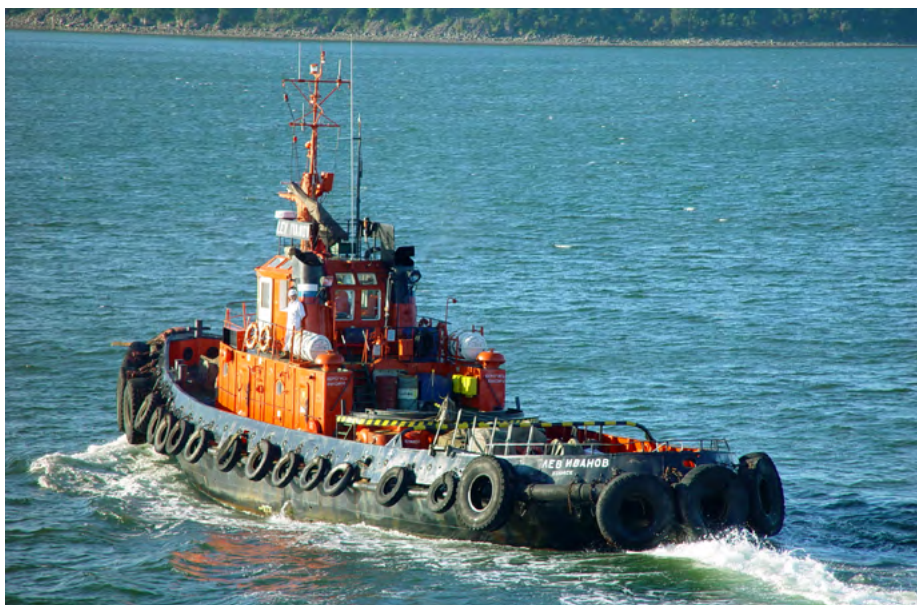
LEV IVANOV (Russia)