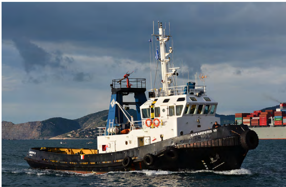
KARAPIPERIS 18 (Greece)

Salvage tug Piltun (2021 – 9797606). MPSV 12 project. Yard: Nevsky Shipyard, ynr. 1204. 3.030 GT. Dim. 79,85 x 17,36 x 6,70 m. Total: 7.070 bhp. Speed: 14 kn. Operator: Russia Govt. Min. of Transport. Tug Pomor (2021 – 9897444). ASD 3413 ICE design. Yard: Onezhsky Shipyard, Petrozavodsk, ynr. 410. 498 GT. Dim. 33,70 x 12,50 x 5,70 m. Engines: 2x MAN,