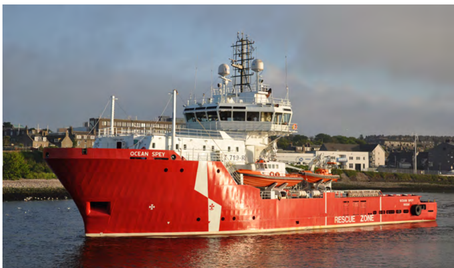
OCEAN SPEY (Ireland)

Tug Mutha Diamond (2021 – 9934632). Yard: Tang Tiew Hee & Sons, ynr. 86. 272 GT. Dim. 27,80 x 8,60 x 4,20 m. Engines: 2x Yanmar, total: 2.398 bhp. Operator: HRS Infratech Pte. Ltd.