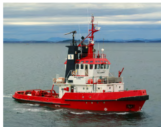
MAX MAMMUT (Norway)