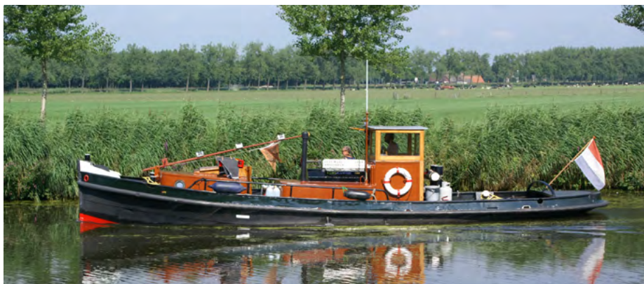
OUDE WAAL 1 (The Netherlands)

Tug Almarfaa (1995 – 9111826) has been sold in 2021 by Abu Dhabi Marine Service Safeen to Milos Shipping Ltd., Majura (MHL) and has been renamed Theodoros V .