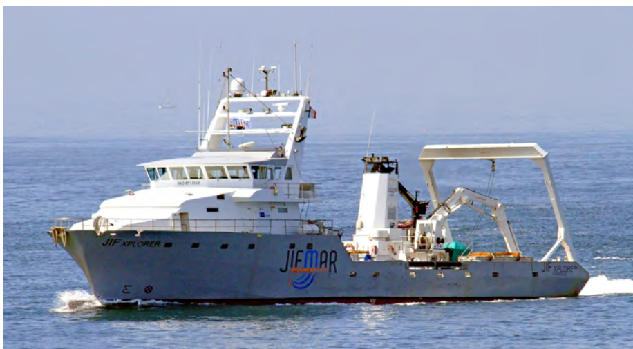
JIF XPLORER (France)