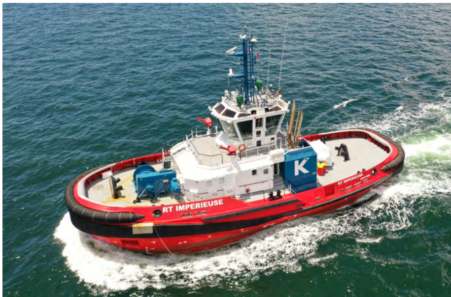
RT IMPERIEUSE (The Netherlands)