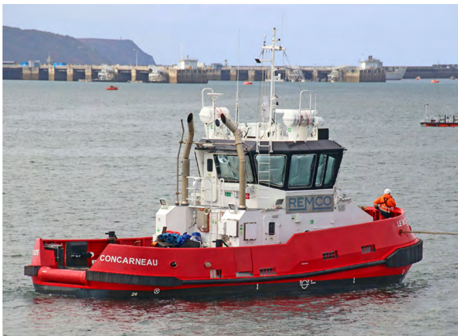
LE MOROS (France)