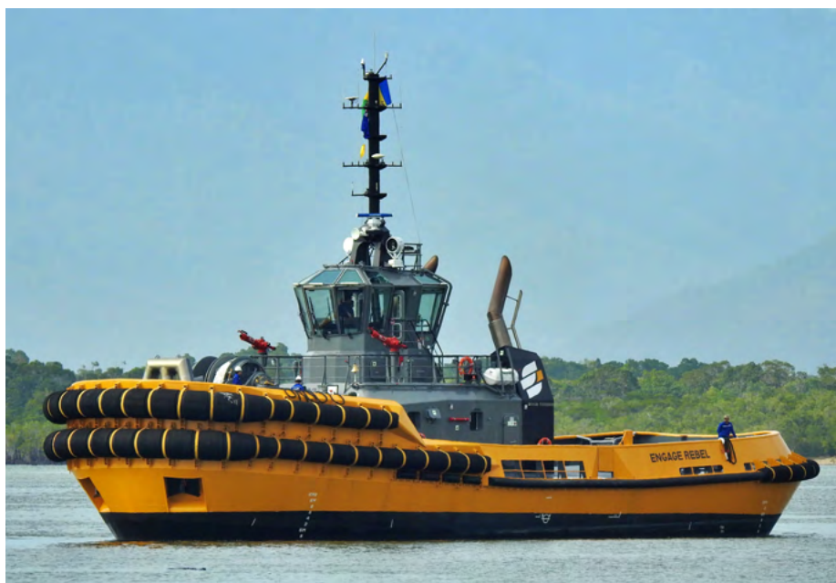
ENGAGE REBEL (Australia)

Tug Condor (2021 – 9685786). EuroTractorTug 2410 design. Yard: Neptune Shipyards, Aalst (NLD), ynr. NP520. 222 GT. Dim. 24,32 x 11,00 x 3,80 m. Engines: 2x Caterpillar, total: 2.636 bhp. (Tier III). Speed: 10 kn. Operator: Verbeke Shipping BVBA, Hemiksem.