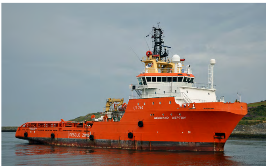
NORMAND NEPTUN (Norway)