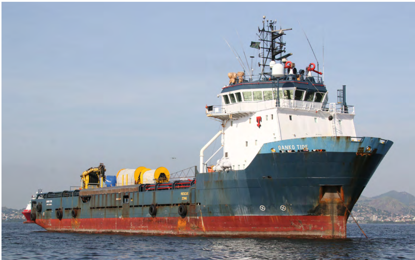
DANKO TIDE (Brasil)

Tug Oubangui (2021 – 9770878). ASD 2810 design. Yard: Damen Albwardy, Sharjah, ynr. 512385. 293 GT. Dim. 28,67 x 10,43 x 4,60 m. Engines: 2x Caterpillar, 3516TA HD/C, total: 5.068 bhp. Bollardpull: 60 tonnes, speed: 12,9 kn. Operator: Port Autonome de Pointe Noir.