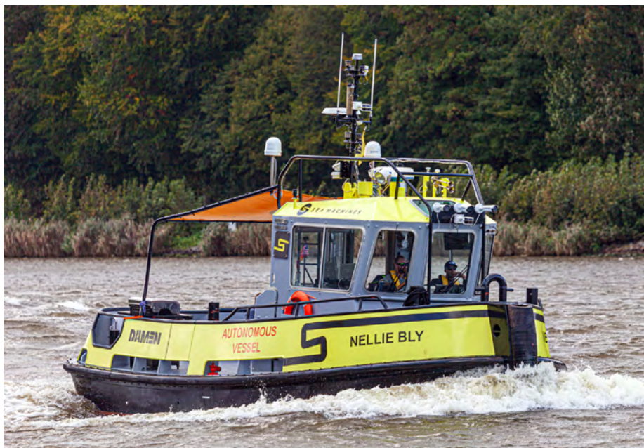
NELLIE BLY (The Netherlands)

Tug GPS Arcadia , ex PB Alligator '16 (2009 – MMSI 232011624) has been sold in 2021 by GPS Marine Ltd. to