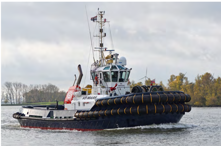
VB MARS (The Netherlands)