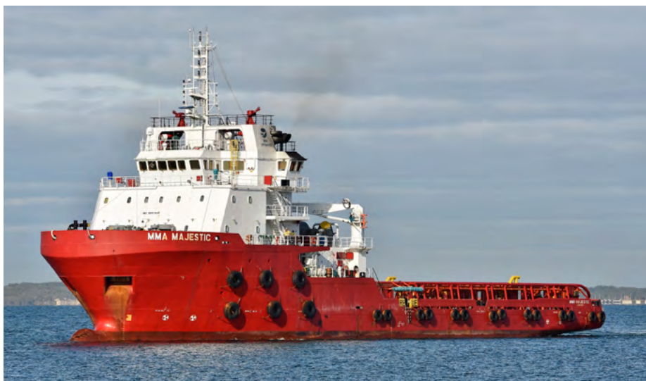
MMA MAJESTIC (Malaysia)