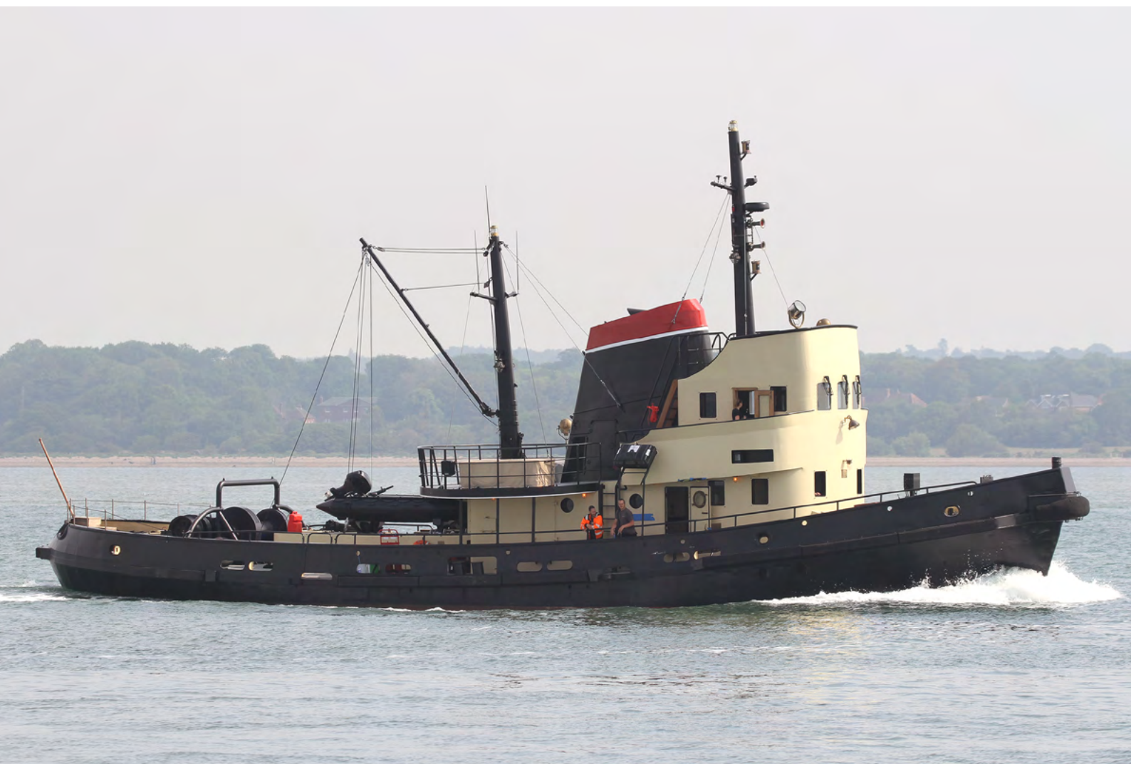
TANERA MOR (see Worldwide Tug & OSV News 2021-10)

The editors regrets that the e-magazine is unable to supply photographs published in Worldwide Tug & OSV News.