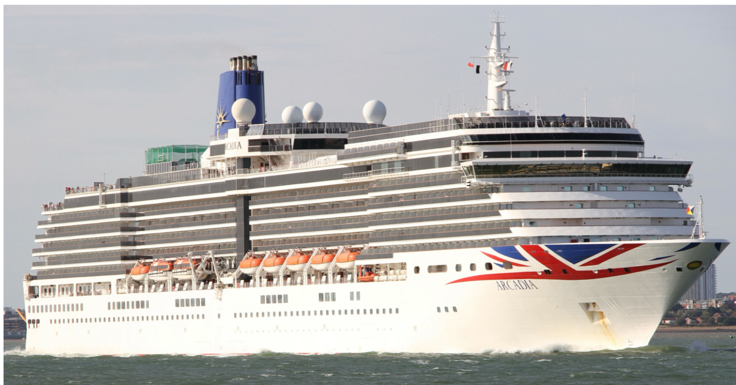
ARCADIA - departing 6th September bound for Lisbon. Taken on the TSS Cruise.