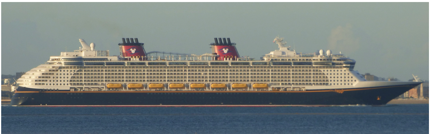
DISNEY FANTASY - departing 8th September passing Ryde on a lovely evening!

(F) Funnels, (S) Speed, (P) Passengers, (L) Length.