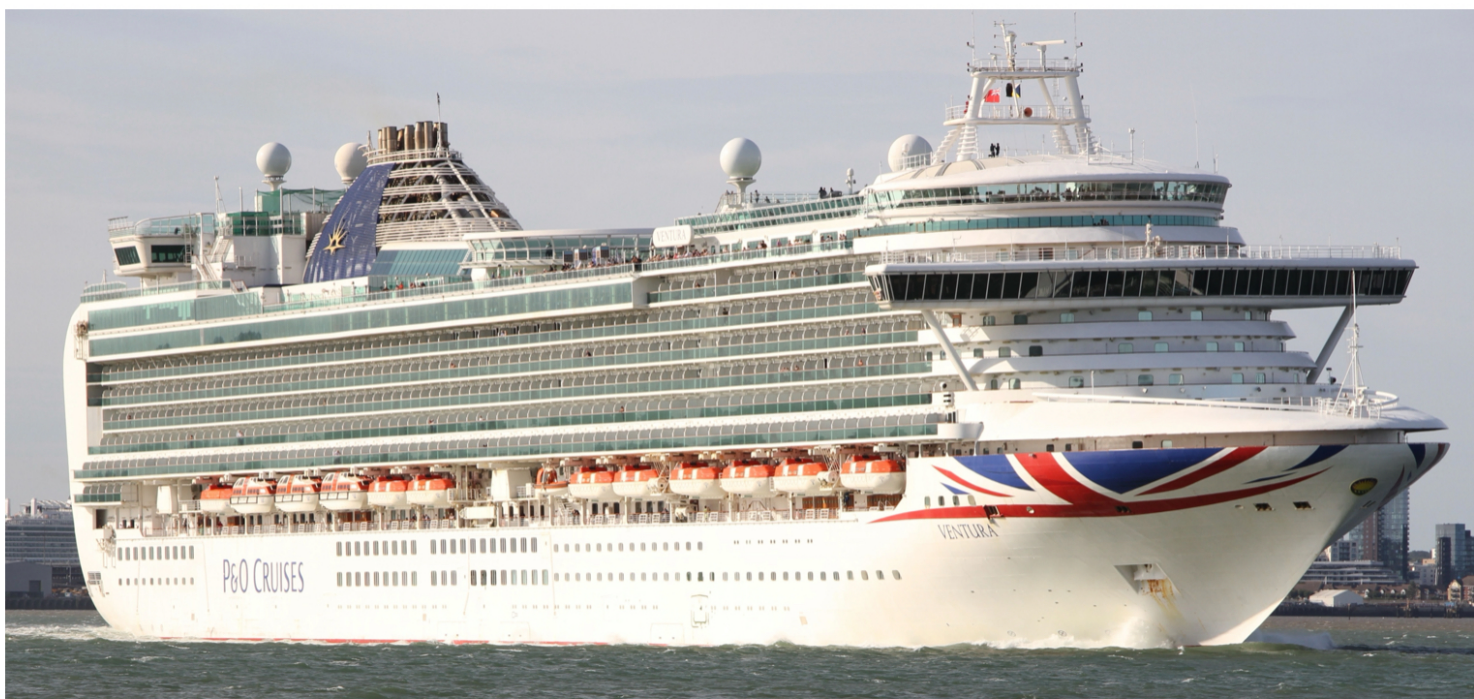
VENTURA - departing 6th September bound for Funchal. Taken on the TSS Cruise.