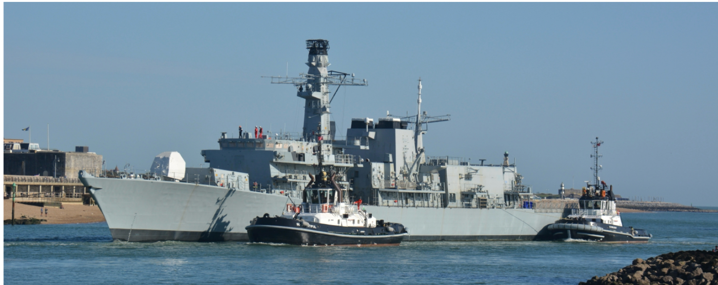
EX HMS ARGYLL arriving for disposal on tow tug Camperdown 19th September.