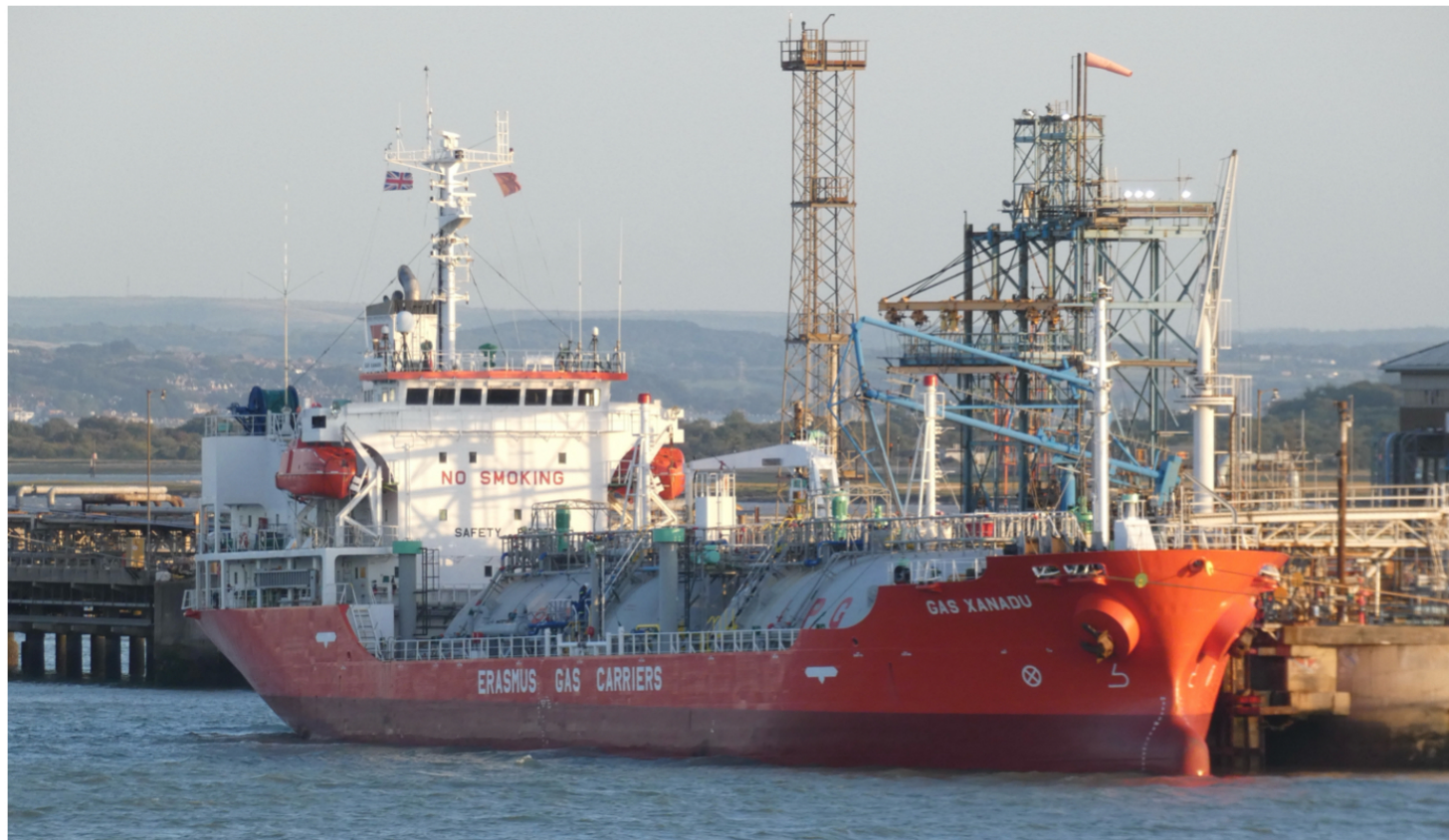
GAS XANADU - LPG tanker arrived on Esso 1 lunchtime on 6th from Amsterdam.