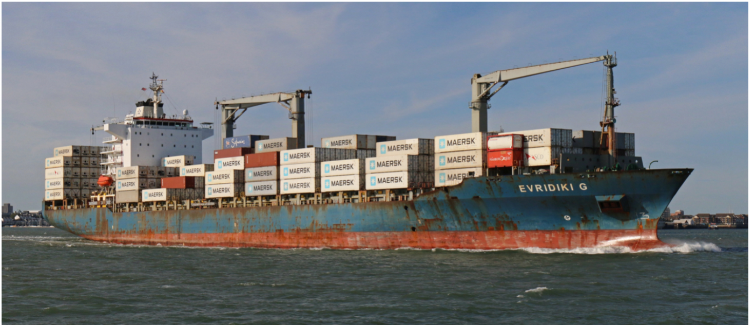
EVRIDIKI G - rather rusty! outbound on the 6th, departed SCT 2/3, bound for Antwerp.