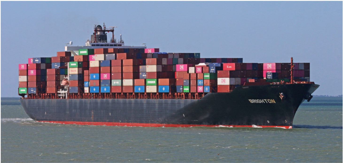
BRIGHTON - Zodiac Maritime operated - inward bound on the Solent on the 25th.