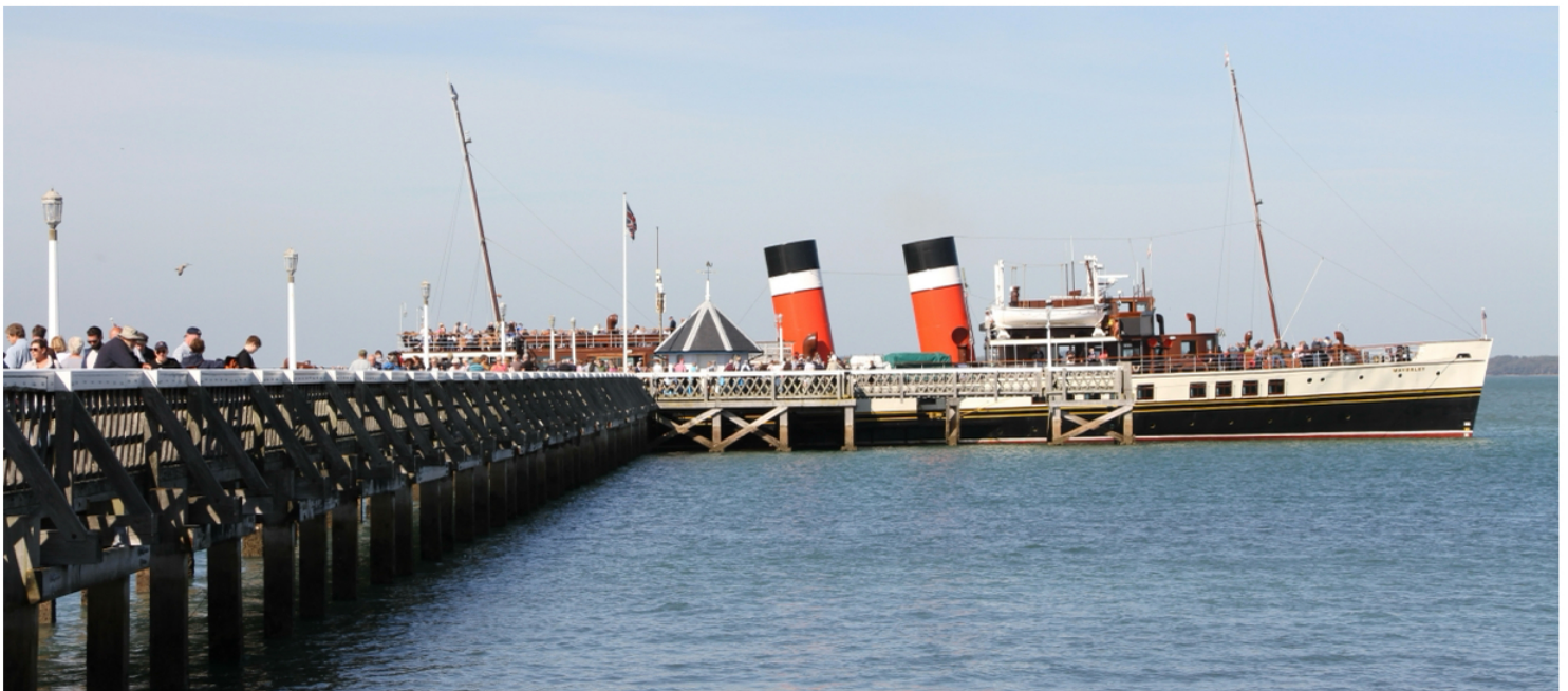
WAVERLEY - on her South Coast trips round the Solent. Seen here at Yarmouth 19th.