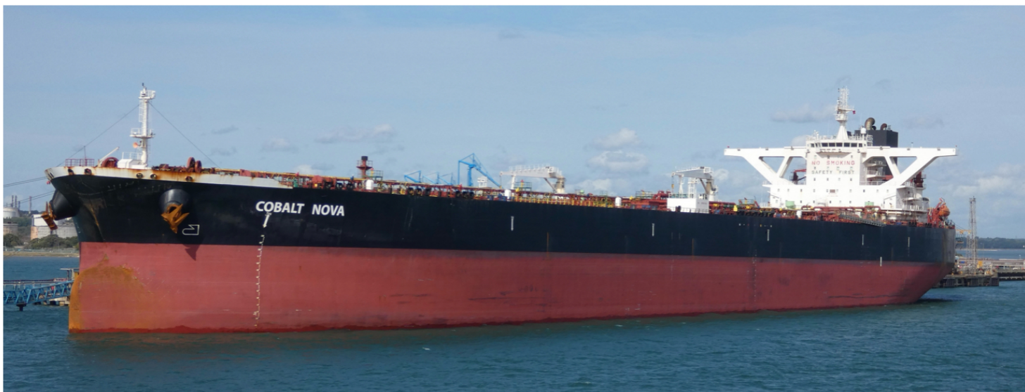
COBALT NOVA - finishing discharge having loaded at Rotterdam.