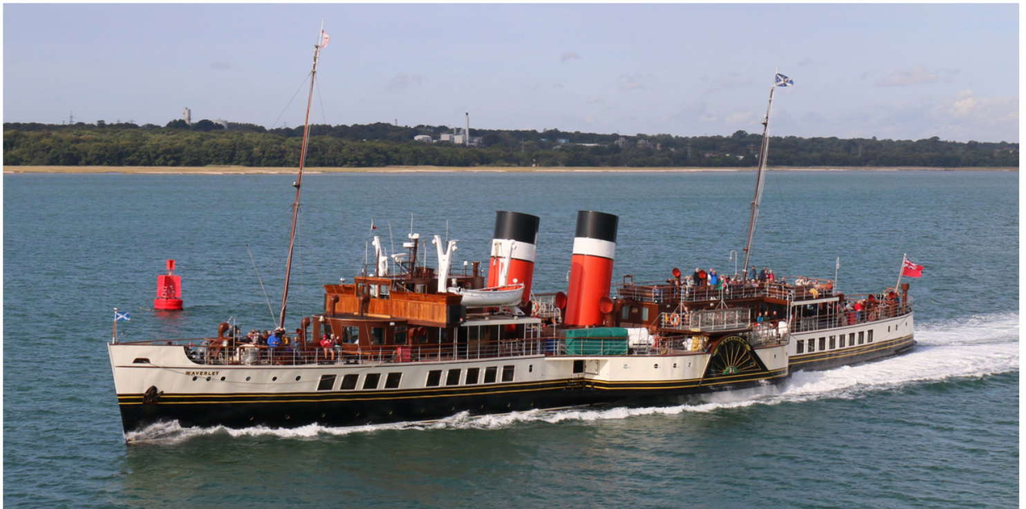
WAVERLEY - here for the late summer season sailings seen here on the 6th.