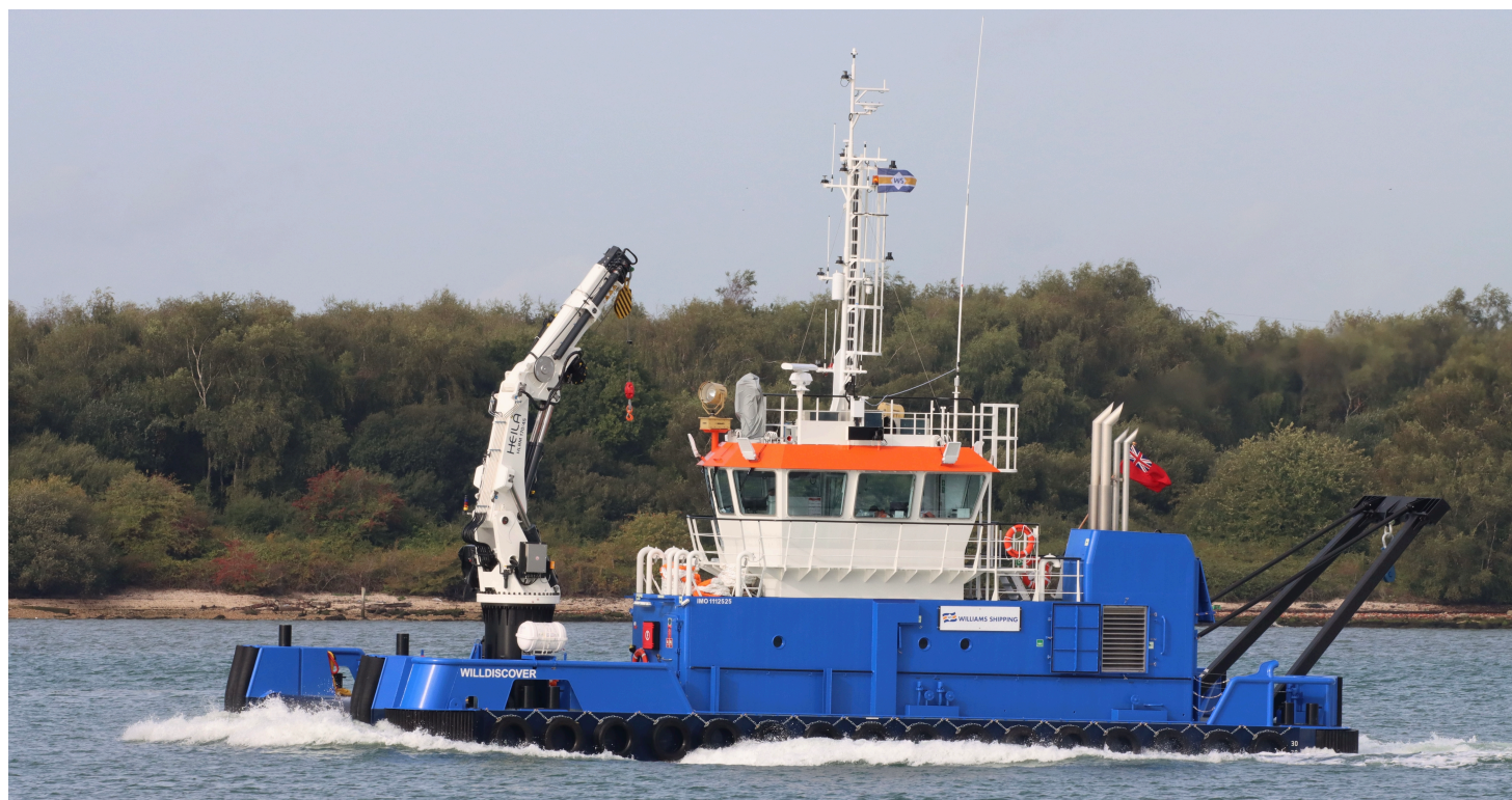
WILLDISCOVER - the brand newly delivered for Williams Shipping.