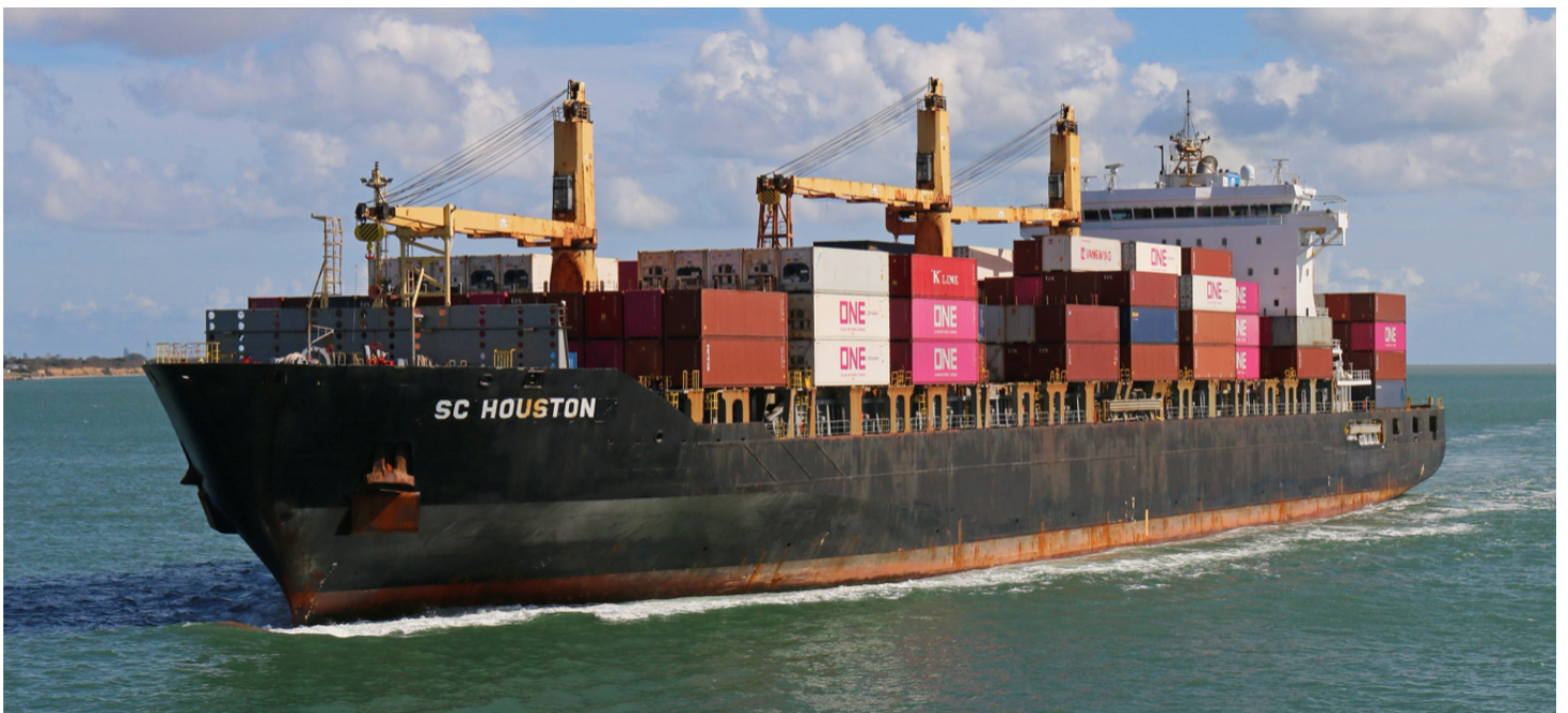
SC HOUSTON - inward for SCT 3/4 berth having arrived from Rotterdam.