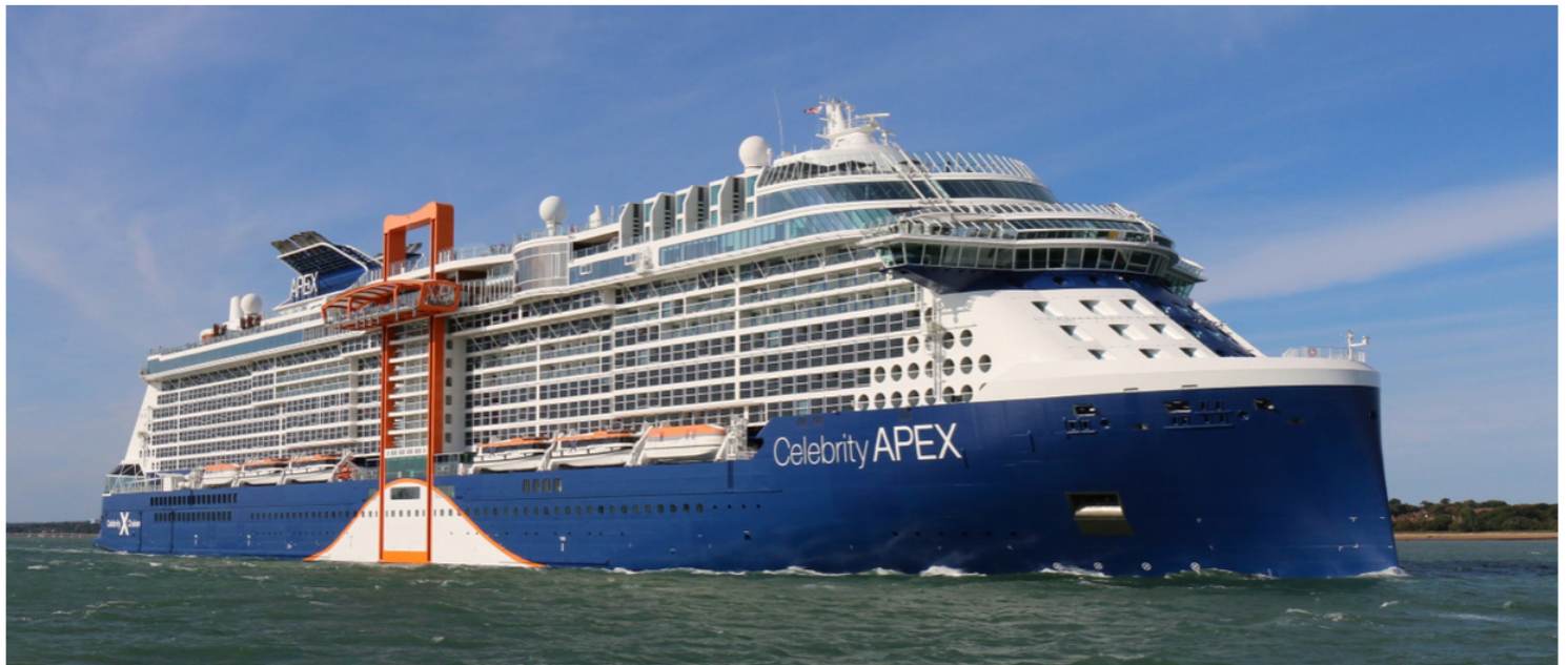
CELEBRITY APEX - the brand newly delivered for Williams Shipping.