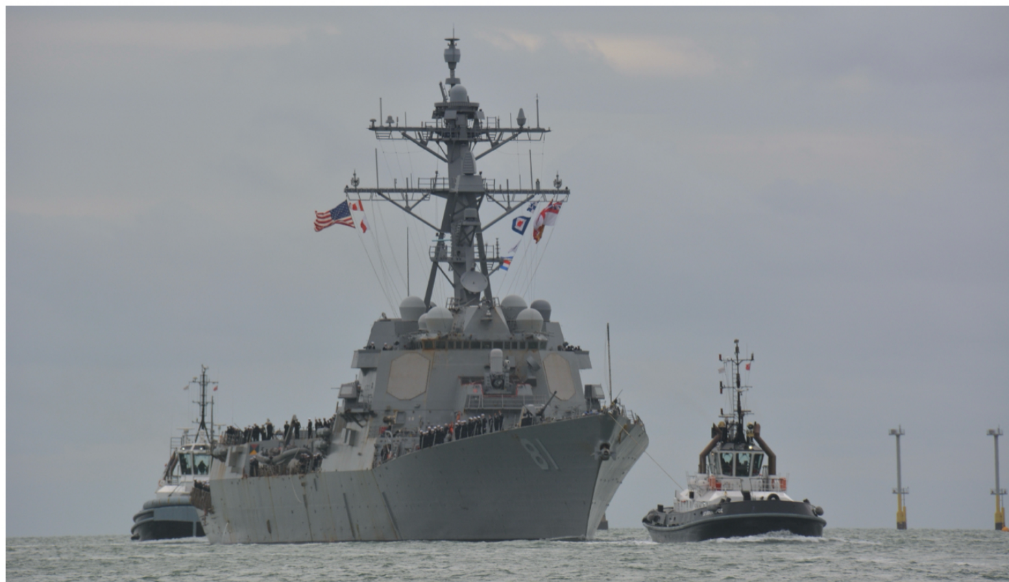
USS WINSTON CHURCHILL - arriving 14th September on a visit to Portsmouth.