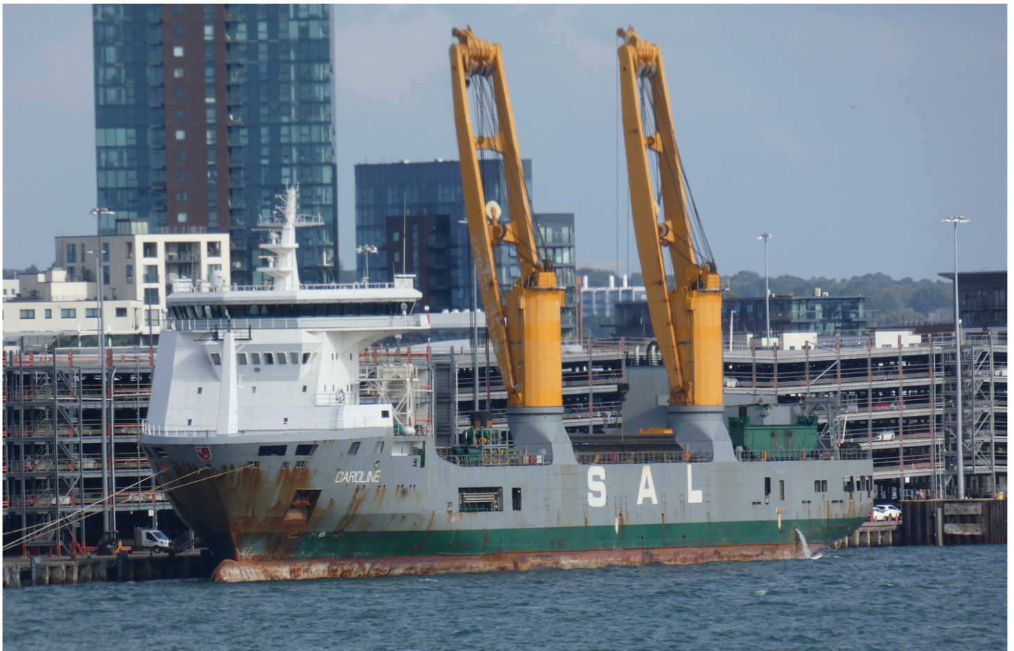
CAROLINE - Arrived 31 berth from Le Trait on River Seine to load yachts.