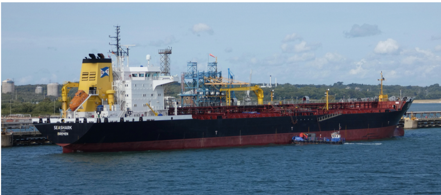
SEASHARK - German-flagged oil product tanker at Esso 2, loading for Las Palmas.