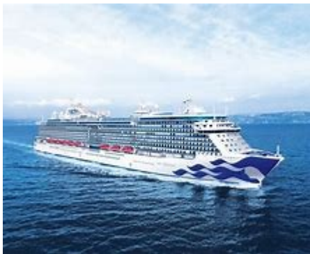
Sky Princess Built 2019 ` Tubul Built 2011 88586 GRT 145281 GRT Bermuda Liberia