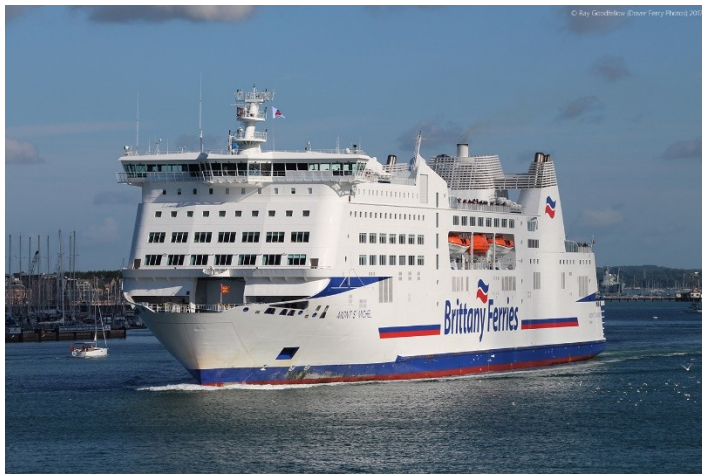
Mont St Michel Built 2002 35891 GRT France