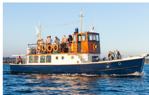
Dorset Queen Built 1936