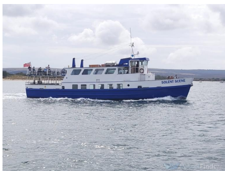
Solent Scene Built 1974 LOA 7.44m