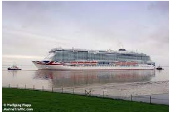
Iona Built 2020 184089 GRT UK