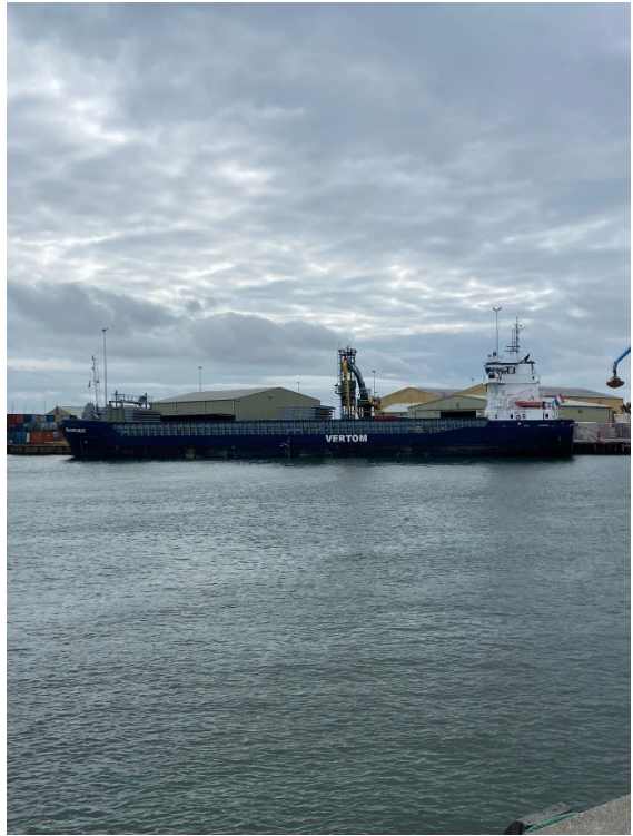
Beaumagic Built 2007 2545 GRT