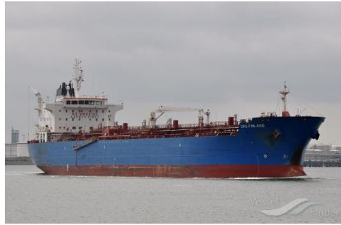
Chip Built 2008 23353