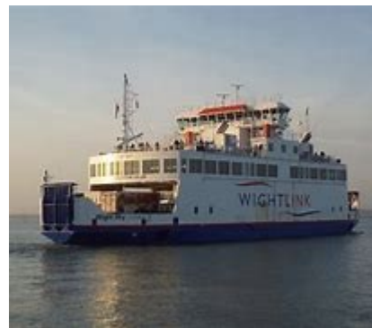
Wight Sky Built 2008 2546 GRT