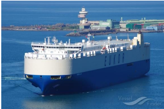
Morning lady Built 2010 70653 Korea