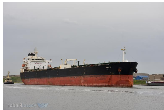
Athina Built 2008 42331 GRT Liberia