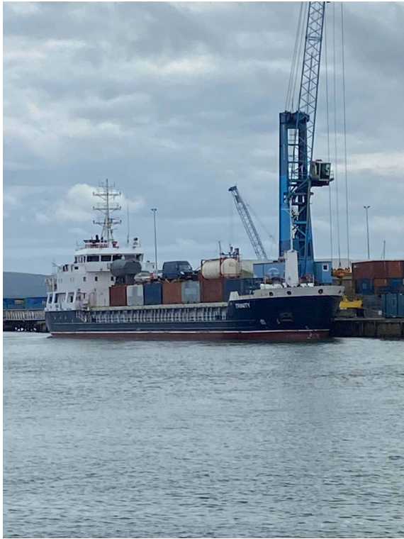
Trinity Built 2007 2102 GRT