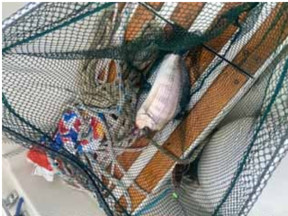
ZERO FOOD MILES