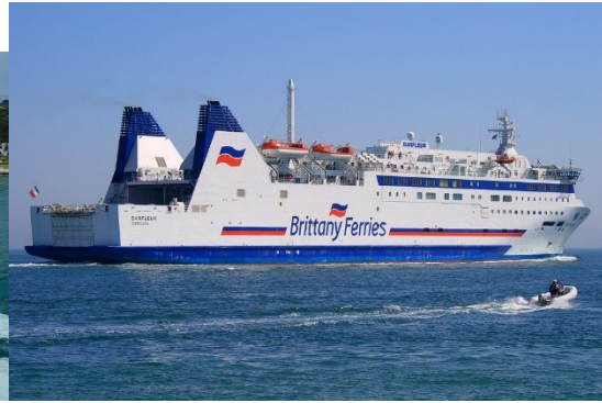
Barfleur Built 1992 20133 GRT