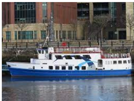
Riverscapes Fortuna Built 1977 135 GRT