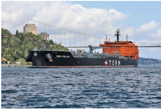
Torm Stellar Built 2020 28877