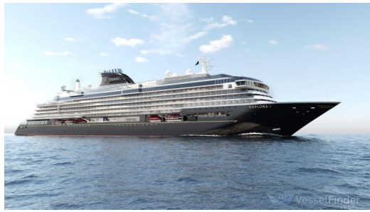
Explorer 1 Built 2023