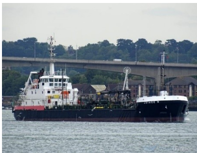
Jaynee W Built 1996 1689 GRT