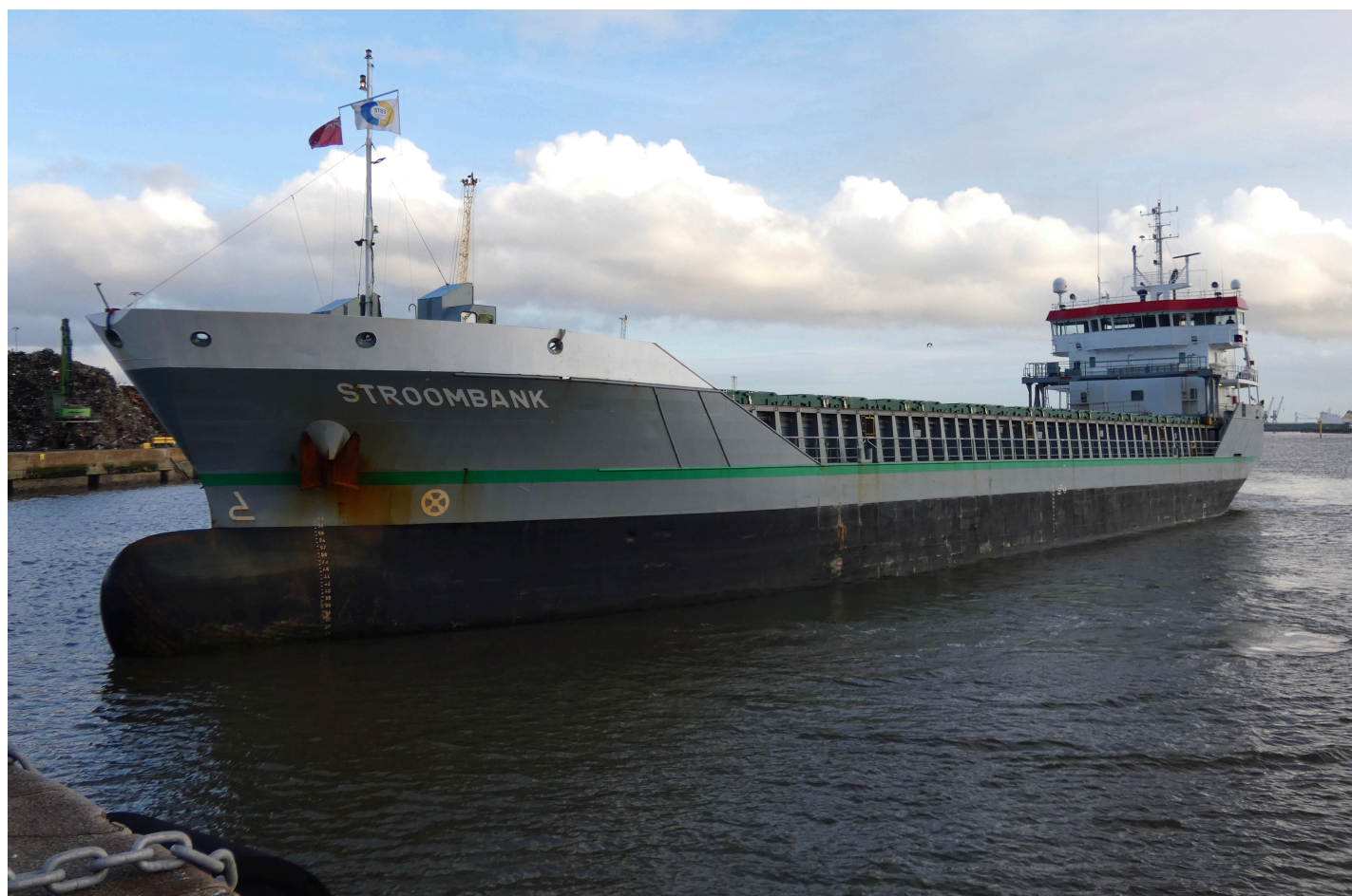
STROOMBANK - arriving on the 16th, KGV Dock (West side) from Liverpool.