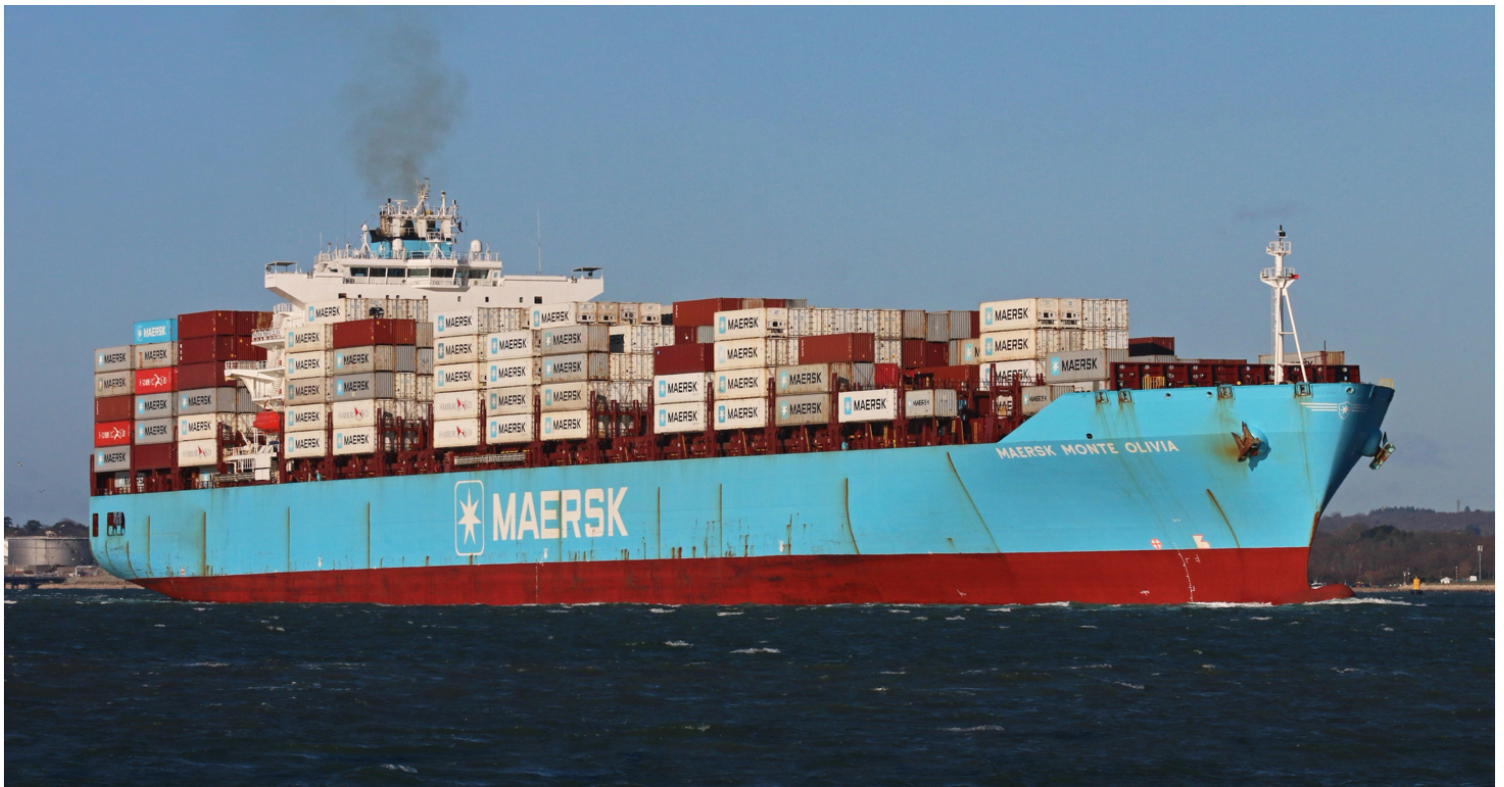
MAERSK MONTE OLIVIA - on the 3rd departing from SCT3/4 berth for Bremerhaven.

https://www.thamesshipsociety.org.uk/2026Programme.htm