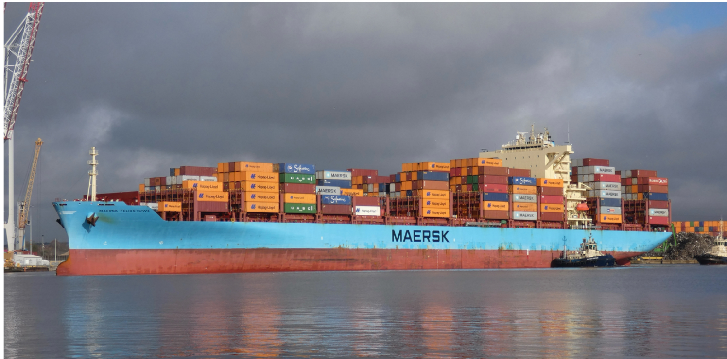
MAERSK FELIXSTOWE - arriving at SCT5 for a short 6-hour call; from Altamira.