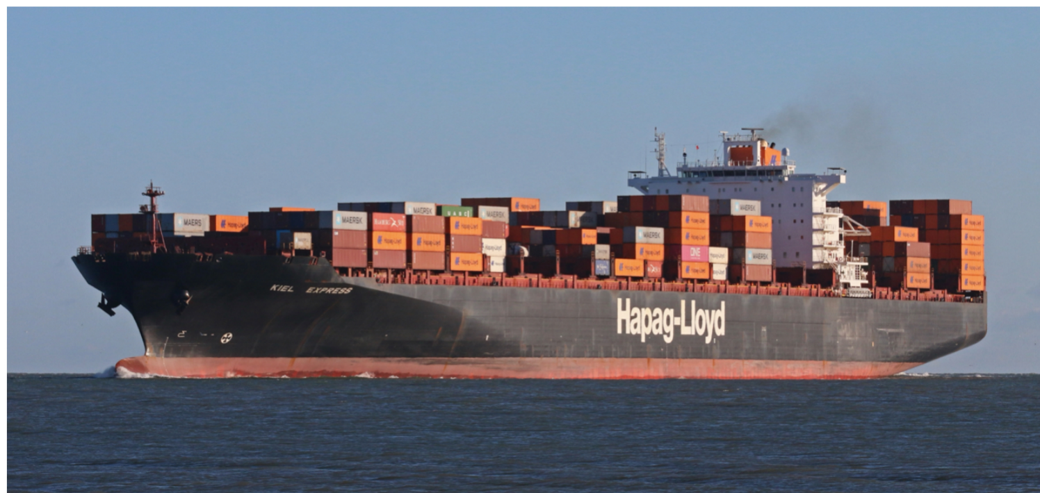
KIEL EXPRESS which passed inbound for SCT3/4 berth having arrived from Rotterdam.