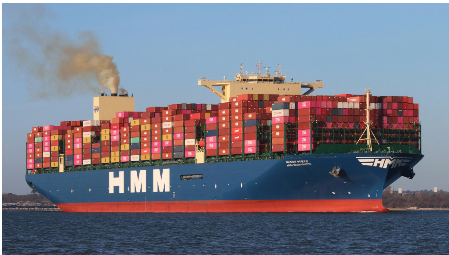
HMM SOUTHAMPTON - departing from SCT5, for Singapore. Employed on the FE3 service which will call at Felixstowe instead of Southampton from April, so it is likely to be her last call for the time being.