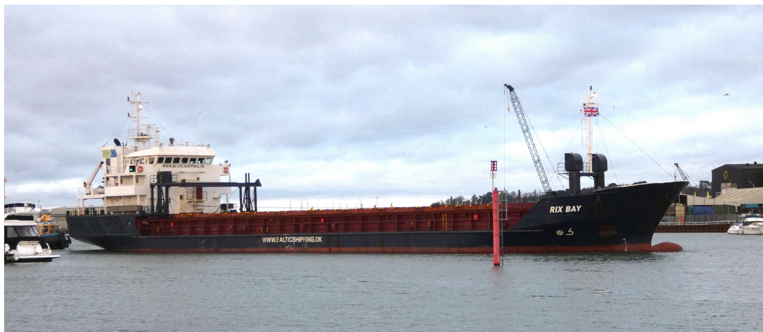
RIX BAY - passing Crosshouse late afternoon on 9th January with WYEKNOT on stern, having spent 3 days at Princes Wharf loading a scrap cargo for Bilbao in Spain.