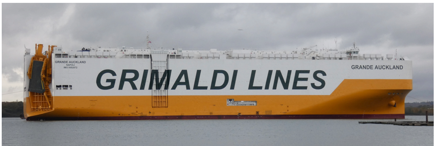
GRANDE AUCKLAND - arriving at SGL from Antwerp at end of maiden voyage on the 6th.