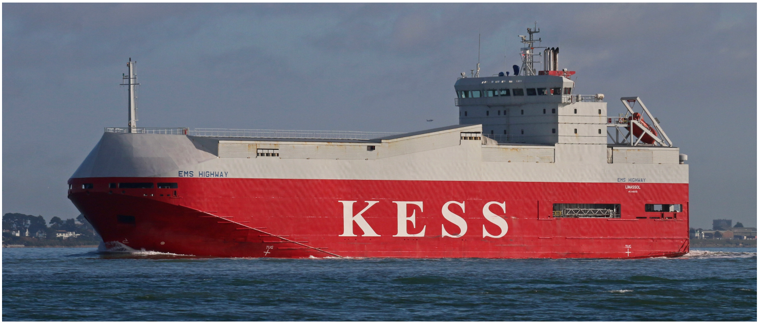
EMS HIGHWAY - inward bound in Southampton Water on 8th November for 105 berth.