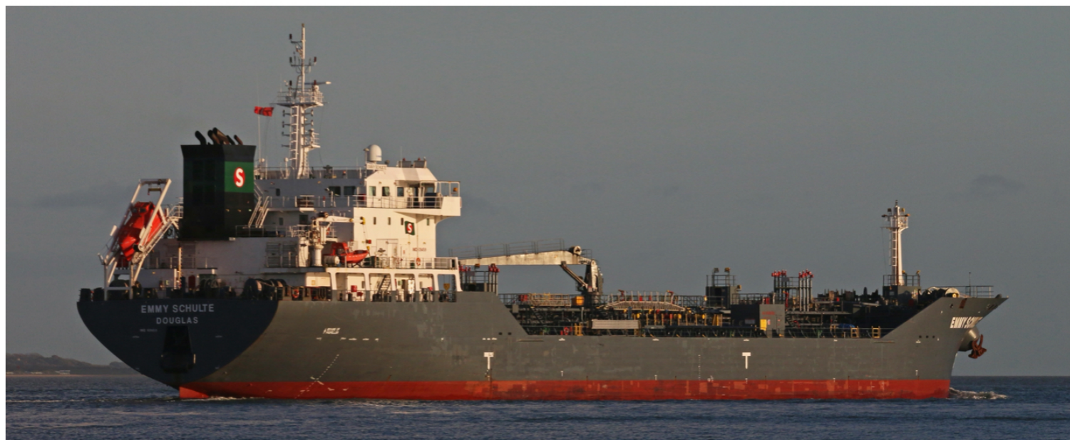
EMMY SCHULTE outward bound in Southampton Water on 8th November from Fawley.