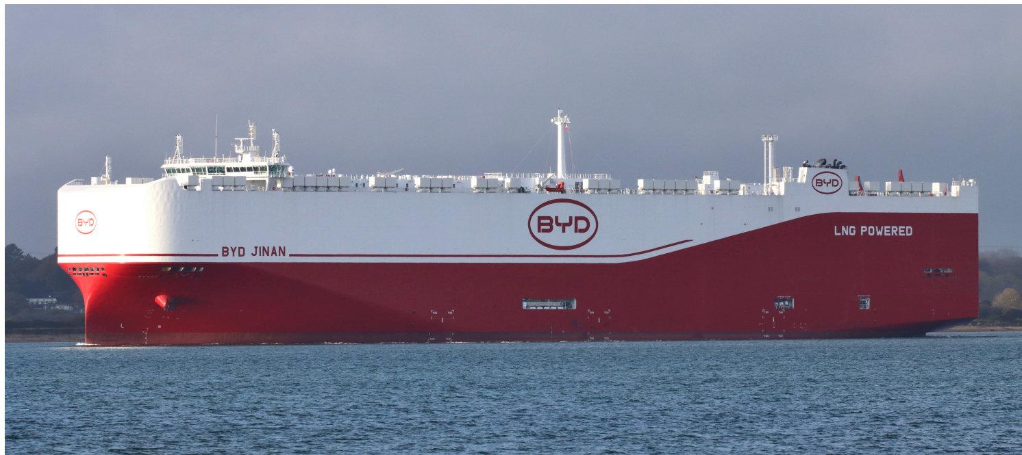
BYD JINAN - departing Southampton on the 13th November, on her maiden arrival.