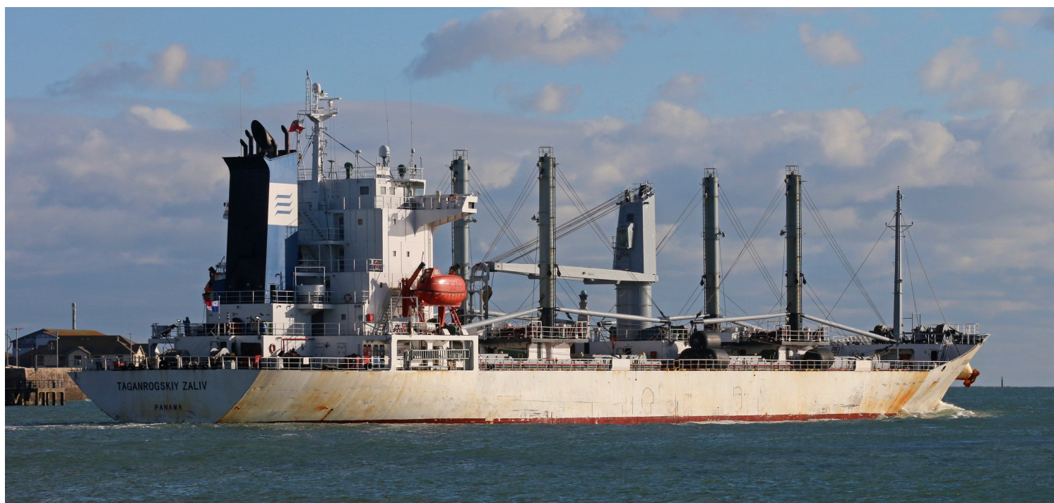
TAGANROGSKIY ZALIV - An unusual caller to Portsmouth on 20th for a 2.5 hour stay!