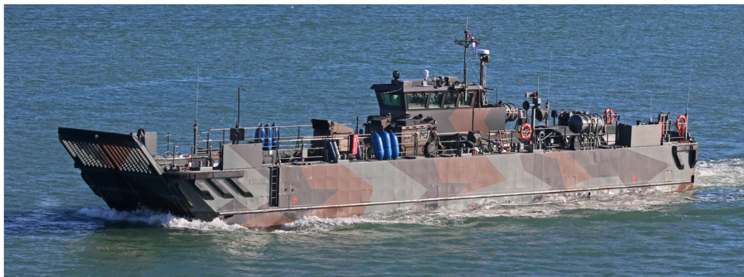
During November, Dutch landing craft were operating in the Solent and Southampton. LCU L9528 was seen returning to Marchwood on 2nd November.