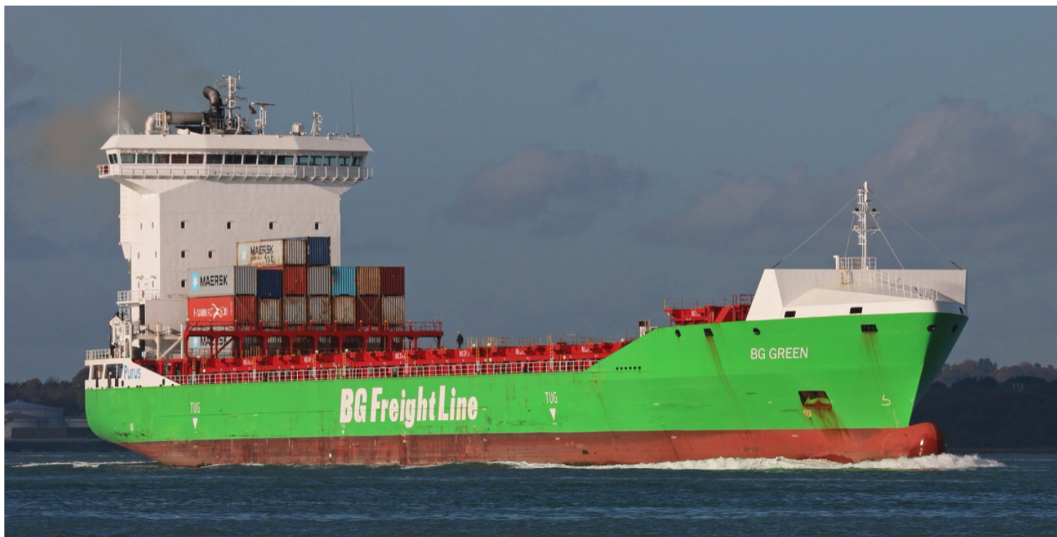
BG GREEN outward in Southampton Water, departed from berth SCT4, bound for London.