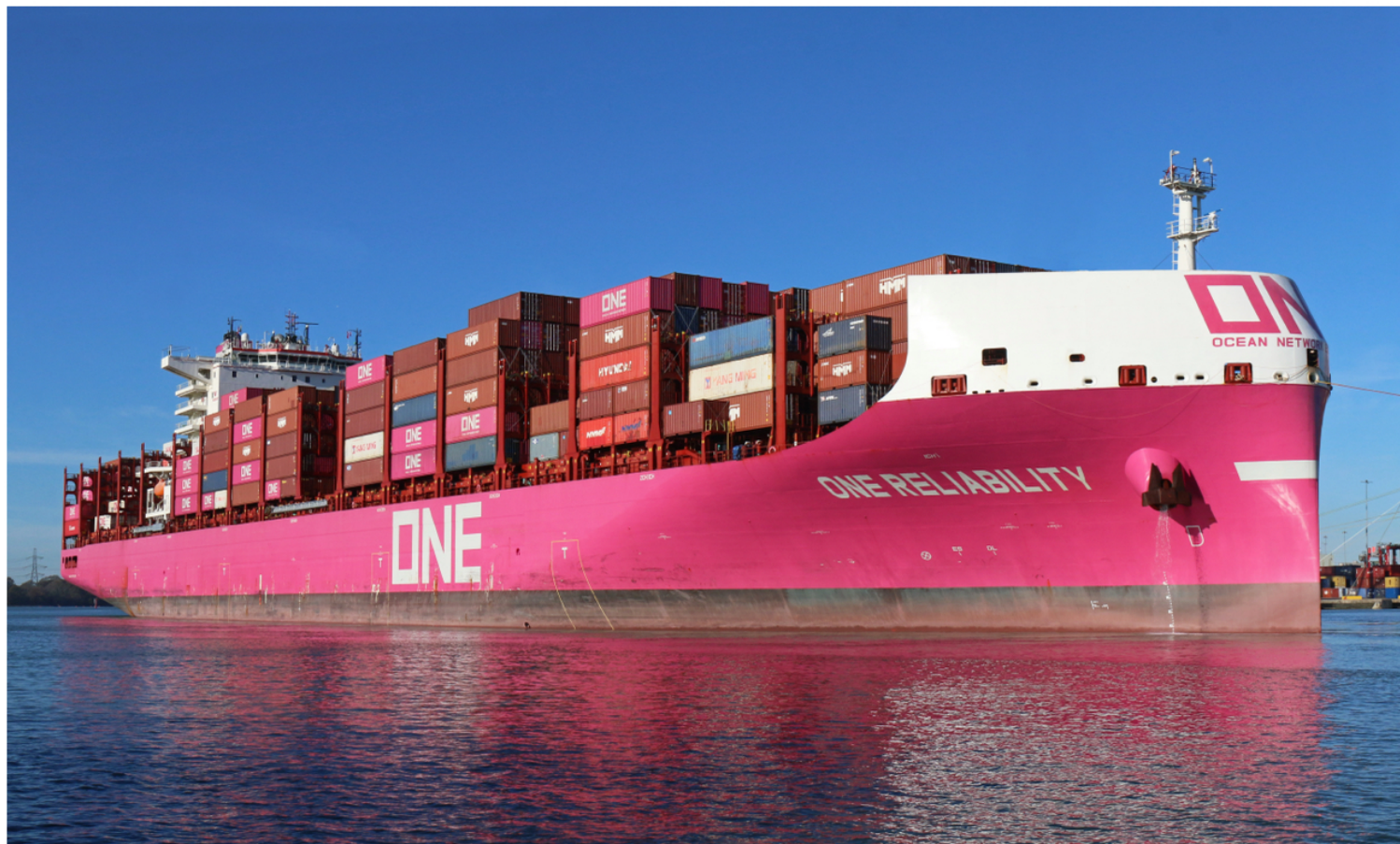
ONE RELIABILITY - arriving at Southampton for berth SCT 3/4 on 21st November.