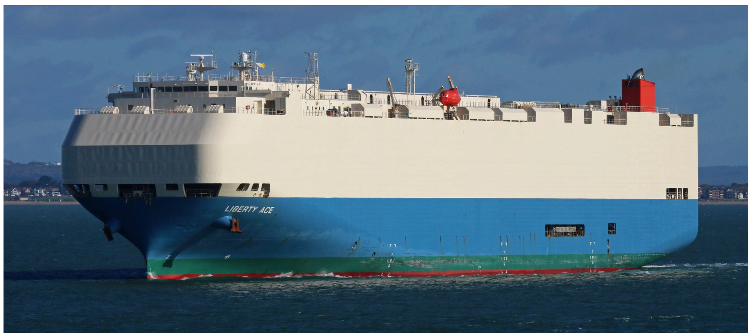
LIBERTY ACE, passing Cowes, for berth 40/41, having arrived from Hamburg on 2nd.