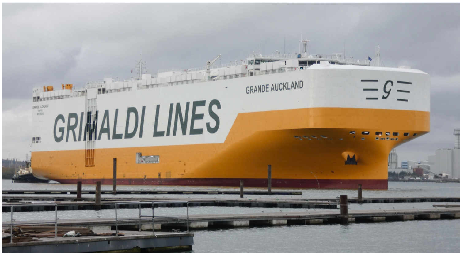
GRANDE AUCLAND - arriving at SGL from Antwerp at end of maiden voyage on the 6th.