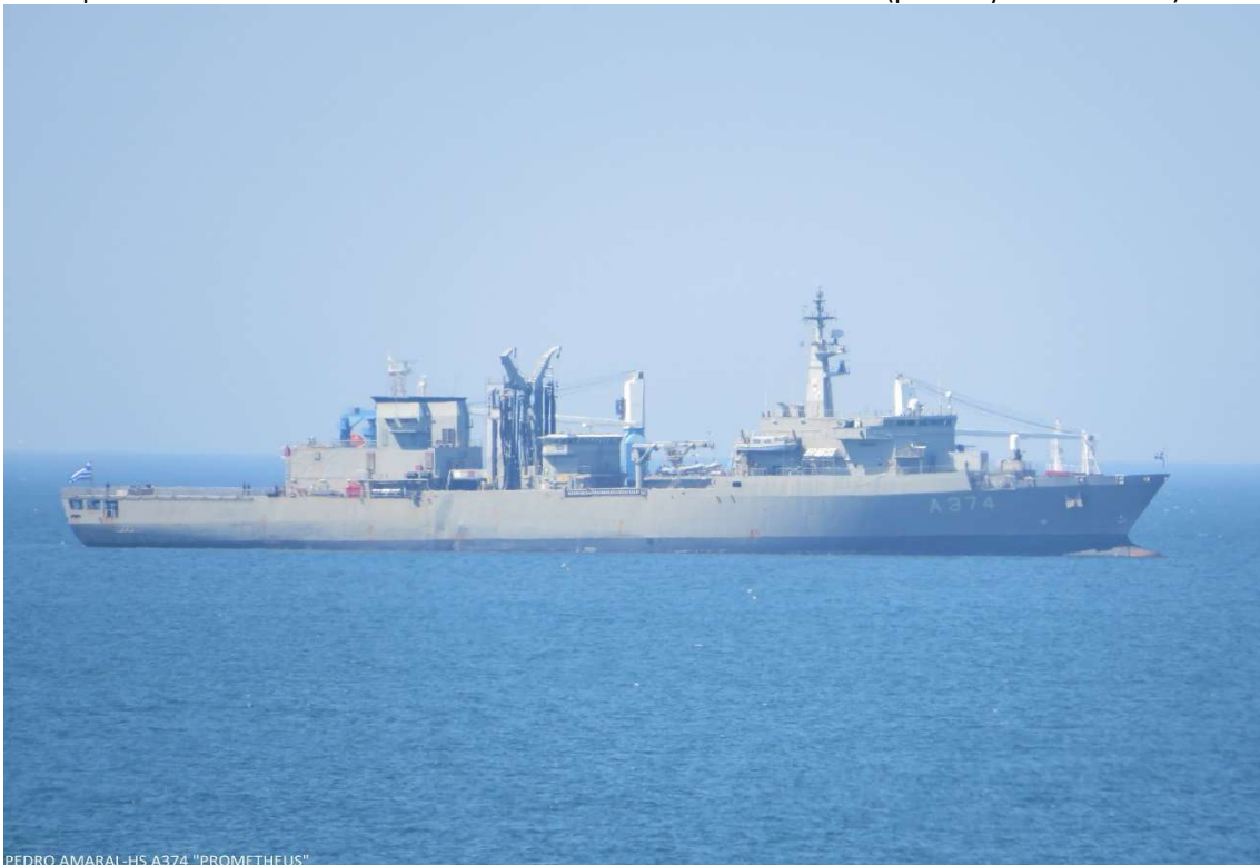
PEDRO AMARAL-HS A374 "PROMETHEUS" HS "Prometheus" A374