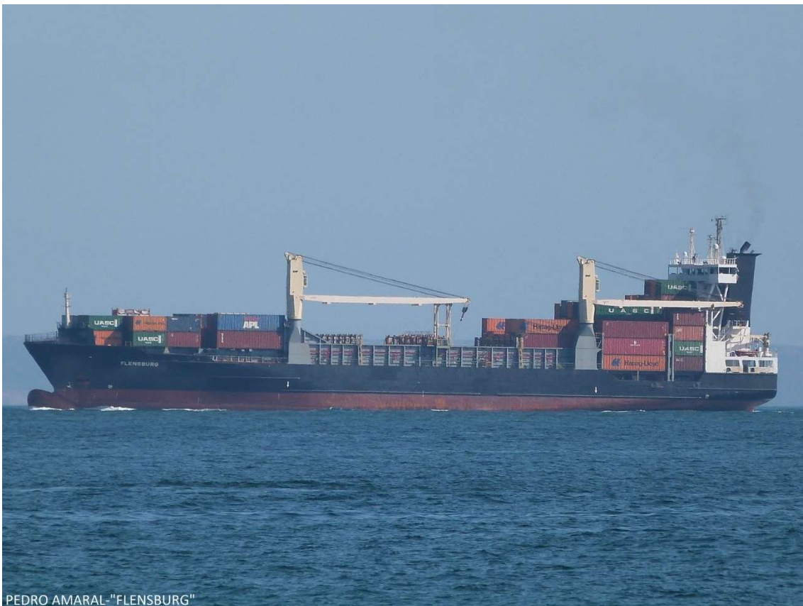
PEDRO AMARAL-"FLENSBURG" Containership "Flensburg"