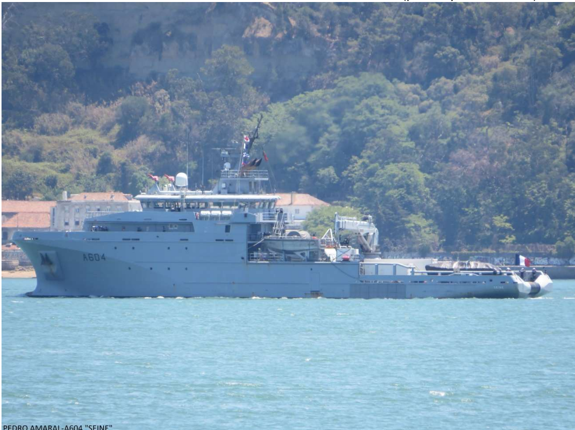
PEDRO AMARAL-A604 "SEINE" FS "Seine" A604