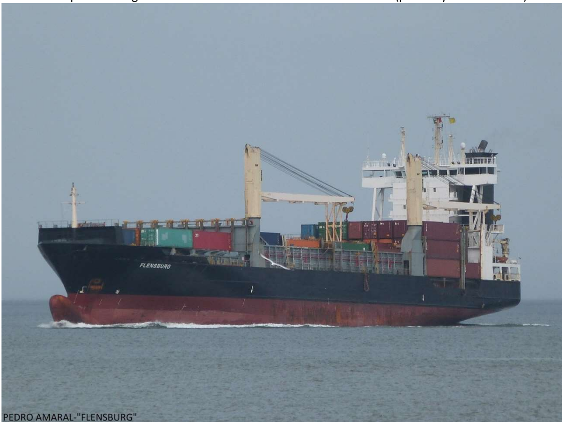
PEDRO AMARAL-"FLENSBURG" Containership "Flensburg"