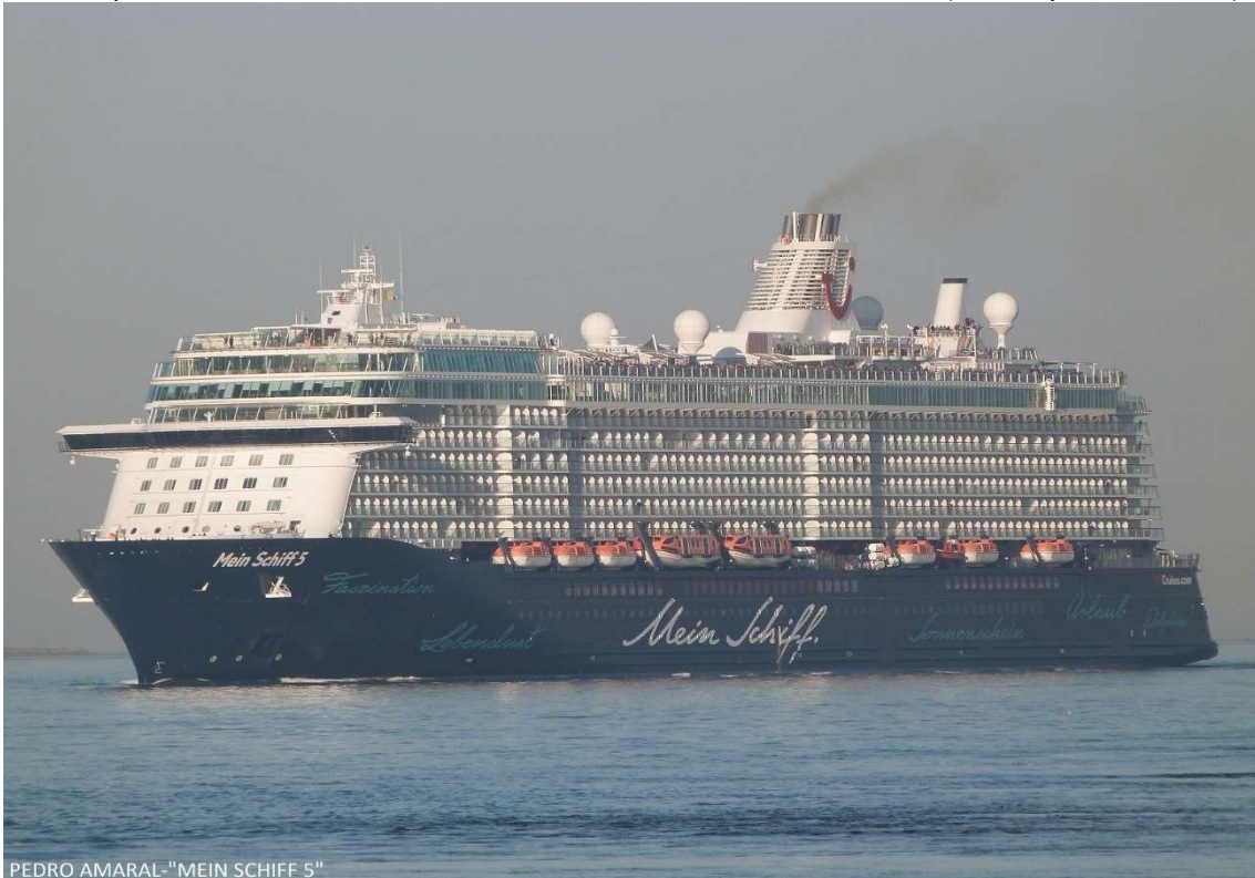
PEDRO AMARAL-"MEIN SCHIFF 5"