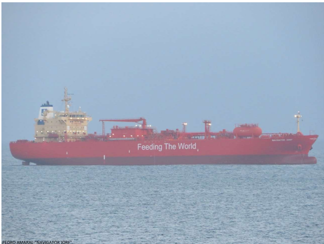
"NAVIGATOR JORF" LPG Tanker"Navigator Jorf"