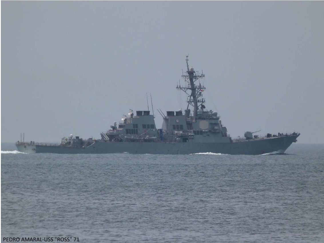
PEDRO AMARAL-USS "ROSS" 71