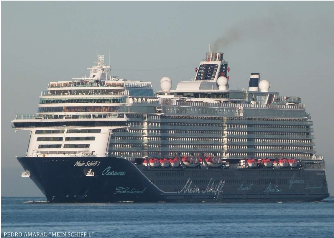
PEDRO AMARAL-"MEIN SCHIFF 1"

This newsletter shows the diversity of type of ships that come to Lisbon, with emphasis on cruise ship schedules and refueling schedules (bunkers) of all types of ships. Schedules for supply operations, over the last few years, have been growing significantly, taking advantage of Portugal's excellent geographical position.