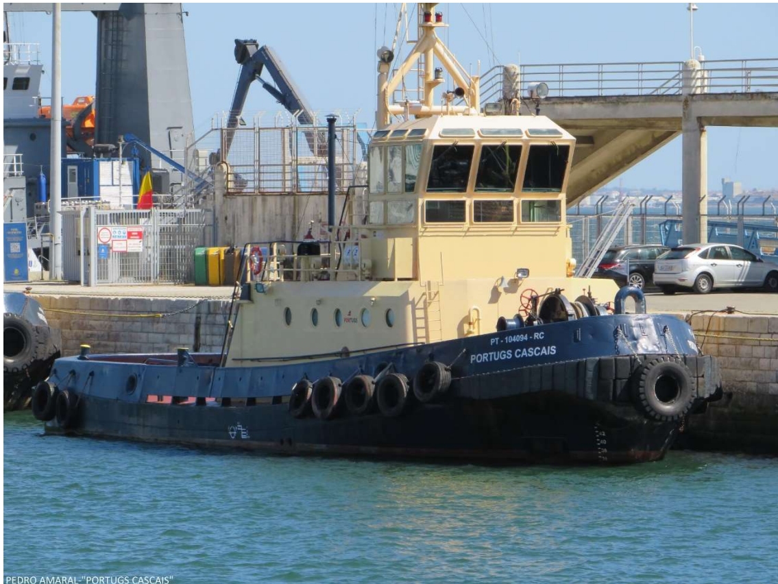
PEDRO AMARAL-"PORTUGS CASCAIS" "Portrugs Cascais"