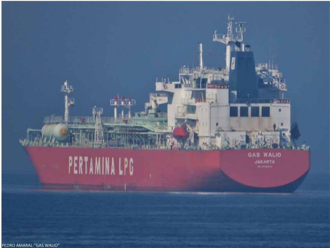
PEDRO AMARAL-"GAS WALIO"