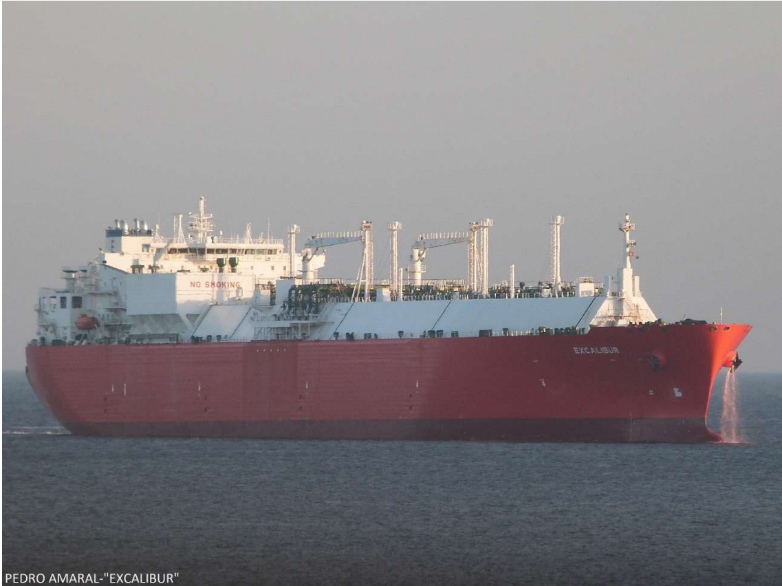
PEDRO AMARAL-"EXCALIBUR" NG's Tanker "Excallibur"