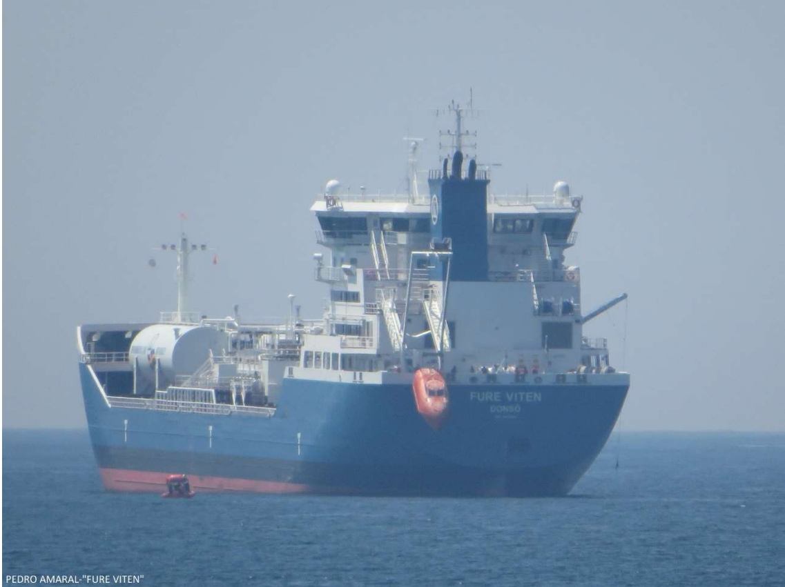
PEDRO AMARAL-"FURE VITEN"

Awaiting service, two tankers were anchored in the bay of Cascais. The Swedish ship “ Fure Viten ”, taking the opportunity to test the existing rescue means on board, specifically the lifeboats and the Indonesian tanker “ Gas Walio ”. Uncommon record here, in Lisbon.