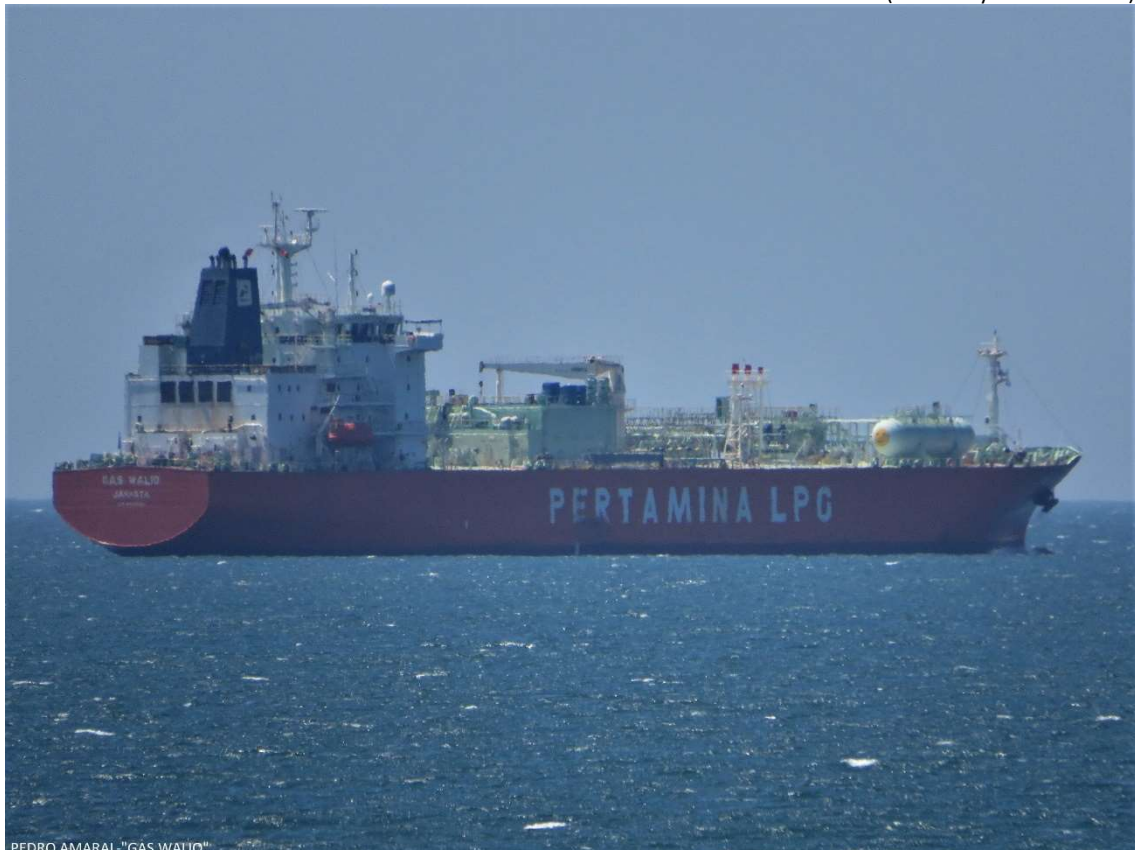
PEDRO AMARAL-"GAS WALIO"