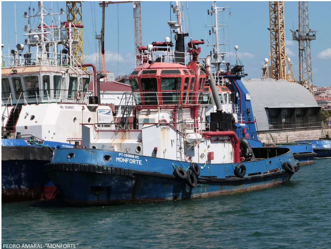
PEDRO AMARAL-"MONFORTE" "Monforte"