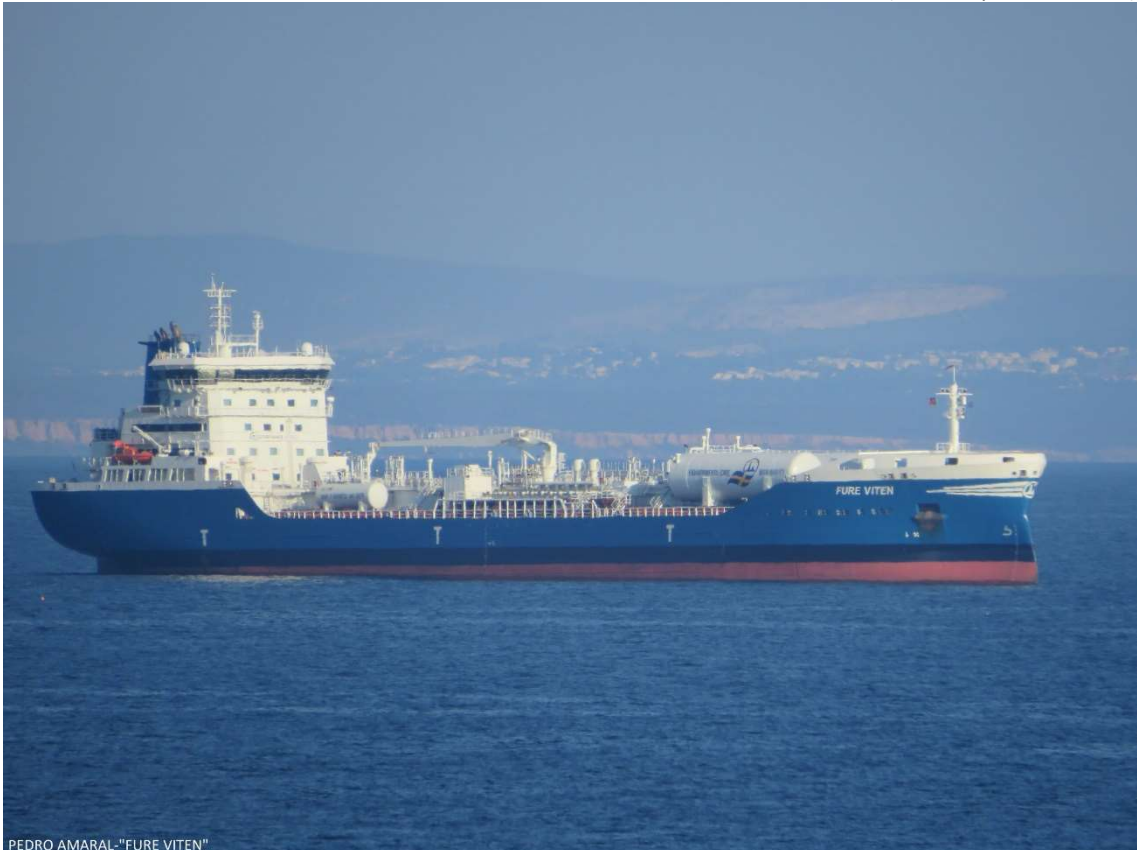
PEDRO AMARAL-"FURE VITEN"