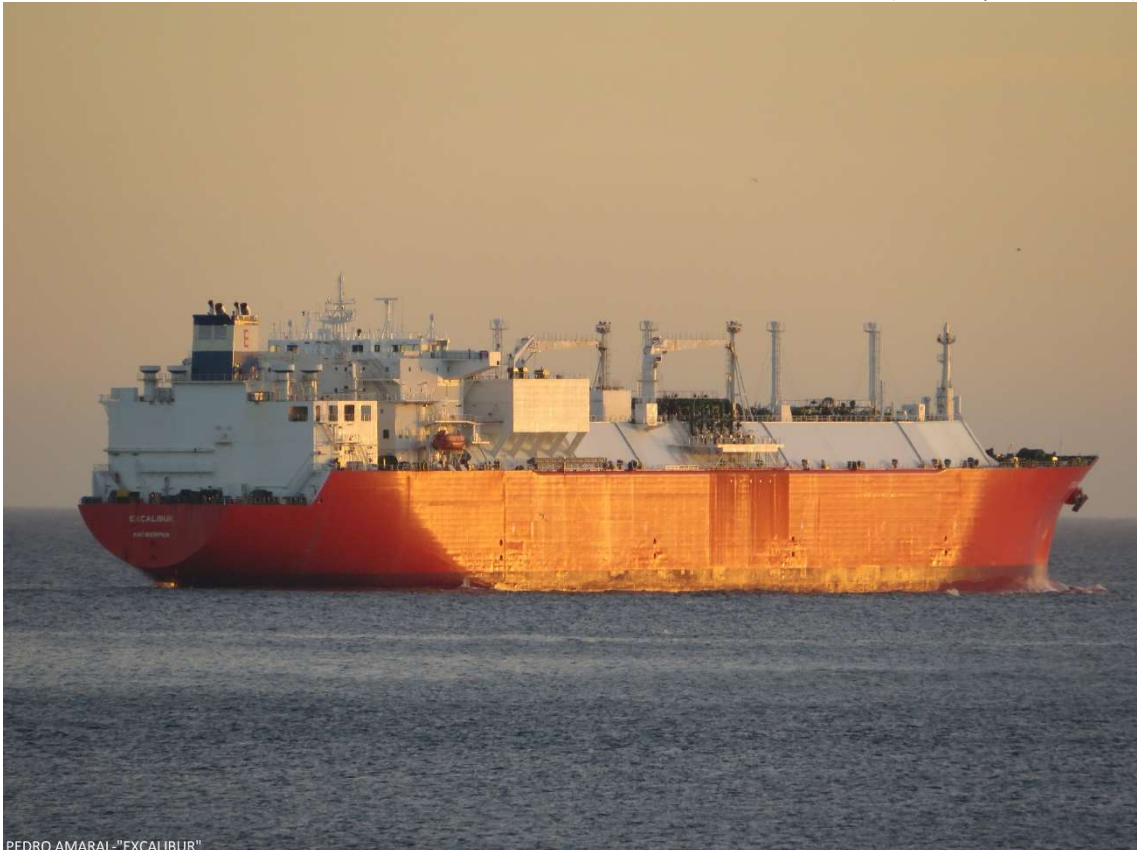
PEDRO AMARAL-"EXCALIBUR" NG's Tanker "Excallibur"