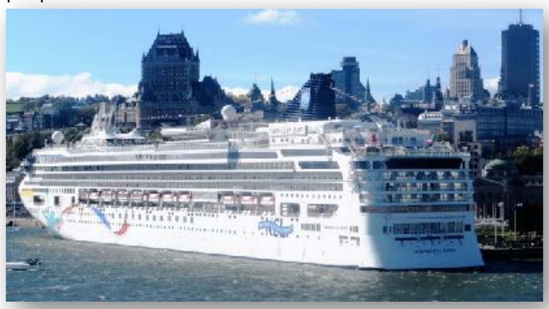
Out of the old shoebox:

Late Summer Sales: The lists are seemingly endless – but as examples cruise travelers can do Royal Caribbean with as much as 60% off or as little as $59 per person per night or Norwegian Cruise at $54 per person.