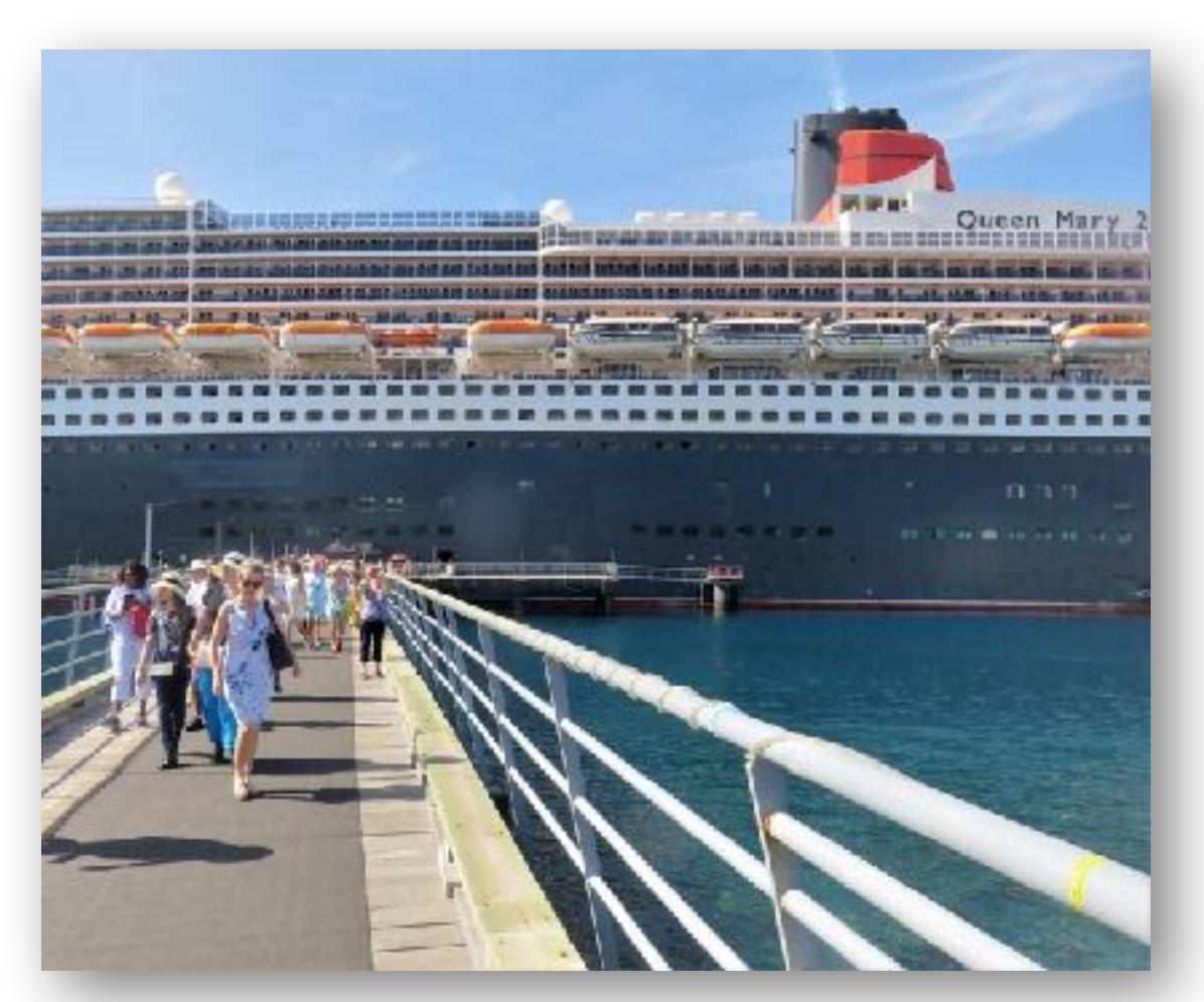
The Panama Canal published a proposal that modifies the waterway's toll structure and the measurement regulations for passenger ships.