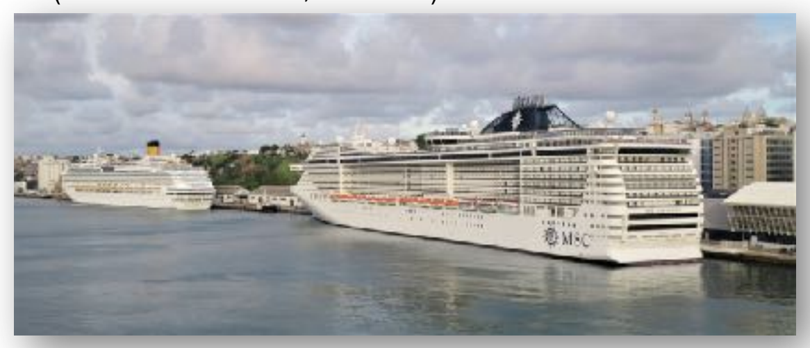
Hong Kong: Genting Hong Kong, with its Dream Cruises, has completed its first month of cruises from Hong Kong & with great success.