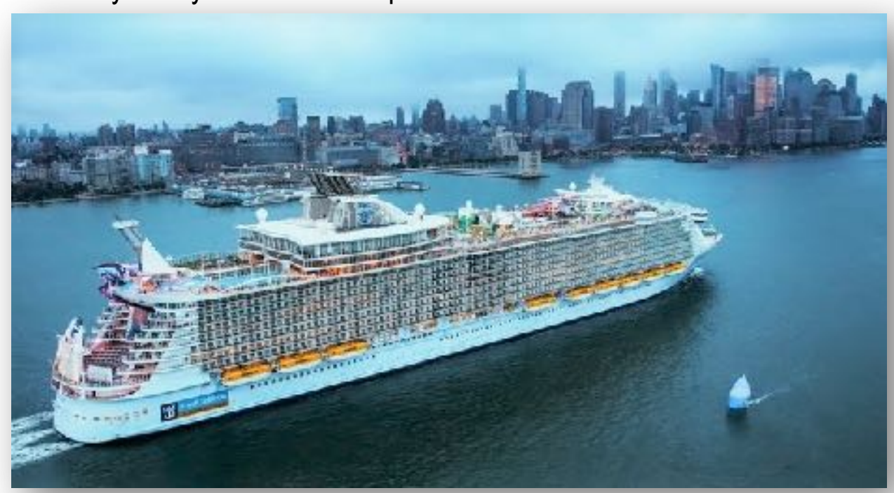
Sat Sep 4 th Brazil : After a silent winter cruise season in 2020-21, several cruise lines including Costa & MSC are preparing for full '21-22 winter (summer down there, of course) seasons of cruises.

night voyages to the Bahamas. Through the end of October, the Oasis is making weekly visits to Nassau, Port Canaveral and Perfect Day at CocoCay – Royal Caribbean's private island in the Bahamas.