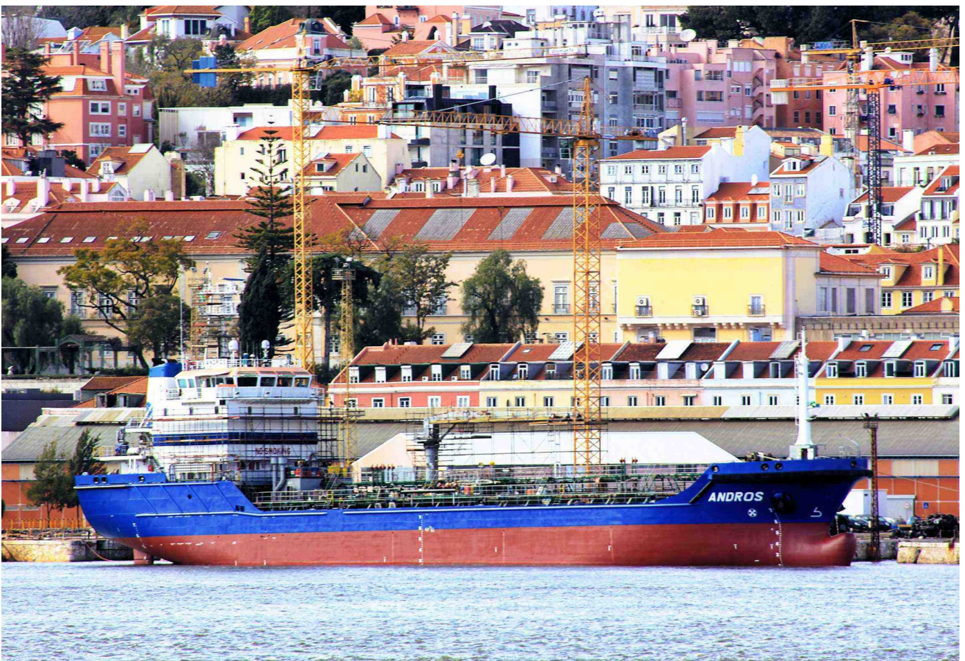
Bunkering / Oil products tanker “ Andros ” at the Navalrocha Ship Yard, having some maintenance. Owned by Andros Marine, Greece, she flies the Cypriot flag. She was built in China by Fujian Southeast Shipyard, Fuzhou in 2010.