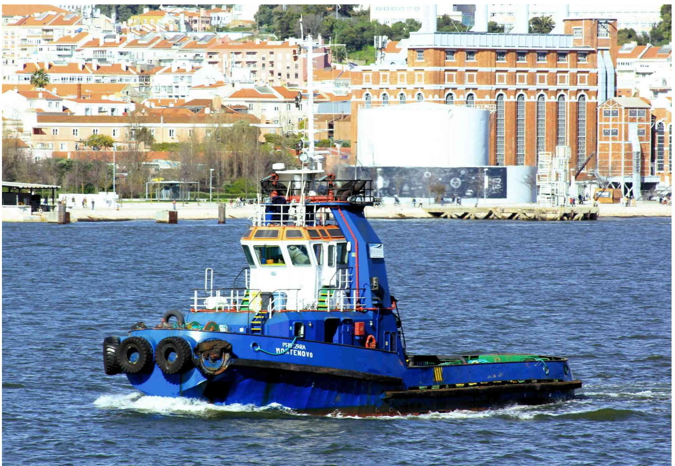
Lisbon based tug “Montenovo” was built in Spain in 2003 by Ria de Aviles, San Juan de Nieva, and owned by Rebonave, Setubal.