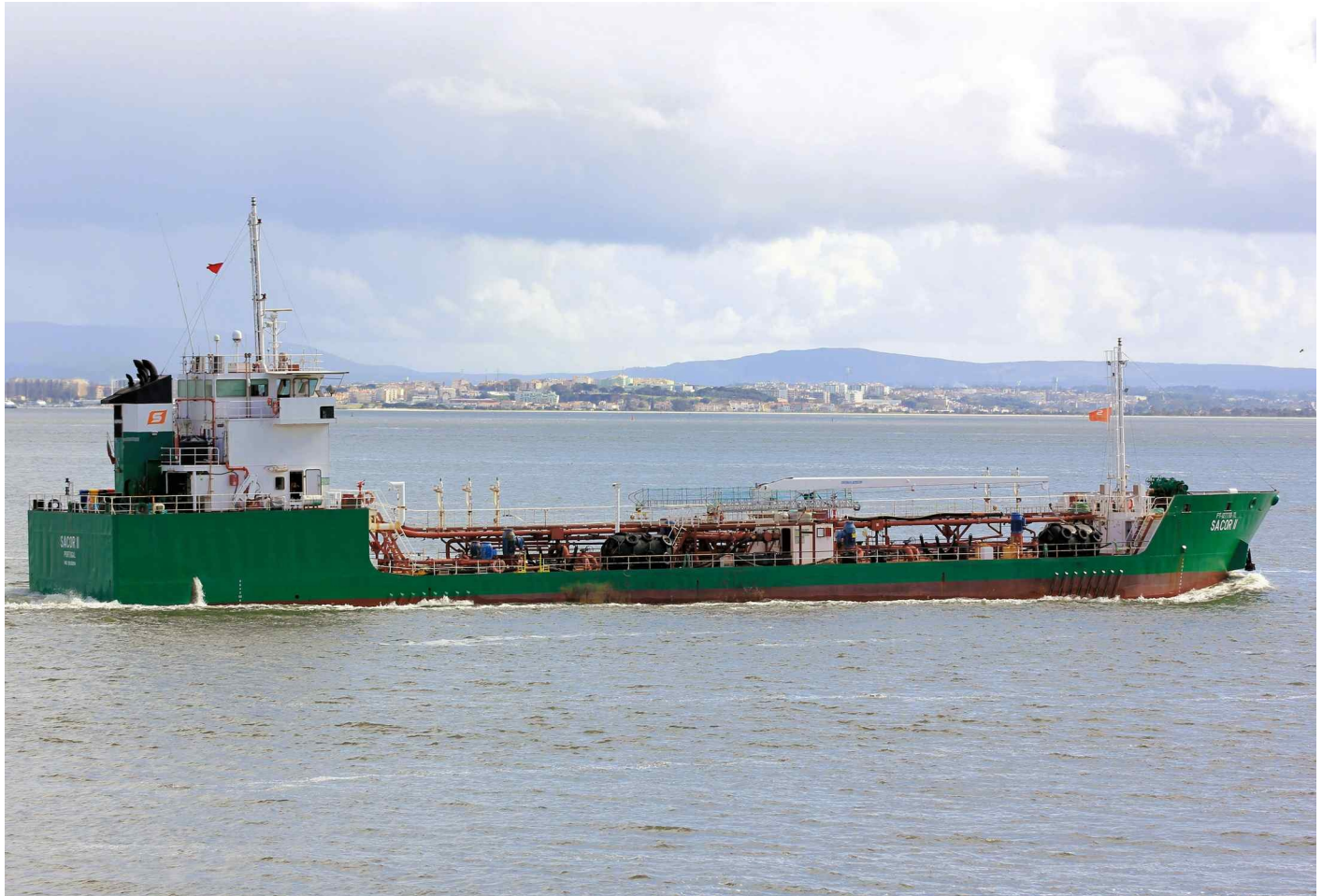
Bunkering tanker “Sacor II” serves many ships calling for bunkers seen here making her way past the cruise berths. She was built in Portugal by EN de Peniche in 2012.