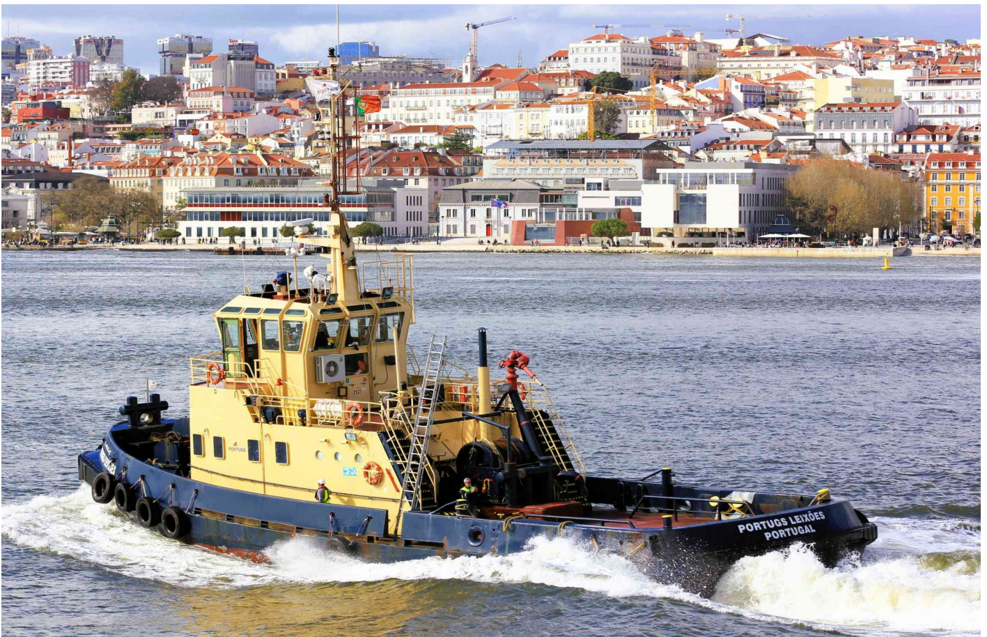
Former Wijsmuller tug “Portugus Leixoes” showing a turn of speed. She was launched on 1 st December 1980 and completed in January 1981 by Tille, Koostertille, Netherlands for Wijsmuller as “Groningen” . Svitzer acquired her in 2005 as “Svitzer Leixoes” and Portugus II-Reboques acquired her and renamed her in 2020.