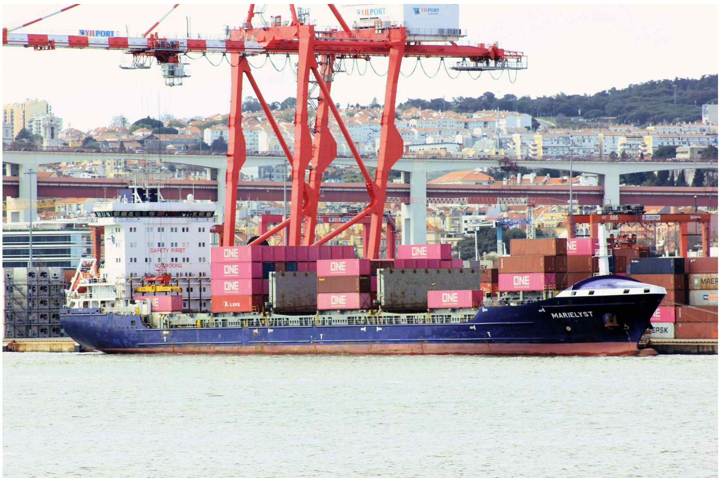
“ Marielyst ” alongside Liscont terminal now wholly owned by Yilport Holdings of Turkey since 2022. Trading under the Portuguese (Madeira) flag she is owned in Germany. She gained her current name in 2017 and was previously “ E.R. Riga ” and “ Leguan ”. She was completed in China by Nanjing Wujiazui in September 2010.