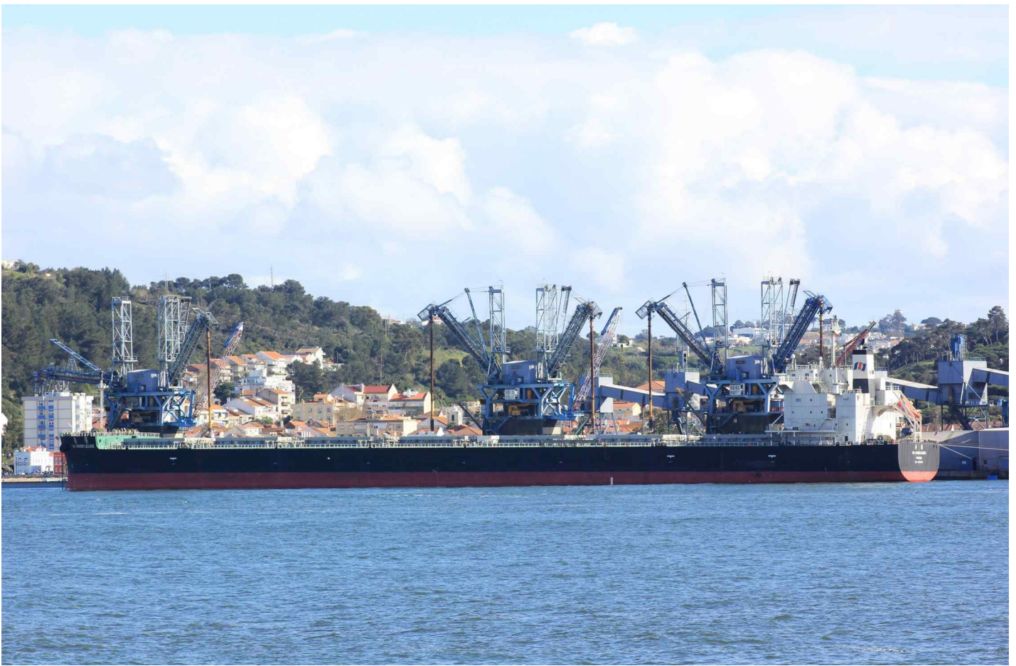
“Tai Knowledge” at Silopor’s Trafaria, Foodstuff bulk terminal. Situated on the south side of the Tagus with two deep water berths. The port also has two other foodstuff bulk terminals on the south bank of the Tagus, and there is a dedicated cement terminal. “Tai Knowledge” was built in 2017 by Oshima Shipbuilding, Sakai for Tai Shing Maritime of Japan