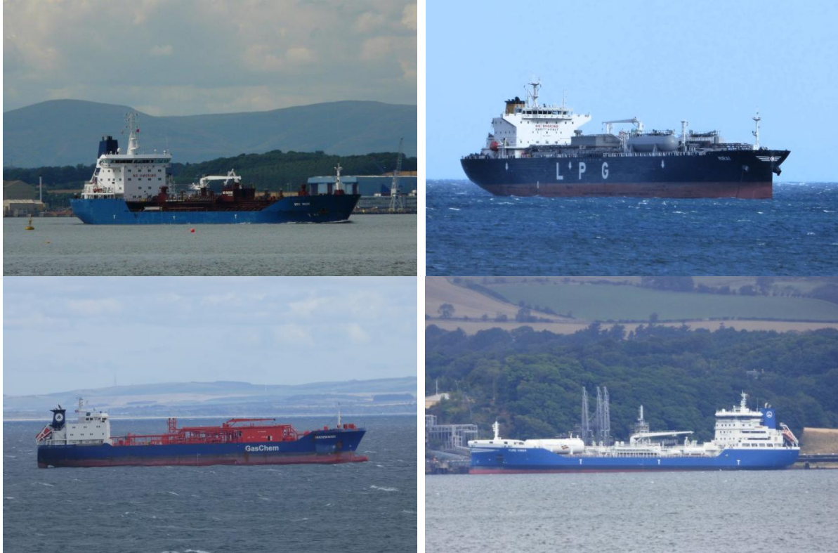
Above left Gaschem Mosel; right Fure Vinga at Braefoot a sister ship of Fure Ven

Below left: Bro Nuuk on an visit from Grangemouth: right MIRAI