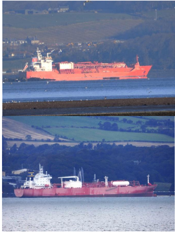
Above left: KOKSIJDE right: MARCELLUS LADY