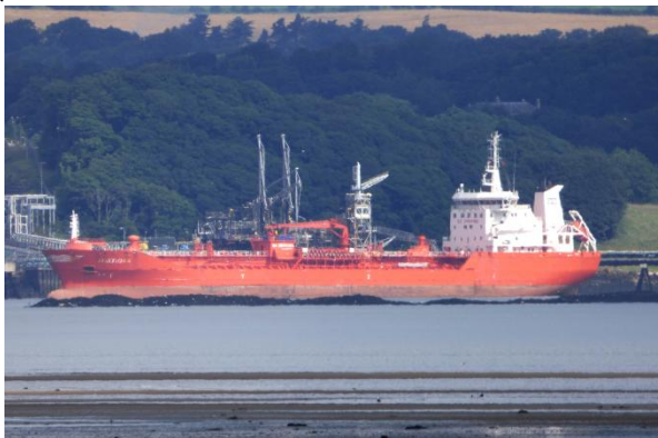
ABOVE Sten Nordic (Kirkcaldy anchorage) and Stavfjord (Braefoot)