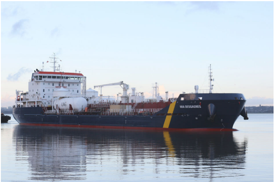
MIA DESGAGNES '17/12061, a Chemical/Products Tanker shown inbound in the Eastham Channel on 19/1/23. Canada flag. Transport Desgagnes Inc. Built in Turkey. IMO 9772278.

Pictorial Record for Mersey Waterfront Ship Enthusiasts and Onlookers