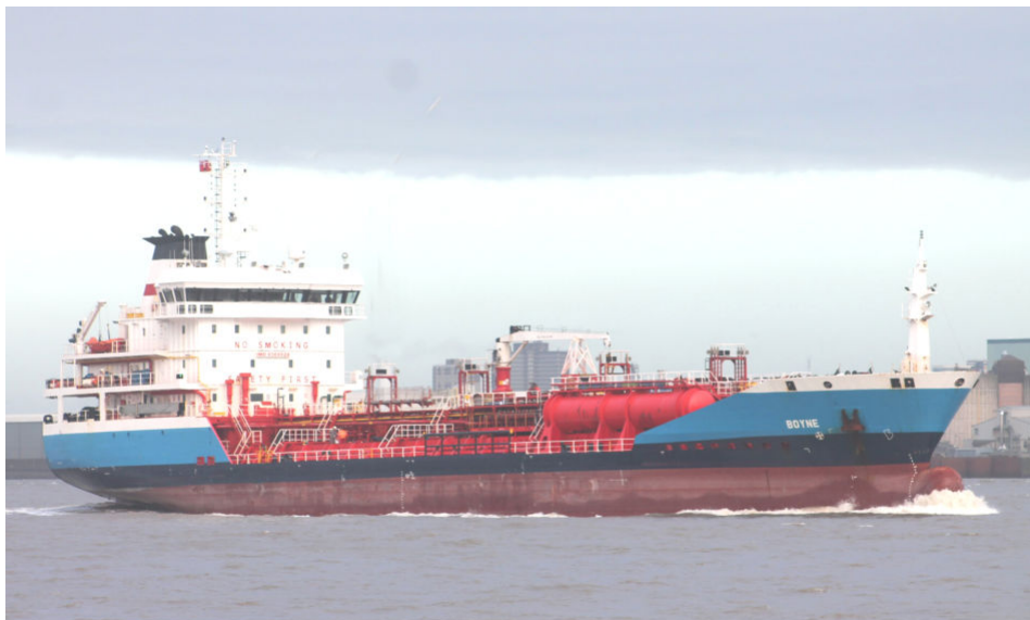
BOYNE '07/3974, a Chemical/Products Tanker shown from New Brighton inbound for Eastham on 25/1/23. Malta flag. Besiktas Likid Tasimacilik Denizcilik Ticaret AS, as managers. Ex-FETEKÖZ-'18, KARAGÖL-'09. Launched as NAZLIM-'07. IMO 9369928.