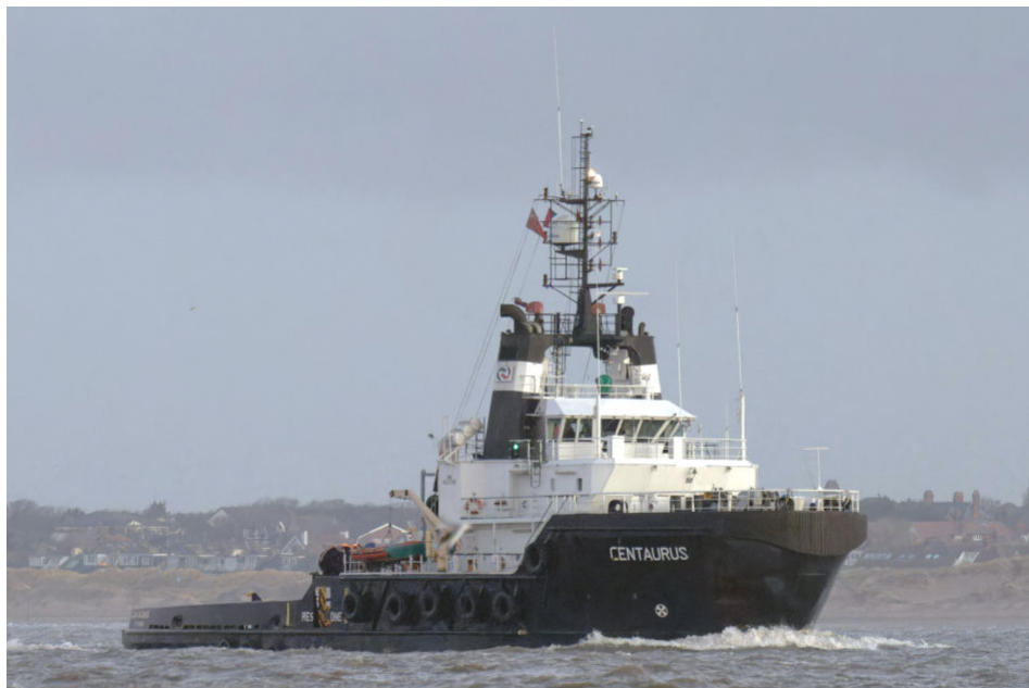
CENTAURUS '09/1262, an Ocean Tug shown from New Brighton inbound in the Mersey on 20/1/23. Antigua & Barbuda flag. Marlow Ship Management Deutschland GmbH & Co KG, as managers. IMO 9433755.