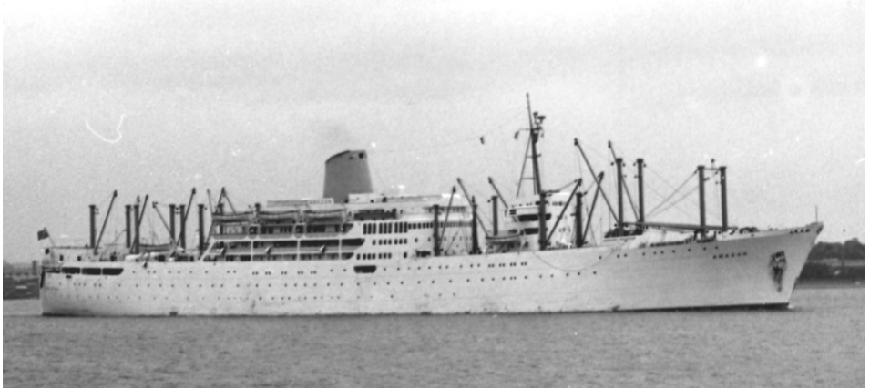
AMAZON 59/20368, a Passenger//Refrigerated Cargo ship shown at Southampton on 13/7/65. United Kingdom flag. Royal Mail Lines Ltd. Built at Belfast by Harland and Wolff Ltd. Renamed AKAROA in 1968 and AKARITA in 1971. Sold on in 1977 and converted to a Vehicles Carrier. Broken-up at Kaohsiung in 1982. LR/IMO 5013648.