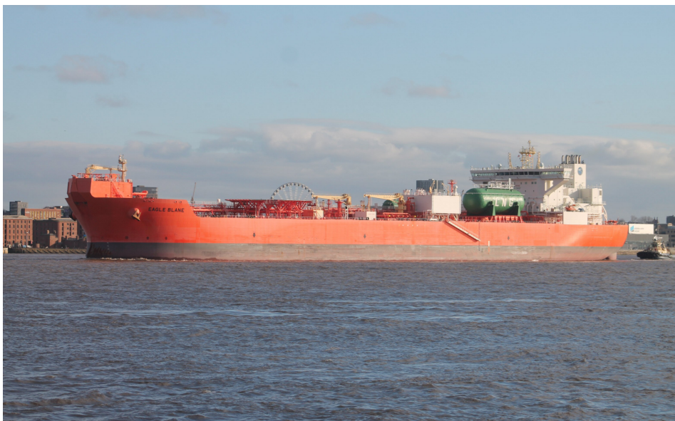
EAGLE BLANE '20/85745 , a Shuttle Tanker shown from Seacombe outbound from Tranmere Oil Terminal for Le Havre, France on 26/1/23. Norway International flag. AET Sea Shuttle II AS. IMO 9833101.