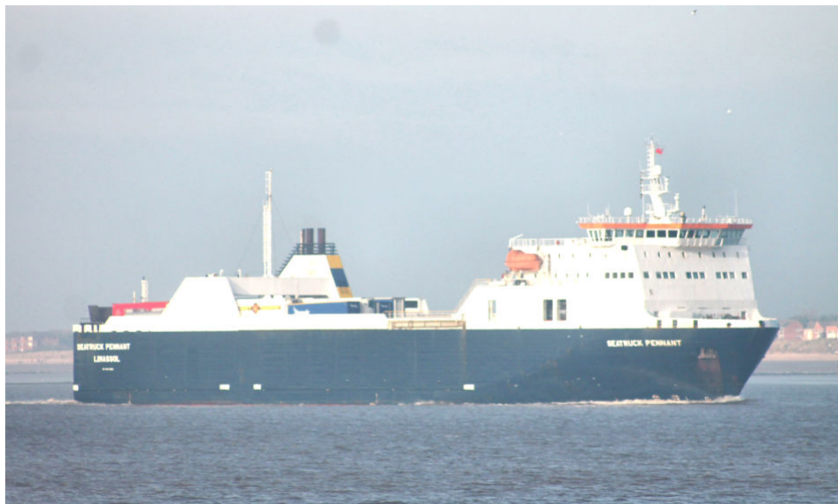
SEATRUCK PENNANT '09/14759, a Ro-Ro Cargo Ship shown from New Brighton inbound for Liverpool from Dublin on 21/1/23. Cyprus flag. CLdN Ro-Ro S.A. Ex-CLIPPER PENNANT-'22. Launched as CLIPPER PANORAMA-'09. IMO 9372688.