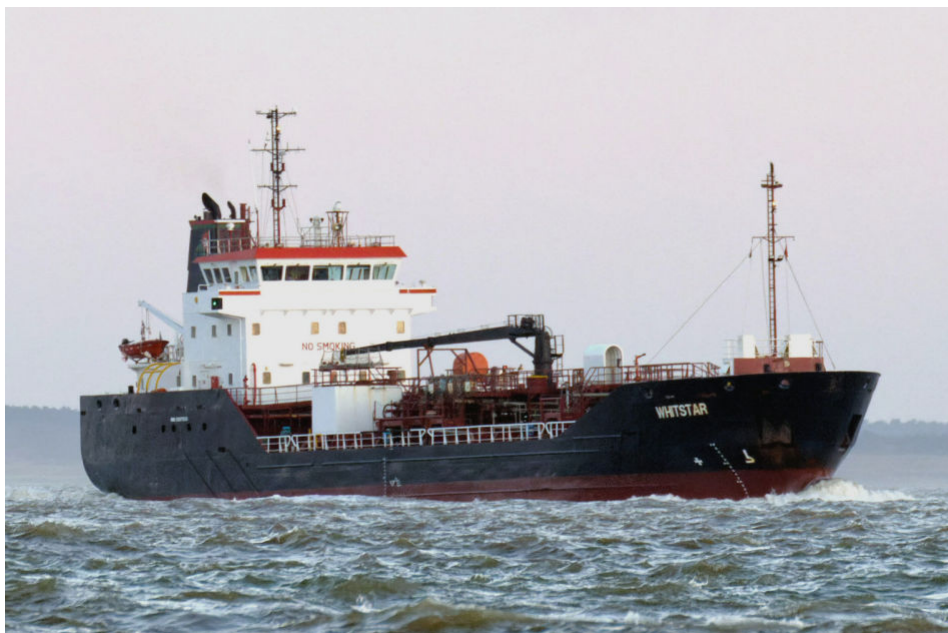
WHITSTAR '04/2159, a Products Tanker shown from New Brighton inbound for Liverpool on 20/1/23. United Kingdom flag. John H Whitaker (Tankers) Ltd. Ex-BORDER HEATHER-'10. IMO 9287833.