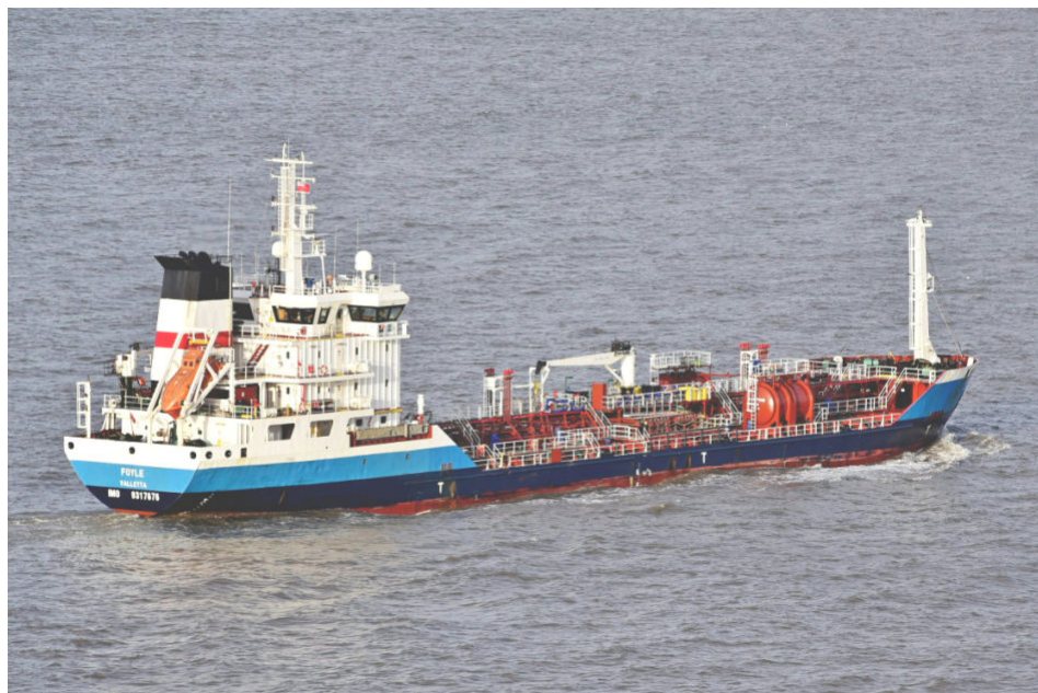
FOYLE '05/3171, a Bunkering Tanker shown from the Pier Head outbound from Eastham on 6/1/23. Malta flag. Besiktas Likid Tasimacilik Denizcilik Ticaret AS, as managers. Ex-FIRDES-'20, RN OLYMP-'19, FIRDES-'13. Converted from a Chemical/Products Tanker in 2015. IMO 9317676.