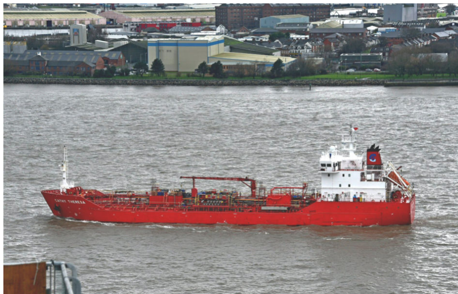
CATHY THERESA '11/5706, a Chemical/Products Tanker shown from the Pier Head inbound for Eastham on 10/1/23. Denmark International flag. Herning Shipping AS, as managers. IMO 9478315.