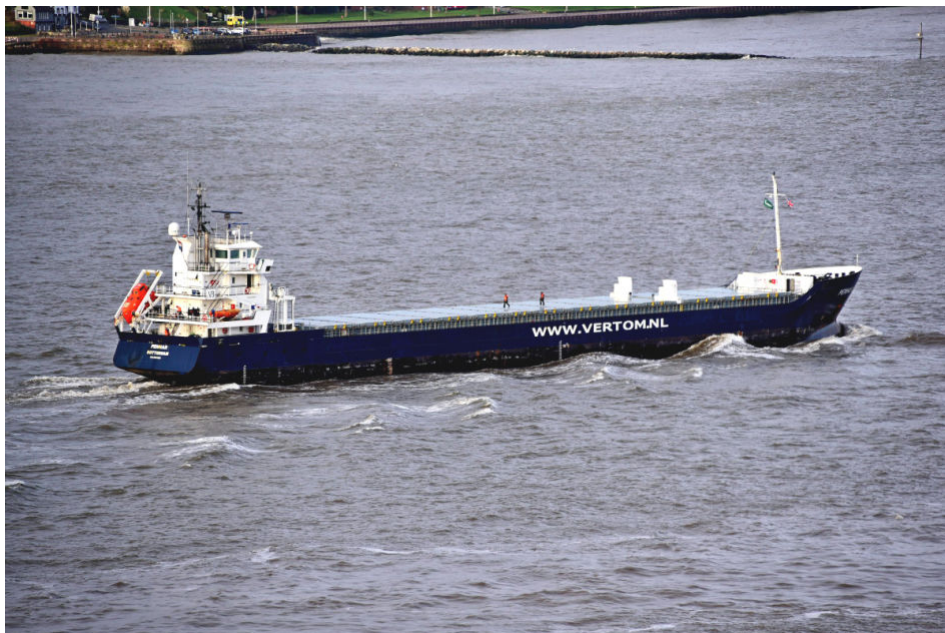
PENHAR '10/4106 a General Cargo Ship shown from the Pier Head outbound from Birkenhead on 6/1/23. Netherlands flag. Vertom UCS Holding BV, as managers. Ex-CFL PENHAR-'15. IMO 9534365.