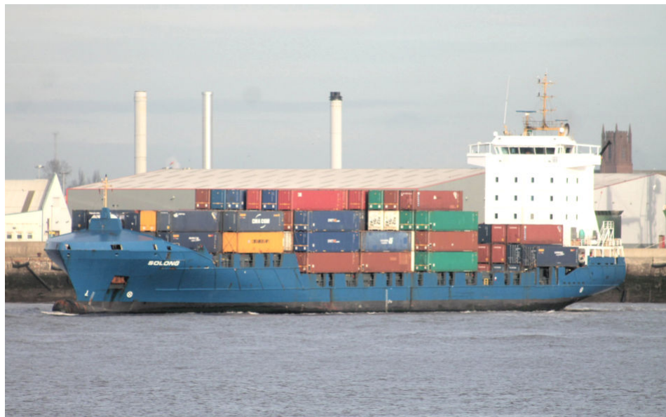
SOLONG '05/7852, a Container Ship shown from New Brighton outbound from Liverpool on 6/1/23. Portugal flag. Ernst Russ Maritime Management GmbH & Co KG. Ex-SLEIPNER-'16, HALLAND-'07. IMO 9322554.