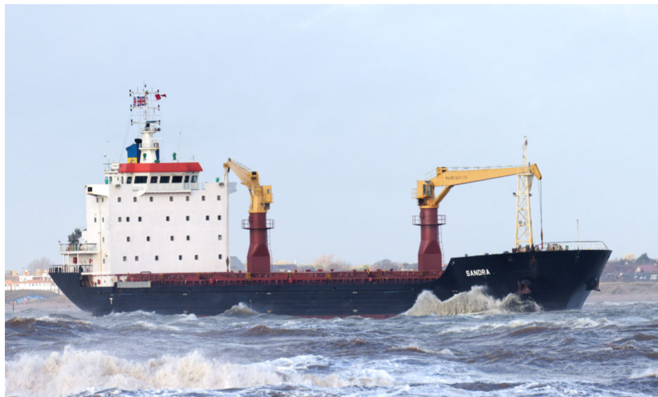
SANDRA '09/8604, a General Cargo Ship shown from New Brighton inbound for Birkenhead on 14/1/23, with Urea from Egypt. Liberia flag. Intresco Ltd-BVI, as managers. Ex-BALTIC PRINCESS-'19, BENEDITO-'17, SUNFLOWER E-'15.