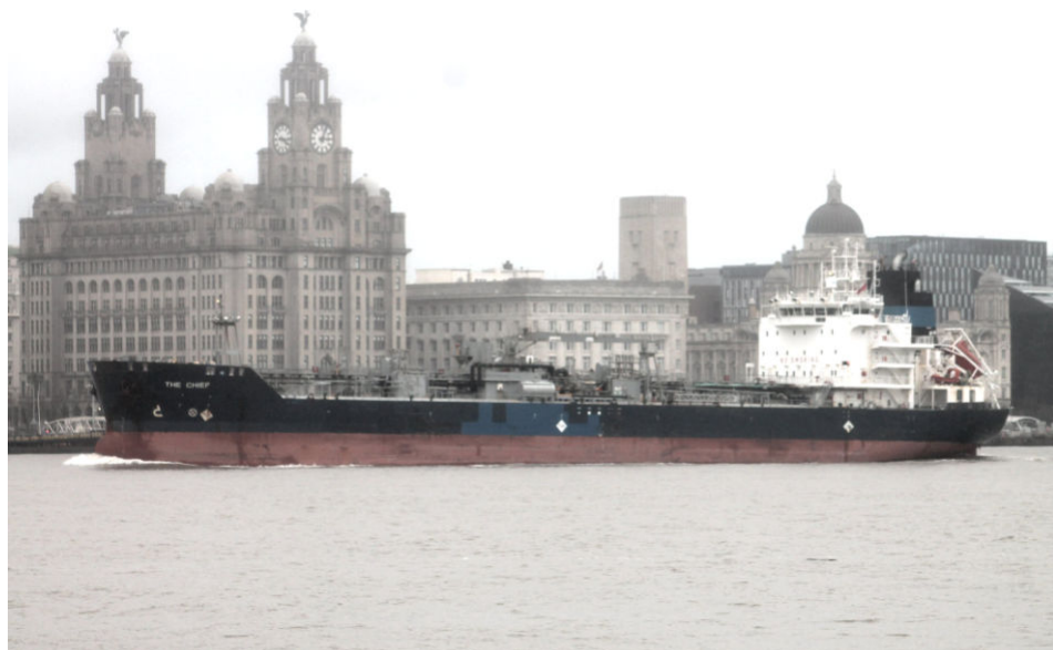
THE CHIEF '13/10830, an Asphalt/Bitumen Tanker shown from Seacombe outbound from Eastham on 28/1/23. Marshall Islands flag. Trafigura Maritime Logistics Pte Ltd, as managers. Ex-PALANCA SINGAPORE-'19. IMO 9492361.