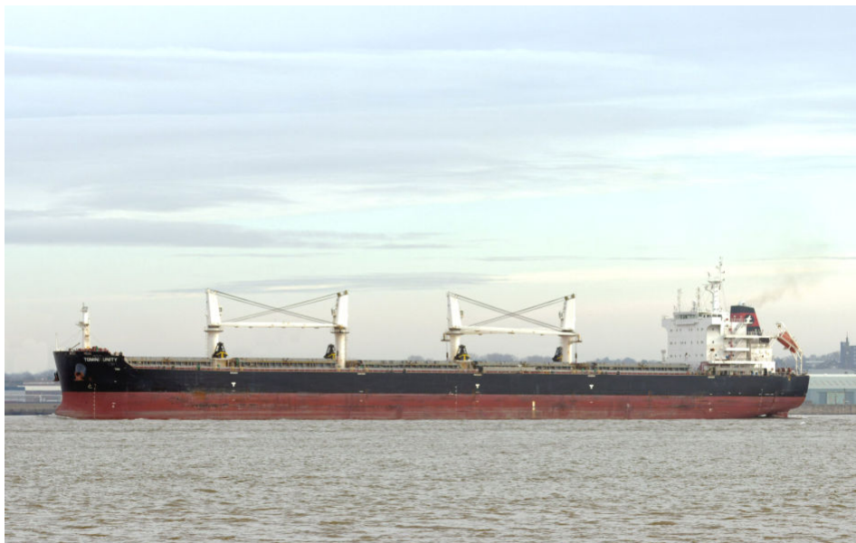
TOMINI UNITY '17/36415 , a Bulk Carrier shown from New Brighton outbound from Liverpool for Antwerp, Belgium on 23/1/23. Marshall Islands flag. Tomini Transport LLC. IMO 9718167.