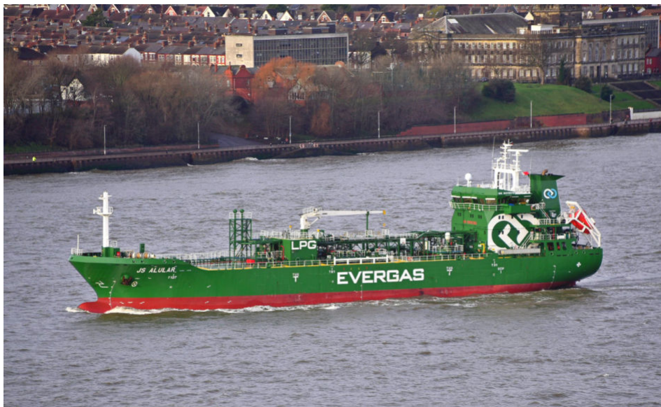
JS ALULAR '12/5036, a Liquefied Petroleum Gas Tanker shown from the Pier Head inbound for Eastham on 6/1/23. Singapore flag. Greenship Offshore Manager Pte Ltd, as managers. IMO 9578012.