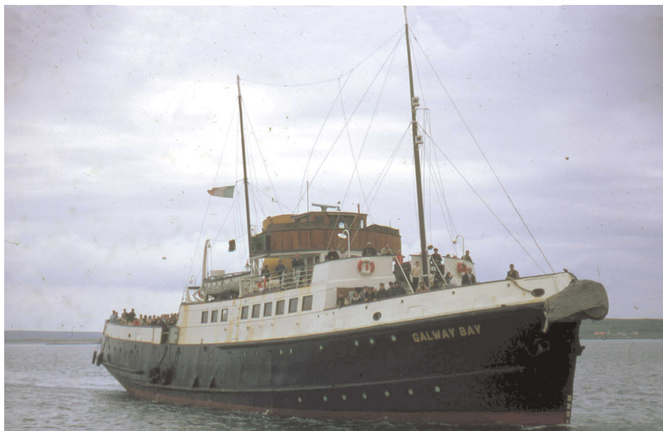
GALWAY BAY '30/702 , a Ferry shown at Galway in 1969. Ireland flag. Galway Ferries Ltd. Built at Woolston by Thornycroft as CALSHOT until 1964. Re-engined and converted from Tug/Tender in 1964. Sold on in 1990, renamed CALSHOT and preserved at Southampton. IMO 5058155.