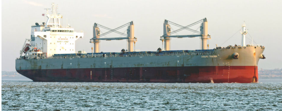
ENDURO TRADER '20/36106, a Bulk Carrier shown from New Brighton inbound for Liverpool on 21/1/23 to load Scrap Metal. Panama flag. Ratu Shipping Co SA. IMO 9856282.