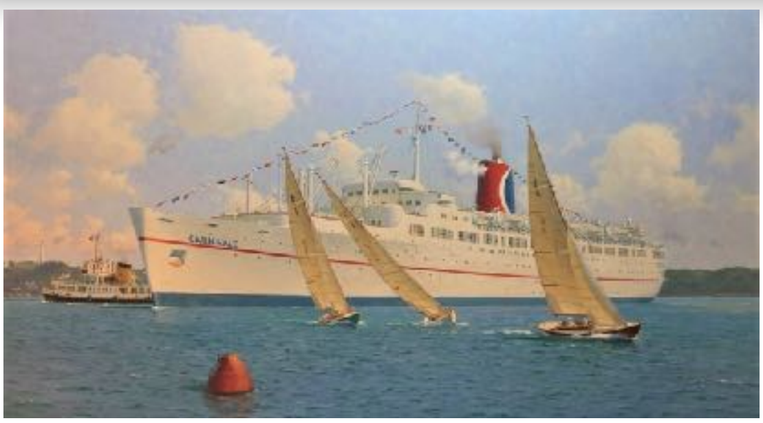
Carnival's 2<sup>nd</sup> ship, the Carnivale (1976) and below the Festivale passes the Mardi Gras, the Company's very first ship