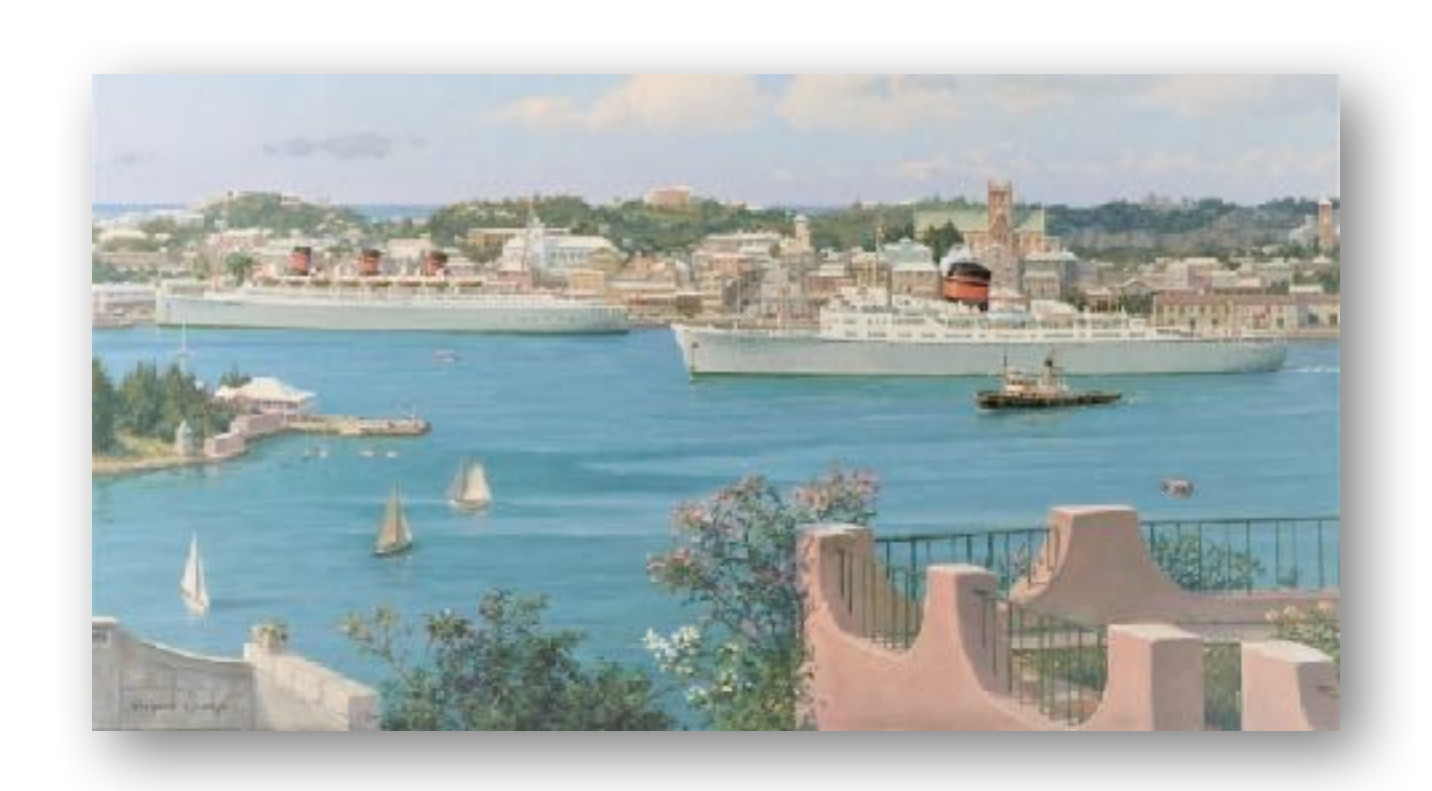
But now back to beautiful, peaceful Bermuda