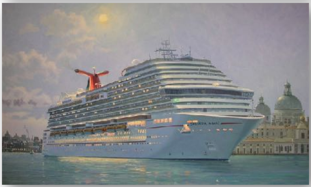
The Carnival Magic departing Venice ... and below, for pure Bermuda nostalgia, the Queen of Bermuda & Ocean Monarch together at Hamilton in the 1950s