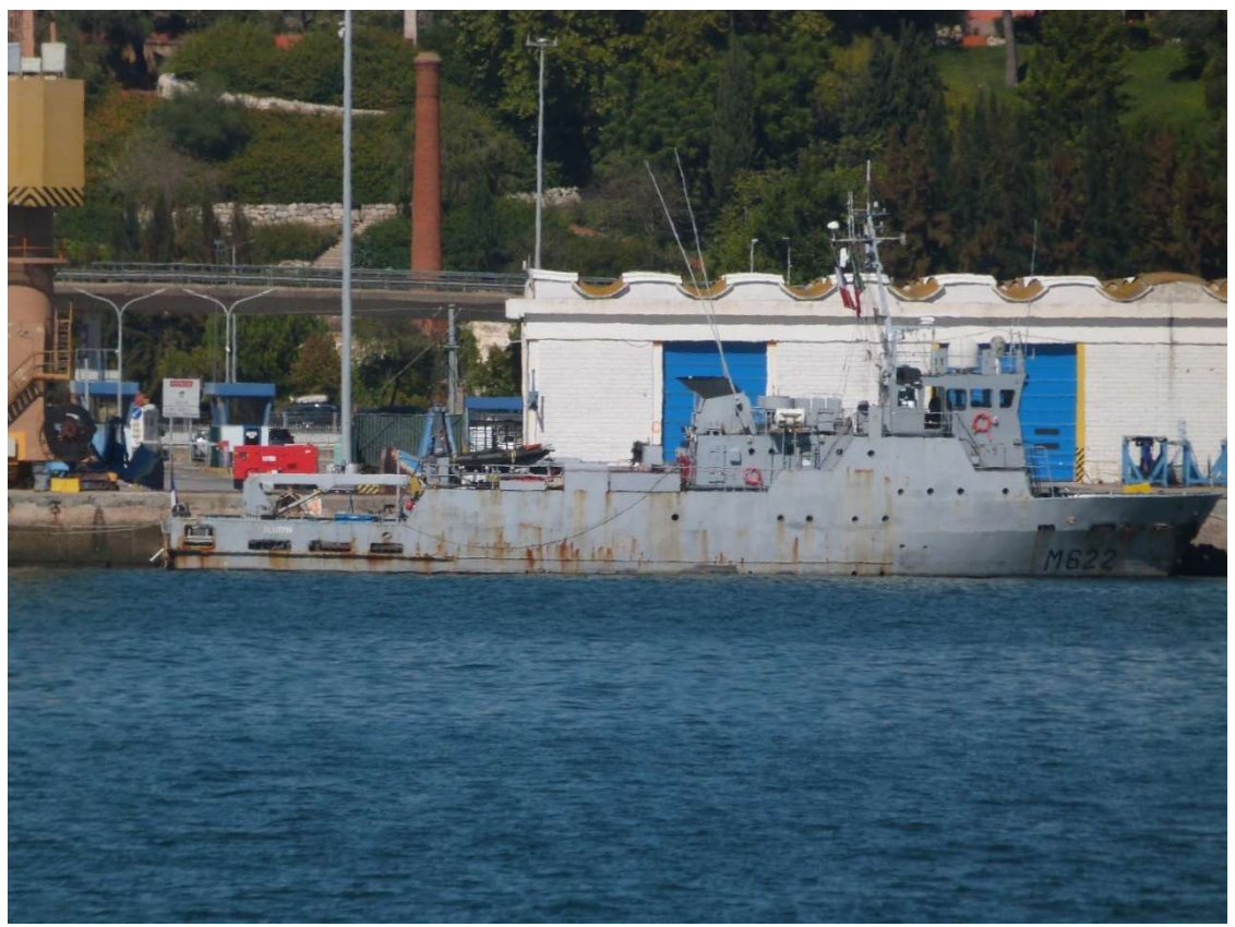
"Puiton" M622 and "A5327" Stromboli"