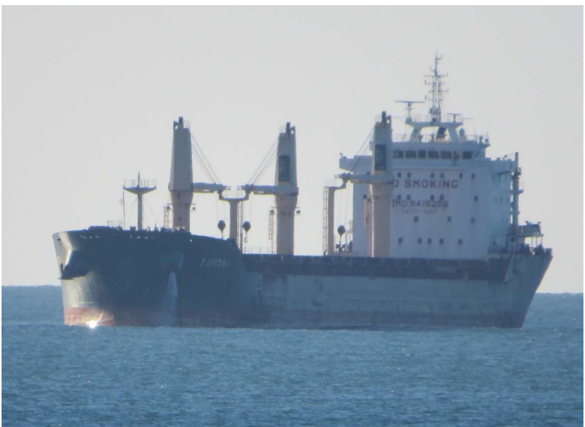
Bulkers "Jessica B" and "Tundra"