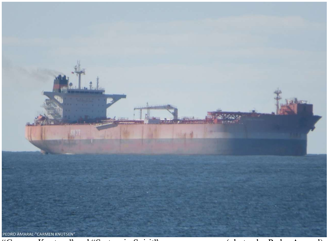
"Carmen Knutsen" and "Sertanejo Spirit"

Although it is not very common, we always register the presence of tankers in the bay of Cascais, either to wait for entry into the Lisnave Naval Shipyards, in Setúbal or to refuel in Lisbon, after repairs in these shipyards.