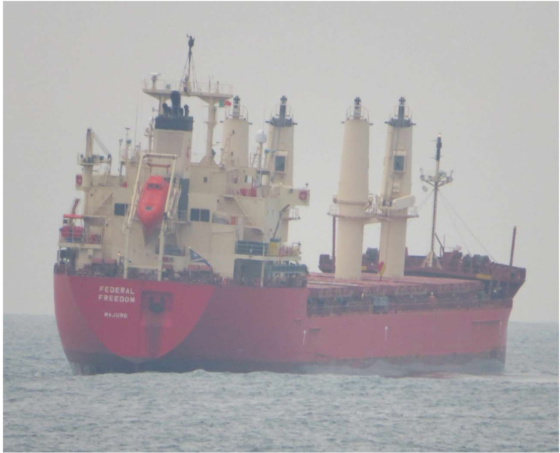
Bulkers "Federal Rideau" and "Federal Freedom"